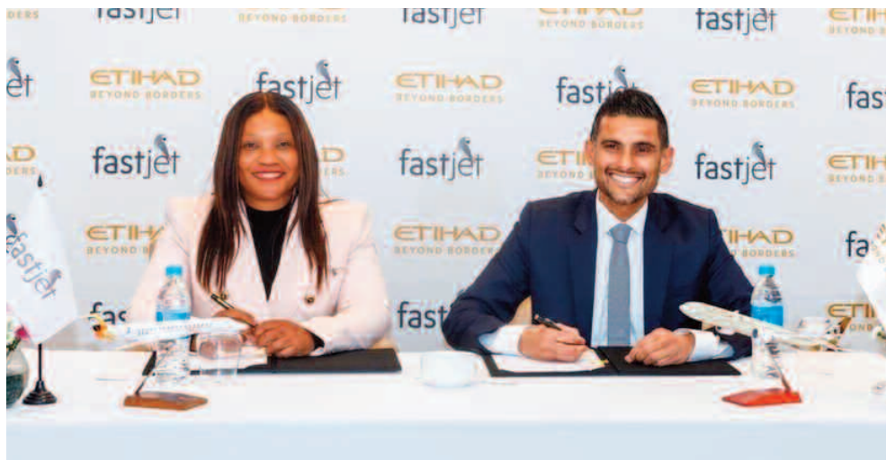
For Fastjet Zimbabwe, the partnership opens the door to Abu Dhabi and Etihad's wider global network

For Fastjet Zimbabwe, the partnership also opens the door to Abu Dhabi and Etihad's wider global network. Those making a