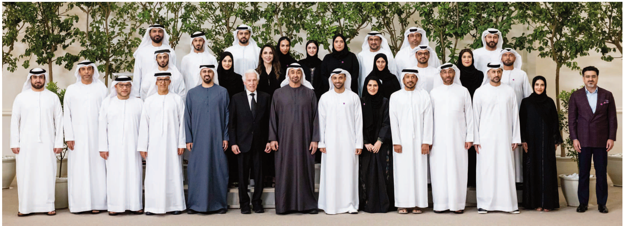
UAE President His Highness Sheikh Mohamed bin Zayed Al Nahyan while receiving a delegation from Emirates Foundation in Abu Dhabi on Tuesday