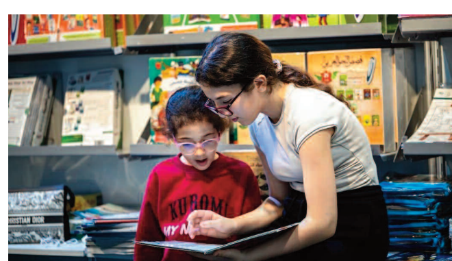
The 12-day event will feature literary and intellectual discussions, activities for children and young adults, and specialised professional programmes for the publishing industry

HH Sheikha Bodour bint Sultan Al Qasimi, Chairperson of SBA, said SIBF reflects Sharjah's decades-long relationship with books, which has made reading an integral part of the lives of families, children and young people. She said that over 45 years, the fair has helped embed books in society while creating broader opportunities for Arab culture to engage with the world.