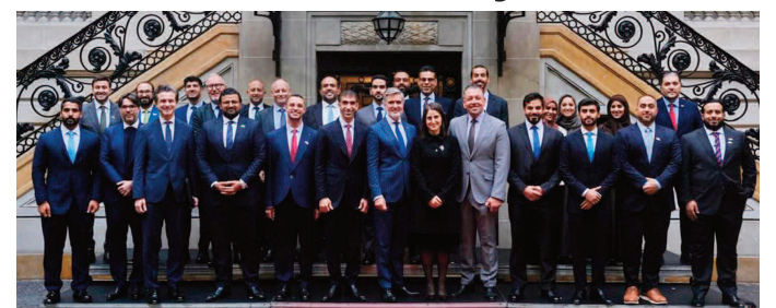
The outcomes of the tour are expected to catalyse new partnerships, expand economic cooperation with South American countries, and open further horizons for the UAE private sector to tap into promising investment opportunities —WAM