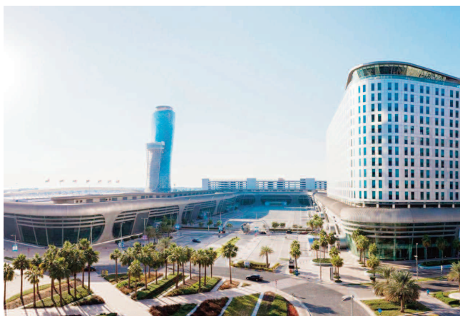
In 2025, ADNEC Group generated AED9.2 billion in economic impact, an 8% increase from AED8.5 billion in 2024

Humaid Al Dhaheer, Group CEO of ADNEC Group, said, "2025 witnessed record growth rates across all performance in-