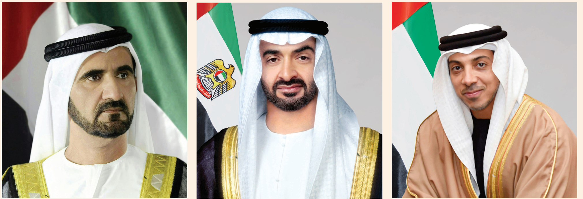
ABU DHABI