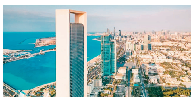
Another report by Knight Frank, independent global real estate consultants, confirmed that Dubai has further strengthened its position as one of the world's leading destinations for wealth migration and real estate investment

Officials and experts told the Emirates News Agency (WAM)