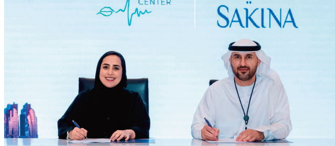
The collaboration supports Abu Dhabi's ambition to strengthen preventive, integrated care models by combining research, clinical application and professional training —WAM

Under the MoU, the two organisations will collaborate to design specialised research protocols focused on digital behaviours and related wellbeing considerations, while developing applied clinical frameworks for SAKINA's Digital Wellbeing Centre in Abu Dhabi.