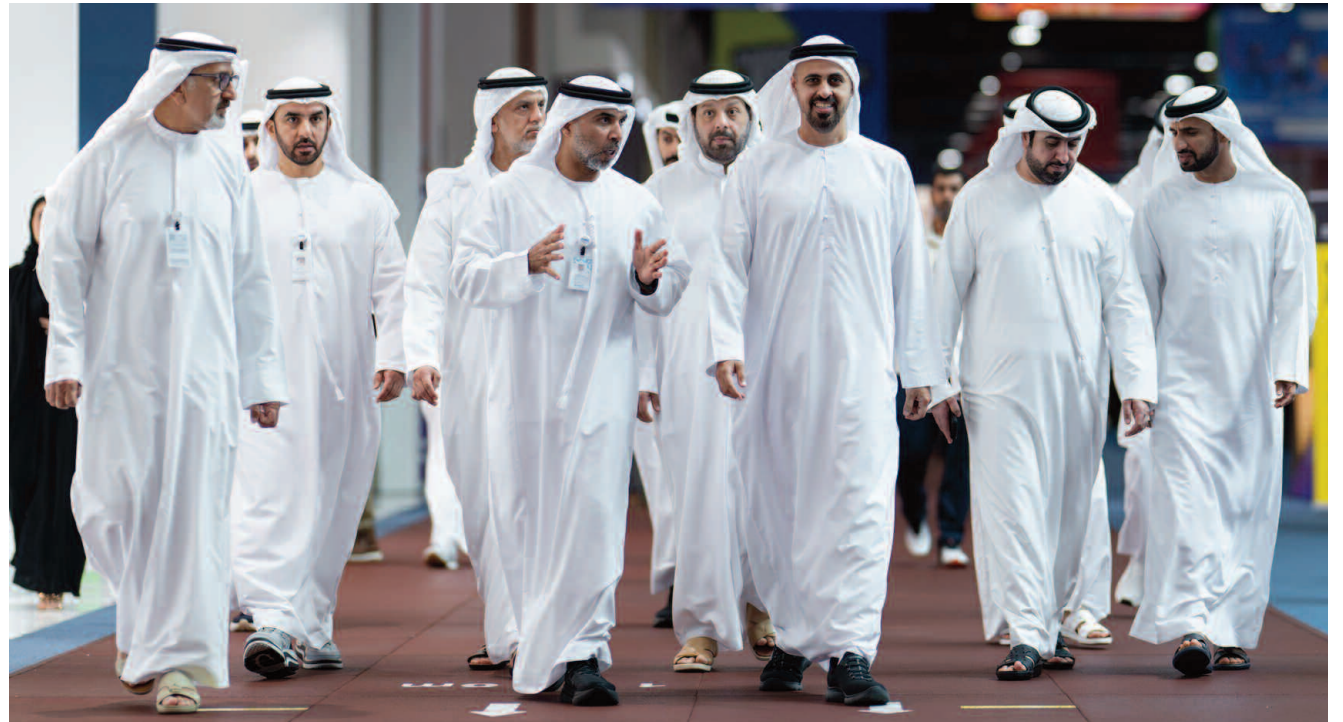
HH Sheikh Theyab bin Mohamed bin Zayed Al Nahyan, Deputy Chairman of the Presidential Court for Development and Fallen Heroes' Affairs, while visiting the fifth edition of Abu Dhabi Summer Sports, organised by ADNEC Group, a Modon company, in partnership with Abu Dhabi Sports Council and sponsored by ADNOC Group on Tuesday

HH Sheikh Theyab noted that the continued development of sports infrastructure and the organisation of community events reflect Abu Dhabi's vision of building a healthier and active society by providing inclusive sporting opportunities