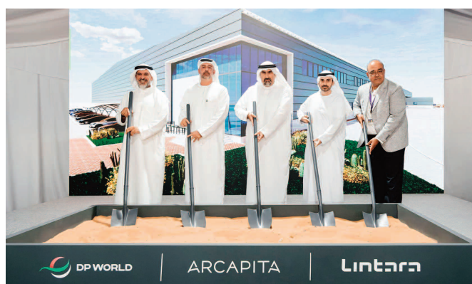
The development forms part of Arcapita's broader strategy to invest in high-quality, tenant-led industrial real estate across key regional logistics hubs

The new facility will feature approximately 12-metre clear height storage, temperature-controlled areas, dedicated