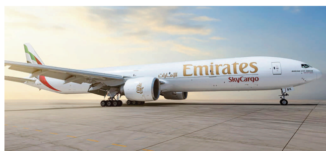
The converted Boeing 777-300ERSF is the sixth new freighter, following five Boeing 777-F production freighters, to join Emirates SkyCargo's fleet since March 2026

The converted Emirates Boeing 777-300ERSF offers 100 tonnes of payload capacity and 811 m 3 of cargo volume, representing a 25% increase in cargo volume over the Boeing 777-F production freighter. At 47 pallet positions, the converted aircraft also accommodates 10 additional pallet