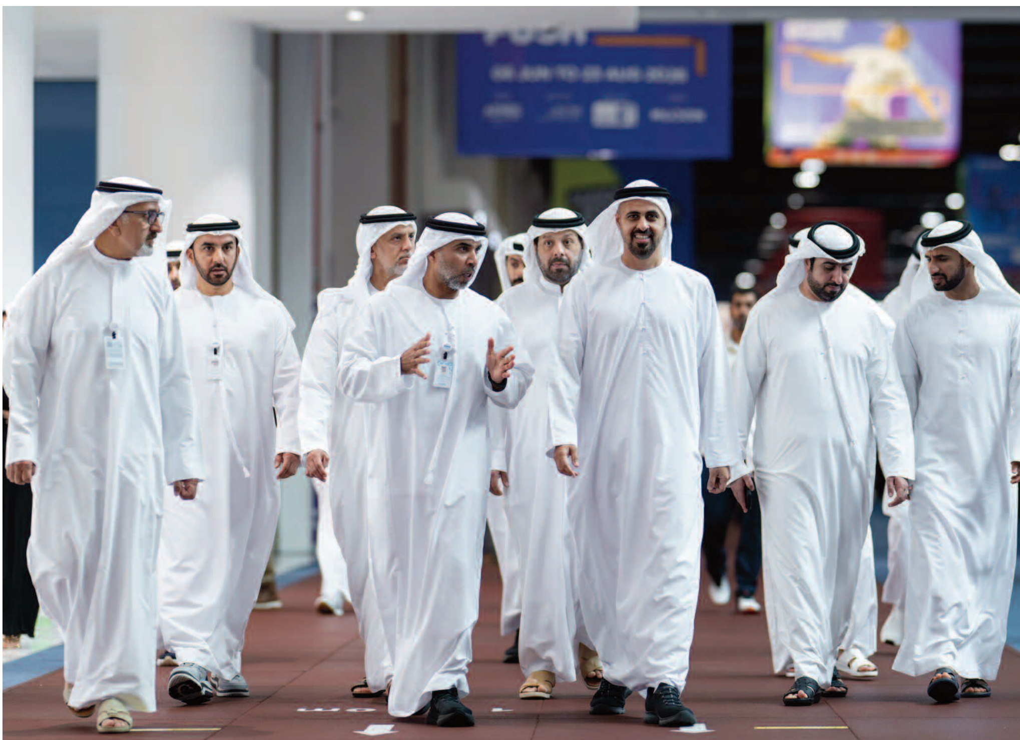
HH Sheikh Theyab bin Mohamed bin Zayed Al Nahyan, Deputy Chairman of the Presidential Court for Development and Fallen Heroes' Affairs, while visiting the fifth edition of Abu Dhabi Summer Sports, organised by ADNEC Group, a Modon company, in partnership with Abu Dhabi Sports Council and sponsored by ADNOC Group on Tuesday