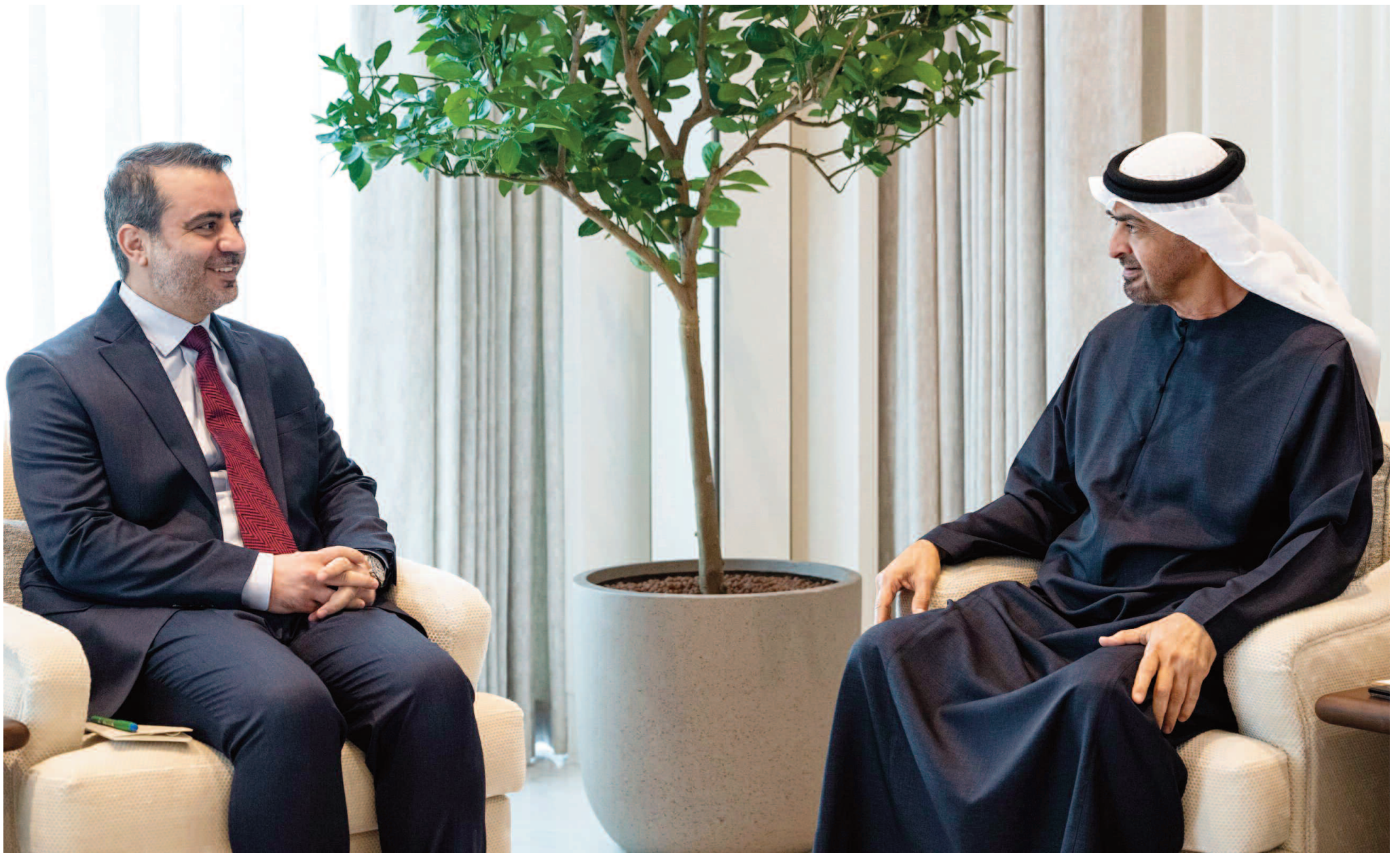
UAE President His Highness Sheikh Mohamed bin Zayed Al Nahyan His Excellency Asaad Al-Shaibani, Minister of Foreign Affairs and Expatriates of the Syrian Arab Republic, in Abu Dhabi on Thursday