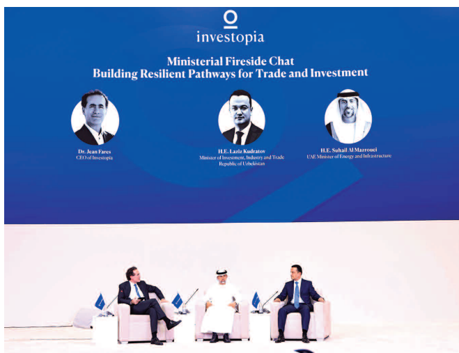
The two governments have declared 2025-2027 a "New Era of Economic Partnership," with a shared ambition to expand trade and increase joint investment portfolio to $50b

Investopia also organised three executive roundtables