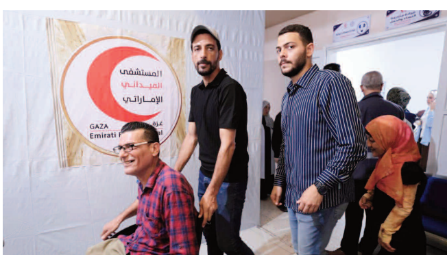
The Emirates Medical Centre in the northern Gaza Strip is the second medical centre established under Operation Chivalrous Knight 3, following the opening of the Emirates Medical Centre in Khan Younis

capacity of the healthcare system to meet patients' needs and provide primary and therapeutic healthcare services amid the challenges facing the health sector in Gaza. The opening of the centre builds on the humanitarian initiatives implemented under Operation Chivalrous Knight 3, which focus on supporting healthcare facilities, providing medicines and medical supplies, and contributing to enhancing the efficiency of treatment services, thereby promoting the sustainability of