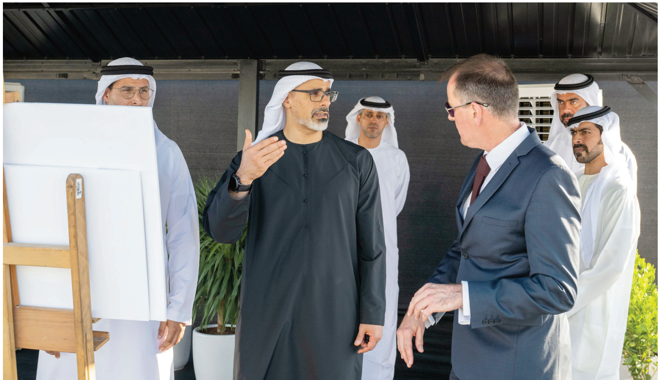
HH Sheikh Khaled bin Mohamed bin Zayed Al Nahyan, Crown Prince of Abu Dhabi and Chairman of the Abu Dhabi Executive Council, while witnessing the launch of the Dar al Funoon Abu Dhabi (House of the Arts) development project near Saadiyat Cultural District, Abu Dhabi, on Thursday

Saadiyat Cultural District, Abu Dhabi. Set to open in 2030, the project will become one of the region's largest and most technically advanced performing arts venues offering year-round artistic programming. ■ For full story, read www.gulftime.ae