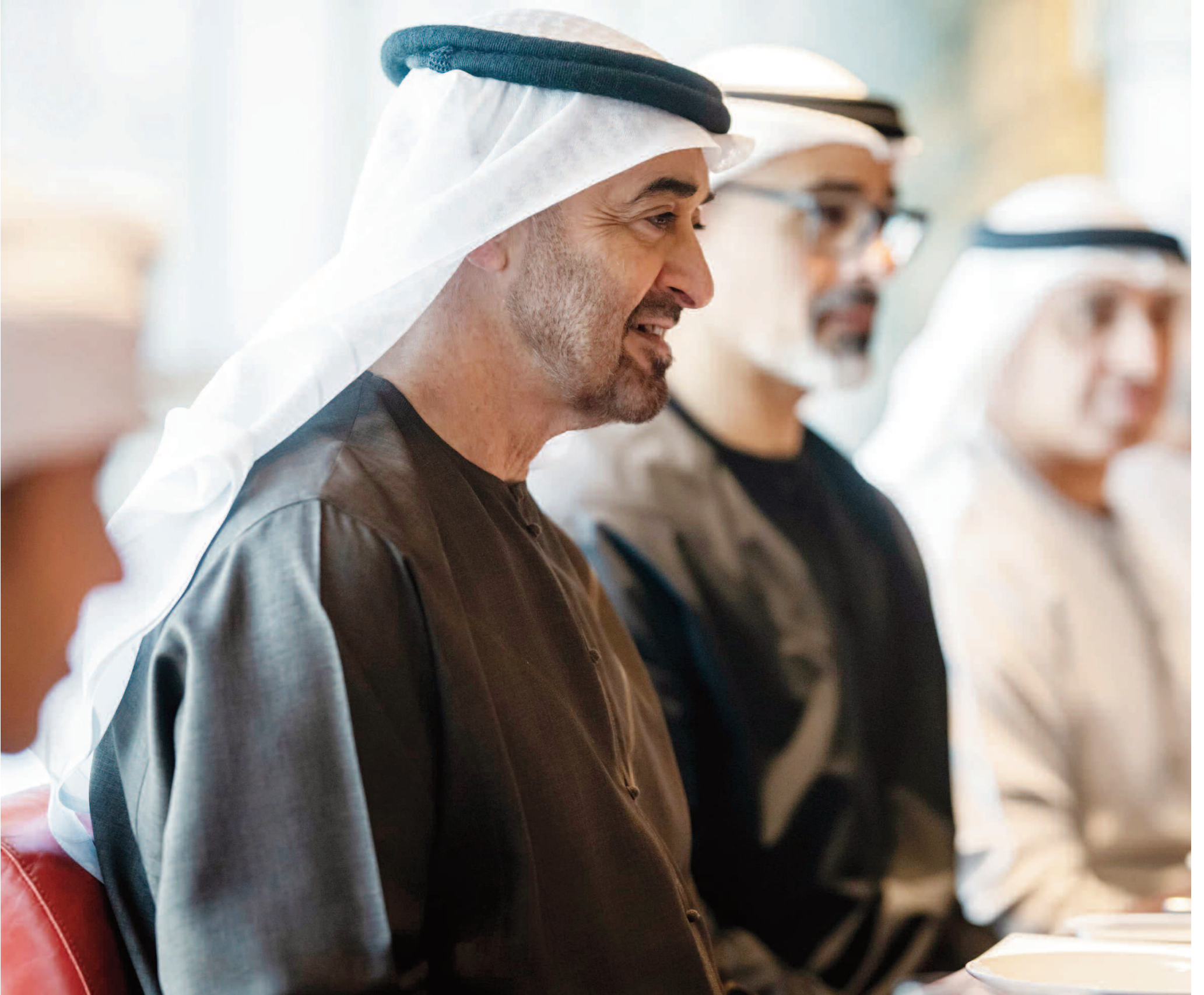
UAE President His Highness Sheikh Mohamed bin Zayed Al Nahyan with Marco Rubio, US Secretary of State, in Abu Dhabi on Wednesday