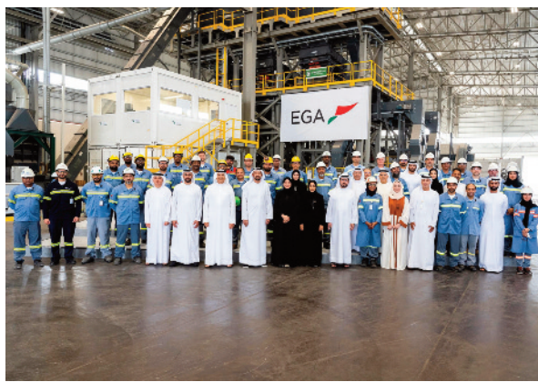
EGA blends recycled metal with primary aluminium produced using solar power, marketed as CelestiAL-R, and with nuclear power, sold as MinimAL-R —WAM

"Emirates Global Aluminium has been a pioneer of our nation's industry for decades, and today, they are leading the charge as our national champion in aluminium recycling. I congratulate EGA on the strategic growth of its recycling business both here in the UAE