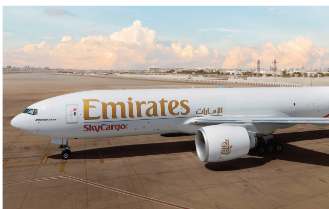
Emirates SkyCargo is increasing frequencies and destinations in response to growing demand for connectivity between manufacturing hubs in the region and key markets across the Middle East, Africa, Europe and the Americas —WAM

"Emirates SkyCargo offers unmatched choice and flexibility, not only through our