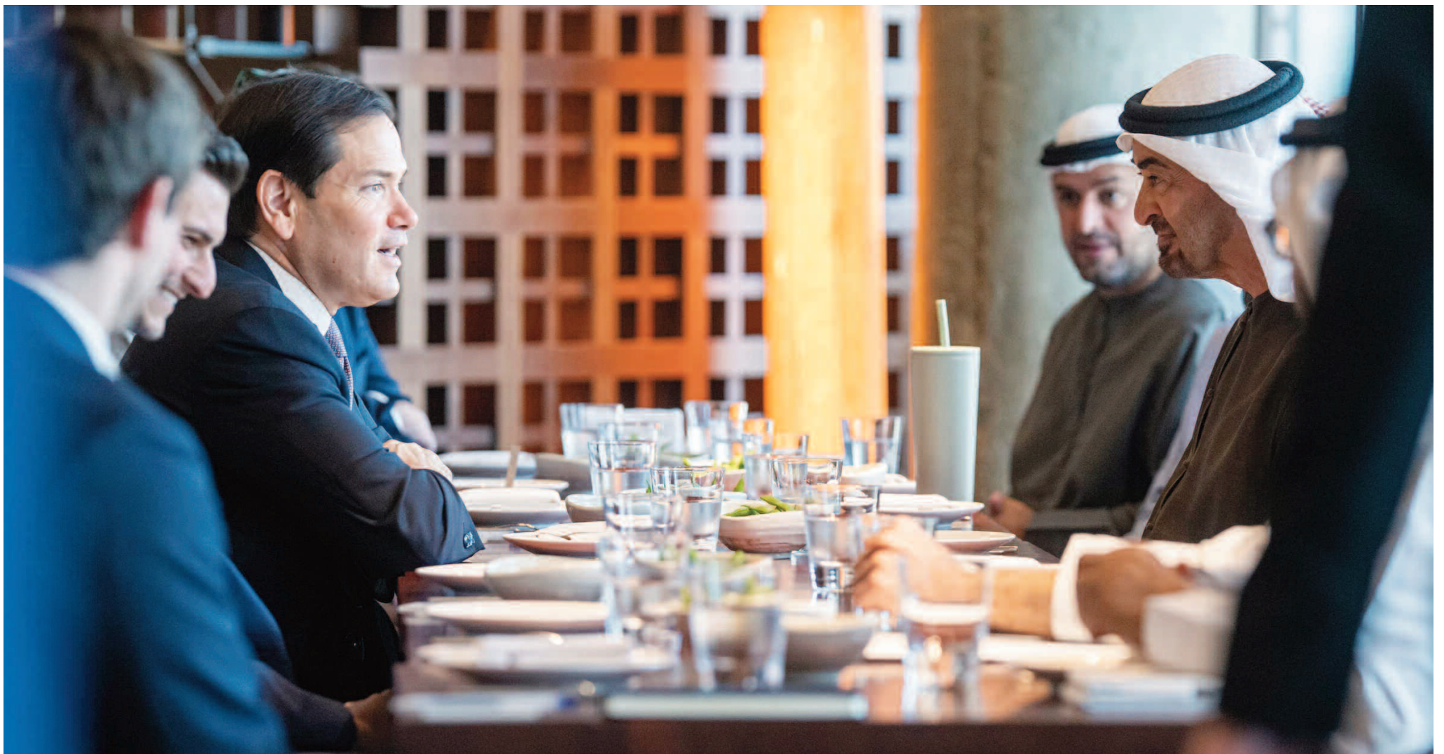
UAE President His Highness Sheikh Mohamed bin Zayed Al Nahyan with Marco Rubio, US Secretary of State, in Abu Dhabi on Wednesday