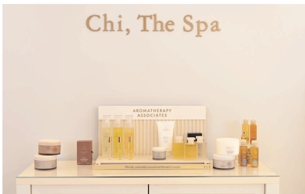
Recognised for the power of its synergistic essential oil blends, Aromatherapy Associates develops highly concentrated formulations designed to act deeply on both physical and emotional imbalances

Among the new experiences introduced, the "Sleep & Restoration Ritual" stands out as a deeply restorative escape, entirely dedicated to sleep and regeneration. The treatment begins with guided breathing to calm the nervous system, followed by slow, rhythmic movements