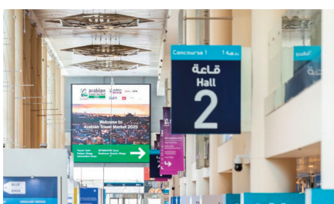
Taking place from 14th to 17th September 2026 at Dubai World Trade Centre (DWTC), ATM 2026 will bring together the international travel community at a pivotal time for the sector —WAM

"Supported by Dubai's world-class infrastructure, operational resilience, and strong public-private sector coordination, ATM 2026 remains firmly positioned to bring the tourism industry together and support long-term recovery and future