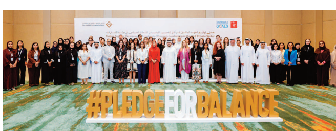
The dialogue served as a platform for exchanging perspectives on key trends shaping the future, including artificial intelligence, the new economy and the future of work

The national dialogue forms part of the UAE's collaborative approach to policy development, ensuring stakeholders are actively engaged in shaping future directions that support sustainable development and strengthen the country's competitiveness and global leadership. The dialogue served as a platform for exchanging perspectives on key trends shaping the