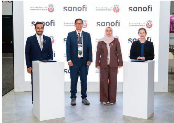
The centre's capabilities will include AI-enabled vaccine discovery and design, immunology, clinical development, mRNA research and clinical manufacturing

Operating within Abu Dhabi's Health, Endurance, Longevity, and Medicine (HELM) Cluster, the collaboration intends to bring together scientific research, clinical infrastructure, academic expertise, enabling regulation and advanced manufacturing within a single ecosystem.