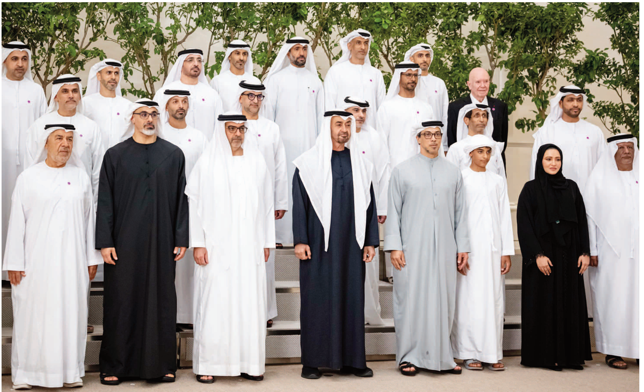
UAE President His Highness Sheikh Mohamed bin Zayed Al Nahyan, while receiving a delegation from the Abu Dhabi Investment Authority (ADIA) on Tuesday as the authority marks the 50th anniversary of its establishment