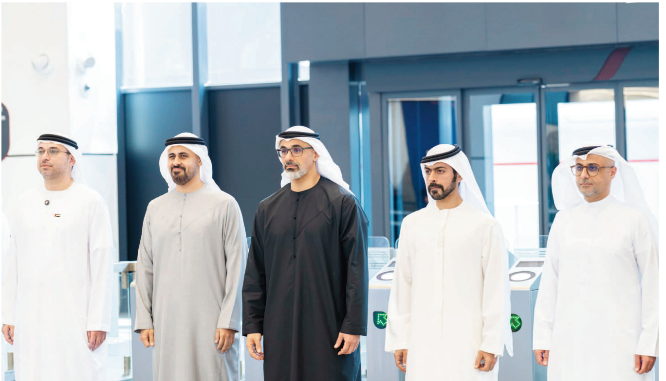
HH Sheikh Khaled bin Mohamed bin Zayed Al Nahyan, Crown Prince of Abu Dhabi and Chairman of the Abu Dhabi Executive Council, while inaugurating Mohamed bin Zayed City Passenger Train Station in Abu Dhabi and witnessed the unveiling of the UAE passenger rail network, which is set to launch on 30th September 2026 on Tuesday