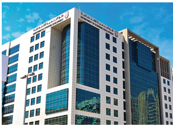
Industrial licences transitioning into the production phase during Q1 2026 increased by 3%, with 34 new industrial facilities entering full operational phase during the first three months of 2026 — WAM

The number of active licences in the emirate increased by 12% during Q1-2026 compared to the