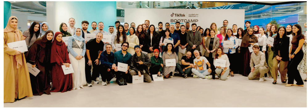
For beginners, the programme offered a simplified guide to building confidence on TikTok, covering everything from profile creation and content strategy to trending topics, storytelling, and viral video creation —WAM

DUBAI / WAM Creators HQ and TikTok announced the conclusion of the second edition of the #CreatorsHQxTikTok regional bootcamp at Creators HQ, the first content creator hub in the UAE and the Middle East, and part of Visioneers, UAE's largest content management and development platform.