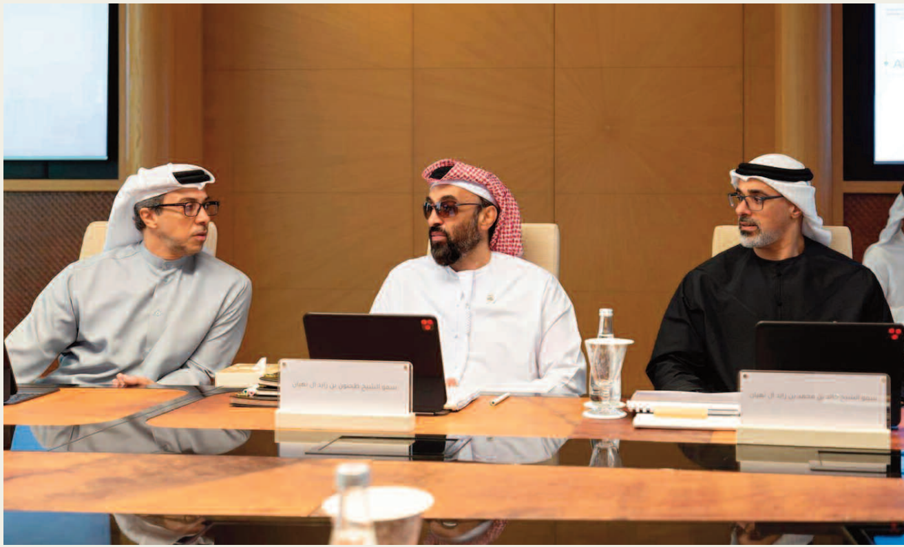
In the presence of His Highness Sheikh Mansour bin Zayed Al Nahyan, Vice President, Deputy Prime Minister and Chairman of the Presidential Court, and His Highness Sheikh Khaled bin Mohamed bin Zayed Al Nahyan, Crown Prince of Abu Dhabi and Chairman of the Abu Dhabi Executive Council, His Highness Sheikh Tahnoon bin Zayed Al Nahyan, Deputy Ruler of Abu Dhabi, while chairing the meeting of the Investment Affairs Council on Monday