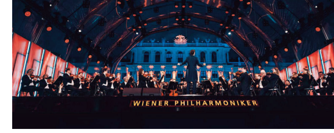
Through its Abu Dhabi Festival Abroad programme, ADMAF reinforces the UAE's position at the heart of global cultural dialogue, highlighting the transformative power of the arts in connecting people worldwide

Night Concert. As an Artistic and Cultural Partner of the annual open-air concert, Abu Dhabi Festival joined this year's edition, conducted by Lorenzo Viotti and featuring acclaimed baritone Sir Bryn Terfel. Held at the Schönbrunn Palace Gardens in Vienna, the concert attracted an audience of 60,000 plus a worldwide broadcast audience in the millions. The Sum-