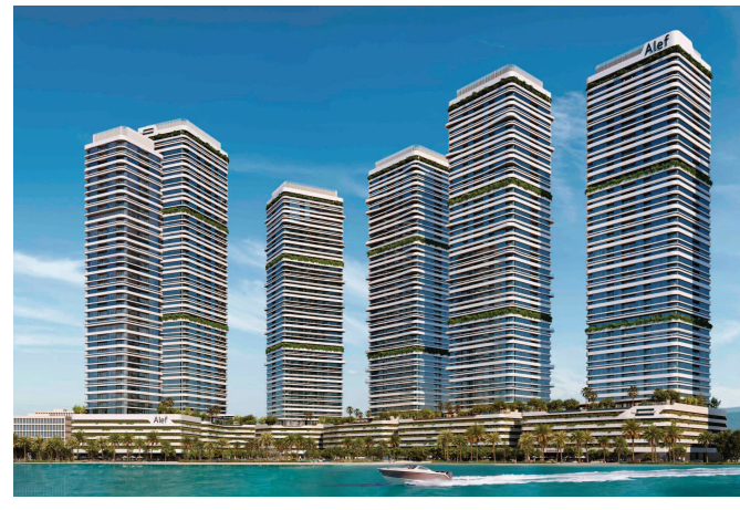
The launch of Linar in Al Mamzar reflects strategic shifts in Sharjah's real estate sector

Khalid Bin Sultan City represents a transformative approach