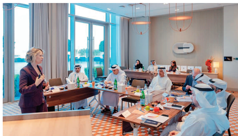
Dubai Customs continues to cement its leadership in building specialized national competencies through its "Masar 33" initiative, one of its most significant strategic projects —WAM