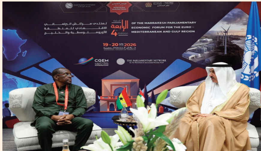
The two sides stressed the importance of continuing joint efforts to elevate relations to broader horizons in a manner that serves the interests of the two friendly countries and peoples

The two sides praised the success of the forum's fourth edition and the fruitful discussions it witnessed on economic and development issues of mutual interest. They underscored the important role of parliaments in supporting dialogue and economic cooperation, and in promoting sustainable development and prosperity for peoples.