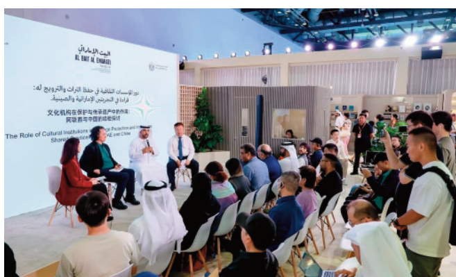
Speakers pointed to the UAE and China's shared commitment to heritage and culture as a solid foundation for deeper cooperation between cultural institutions in both countries

Discussion highlighted the respective experiences of UAE and China in safeguarding and protecting cultural heritage, and the role cultural institutions play in keeping that heritage alive within their societies. Panelists also reviewed initiatives and programs designed to pass heritage knowledge on to younger generations and to anchor it