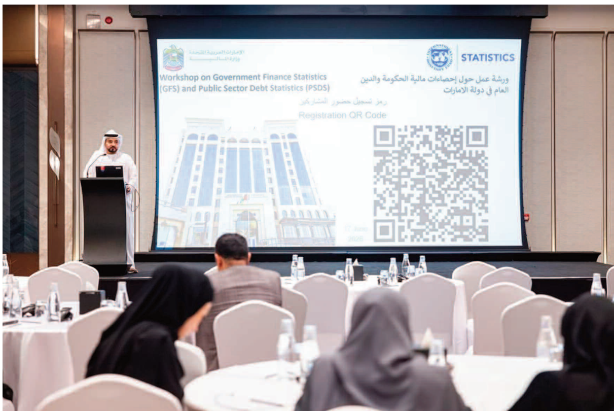
The Ministry of Finance, in collaboration with a technical mission from the International Monetary Fund (IMF), hosted a specialised workshop in Dubai on Government Finance Statistics (GFS) and Public Sector Debt Statistics (PSDS) on Sunday —WAM