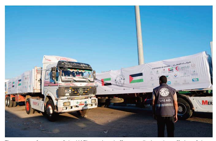
The convoys form part of the UAE's continued efforts to alleviate the suffering of those affected in the Gaza Strip by providing essential needs and supporting Palestinian families amid the current humanitarian conditions