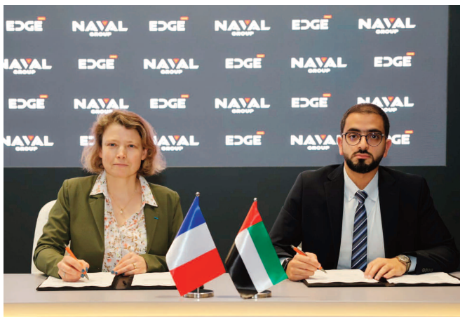
The programme will combine Naval Group's expertise in naval combat systems integration and weapon launch technologies with HALCON's advanced missile development and manufacturing capabilities

The trials campaign will be conducted in the UAE between 2026 and 2027, beginning with a