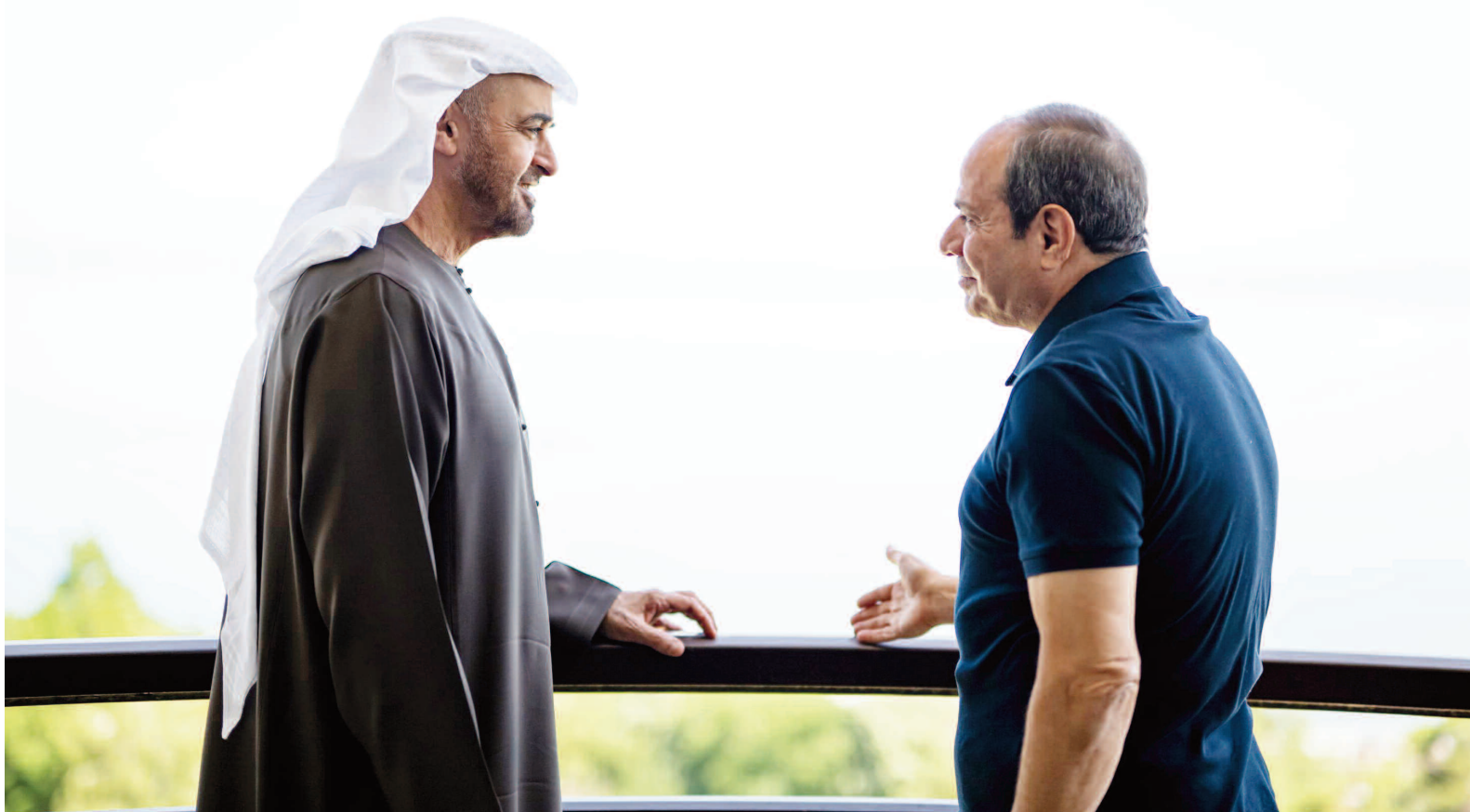
UAE President His Highness Sheikh Mohamed bin Zayed Al Nahyan with His Excellency Abdel Fattah El-Sisi, President of the Arab Republic of Egypt, on the sidelines of the G7 Summit in Évian-les-Bains, France, on Wednesday

The two leaders discussed bilateral relations and ways to strengthen cooperation across various sectors in support of both nations' development ambitions