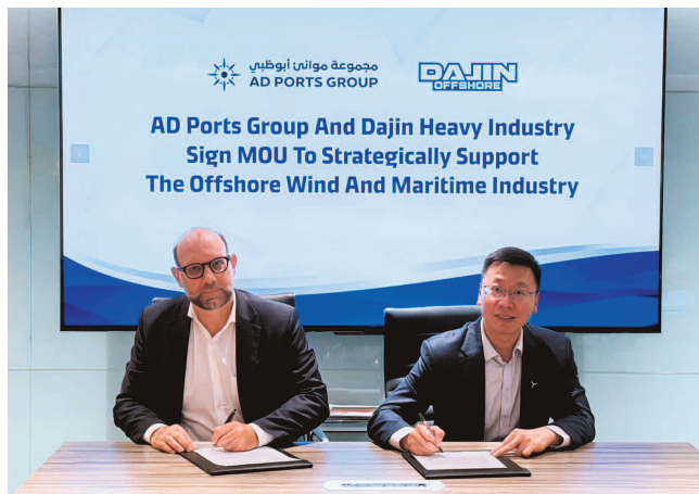
The offshore wind energy market continues to experience strong global growth, driven by accelerating decarbonisation targets, large-scale renewable energy investments, and the expansion of offshore wind capacity across Europe, Asia, and emerging markets.—WAM

MoU, both parties will explore opportunities, including transportation solutions for offshore wind components, development of pre-assembly hubs, cooperation on selected offshore wind tenders and industrial projects, plus fabrication, assembly, and logistics solutions for offshore energy infrastructure.