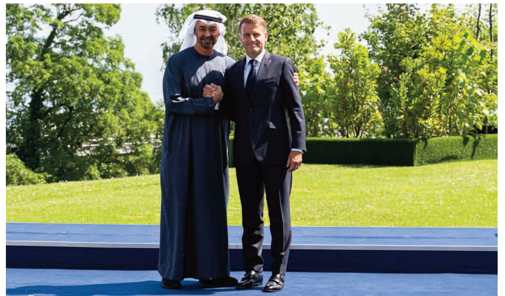
UAE President His Highness Sheikh Mohamed bin Zayed Al Nahyan with French President Emmanuel Macron in Évian-les-Bains, France, on Tuesday