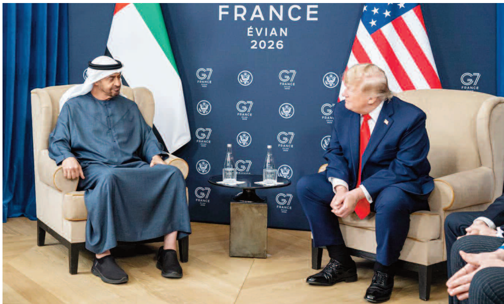
UAE President His Highness Sheikh Mohamed bin Zayed Al Nahyan with US President Donald Trump on the sidelines of the G7 Summit taking place in Évian-les-Bains, France, on Tuesday