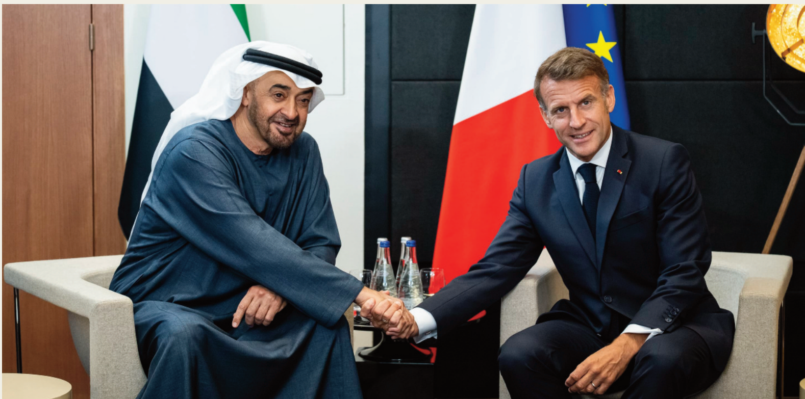
UAE President His Highness Sheikh Mohamed bin Zayed Al Nahyan with His Excellency Emmanuel Macron, President of the French Republic, on the sidelines of the G7 Summit in Évian-les-Bains, France, on Tuesday