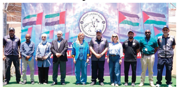
The delegation was briefed on the scale of the medical, surgical and treatment services provided by the hospital to wounded and sick Palestinians