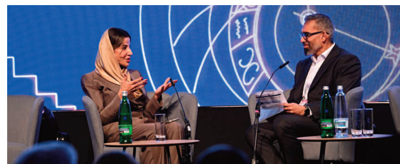
Ethiad Credit Insurance (ECI) operates in a vastly different global trade environment from the one that existed when it was established in 2018 —WAM