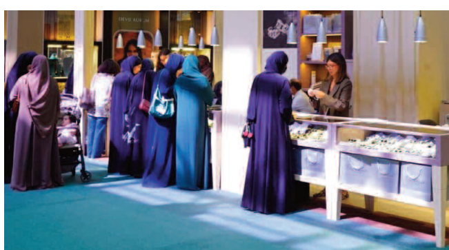
The 57th edition of Watch and Jewellery Middle East Show, which will run until 14 June, brings together 400 exhibitors, including representatives from 11 global markets —WAM

The international pavilions showcase cutting-edge innovations and exclusive product launches, with exhibitors competing to introduce rare collections and one-of-a-kind pieces making their regional debut.