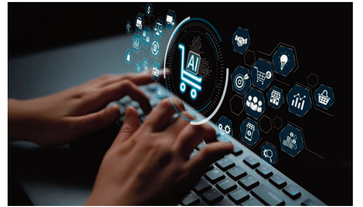
Overall, 79% of UAE consumers feel comfortable letting an AI complete a purchase for them, and only 2% said they would not be motivated to use an AI shopping agent at all —WAM