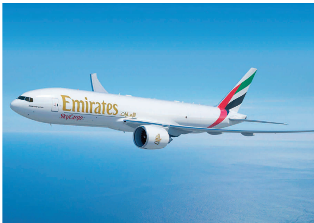
Almaty is Emirates SkyCargo's first destination in Central Asia and the new weekly cargo flights from Dubai will help open a new trade corridor integrating the region into the carrier's global network

Almaty is Kazakhstan's largest city and a growing commercial and logistics hub serving as an important economic and trade gateway Central Asia. Emirates SkyCargo's weekly freighter service on Tuesdays will provide over 100 tonnes of cargo capacity every week for the seamless movement of key commodities including electronics, perishables, machinery and other consumer goods between Almaty and the rest of the world