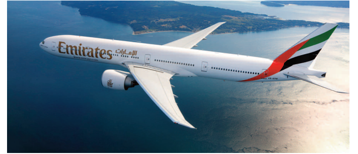
As part of its commitment to environmental stewardship, Emirates has invested more than AED 50 million in transitioning to a closed-loop manufacturing model for inflight dining serviceware