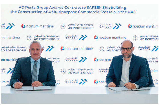
SAFEEN Drydocks has rapidly expanded its ability to deliver complex newbuild and repair programmes

SAFEEN Drydocks, a shipbuilding, repair and maintenance company, has secured two major vessel construction contracts valued at AED1.3 Billion (US$354 million) in total, marking the largest awards secured by SAFEEN Drydocks to date and reinforcing the UAE's growing position as a shipbuilding hub. SAFEEN Drydocks is a joint venture between AD Ports Group (ADX: ADPORTS) and Premier Marine Engineering Services, operating within Noatum Maritime's portfolio, as part of its broader offering of integrated maritime services. The first project includes the design and fabrication of four 140-metre multipurpose vessels for AD Ports Group, representing one of the largest maritime vessel projects to be undertaken in the UAE. Supporting a range of cargo and logistics operations, each will have capacity for 105 passengers, up to 300 containers, including more than 100 reefer plugs, as well as high and heavy cargo, and up to 1000 cars and 100 trailers. The second award relates to the construction of 18 specialised marine support units for Nigeria's Oilbank Logistics Services Ltd, including tugboats and pilot boats of various sizes. These will support port opera-