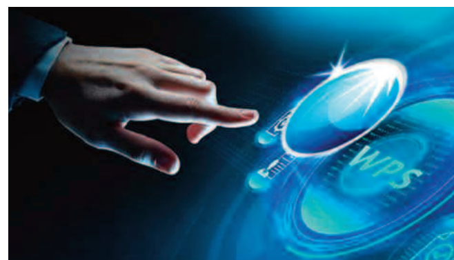
The initiative reinforces ADIB's commitment to delivering Shari'ah-compliant, regulator-ready digital solutions across its personal, small- and medium-enterprises (SMEs), and corporate banking ecosystems

The solution also introduces inside-country employee verification and strengthens transparency, auditability, and regulatory reporting.