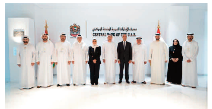
The meeting was attended by the Assistant Governors of the Central Bank of the UAE and a number of senior officials from both sides