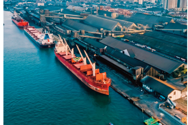
AD Ports Group agreed to acquire CLI from joint owners Macquarie Asset Management, and IG4 Capital. CLI owns 100% of CLI Norte, which operates a terminal at the Port of Itaquí, and 80% of CLI Sul, which operates a terminal at the Port of Santos

AD Ports Group on Tuesday acquired Corredor Logística e Infraestrutura (CLI), Brazil's leading independent agri-bulk port terminal operator, entering the South American market with a strategically major expansion transaction. São Paulo-based CLI operates two of Brazil's most important agri-bulk export terminals under long-term concessions: CLI Sul, Brazil's leading sugar export terminal and key export terminal for corn and soybeans, located in the Port of Santos; and CLI Norte, another key grains gateway at the Port of Itaquí, which is part of the Brazilian 'Arc of the North', a geographical region encompassing the Amazon basin that is a pivotal logistics hub and significant emerging corridor for agriculture exports. In 2025, ports and terminals in northern Brazil recorded the fastest growth in the country, reinforcing the strategic role of