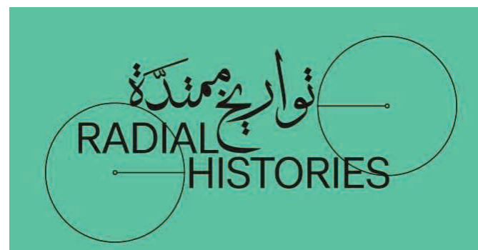
Taking Sharjah as its point of departure, the series follows movements inward and outward, mapping the flow of people and ideas across expanding geographies — WAM

emerge in Sharjah? What connected artists in the UAE to cultural movements in the Gulf, the wider Arab world and beyond? And how can we rethink modernism in the region before the rise of today's global contemporary art scene? At a time when the UAE is a major art hub and the Sharjah Biennial draws audiences from around the world, Radial Histories looks back to an earlier period of exchange and experimentation. It traces the relationships between artists and