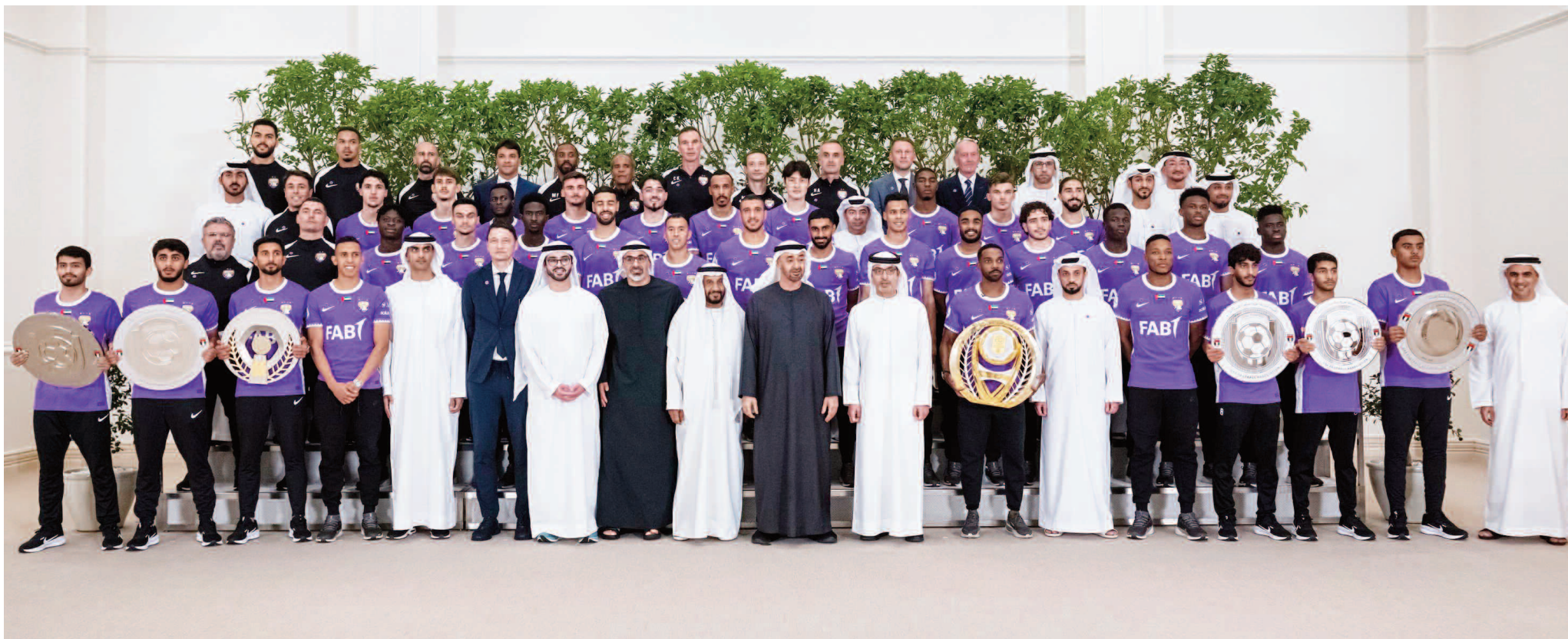
UAE President His Highness Sheikh Mohamed bin Zayed Al Nahyan while receiving a delegation of Al Ain FC players and staff, following the team's victory in the 2025–2026 ADNOC Pro League, marking the club's 15th league title, in Abu Dhabi on Wednesday