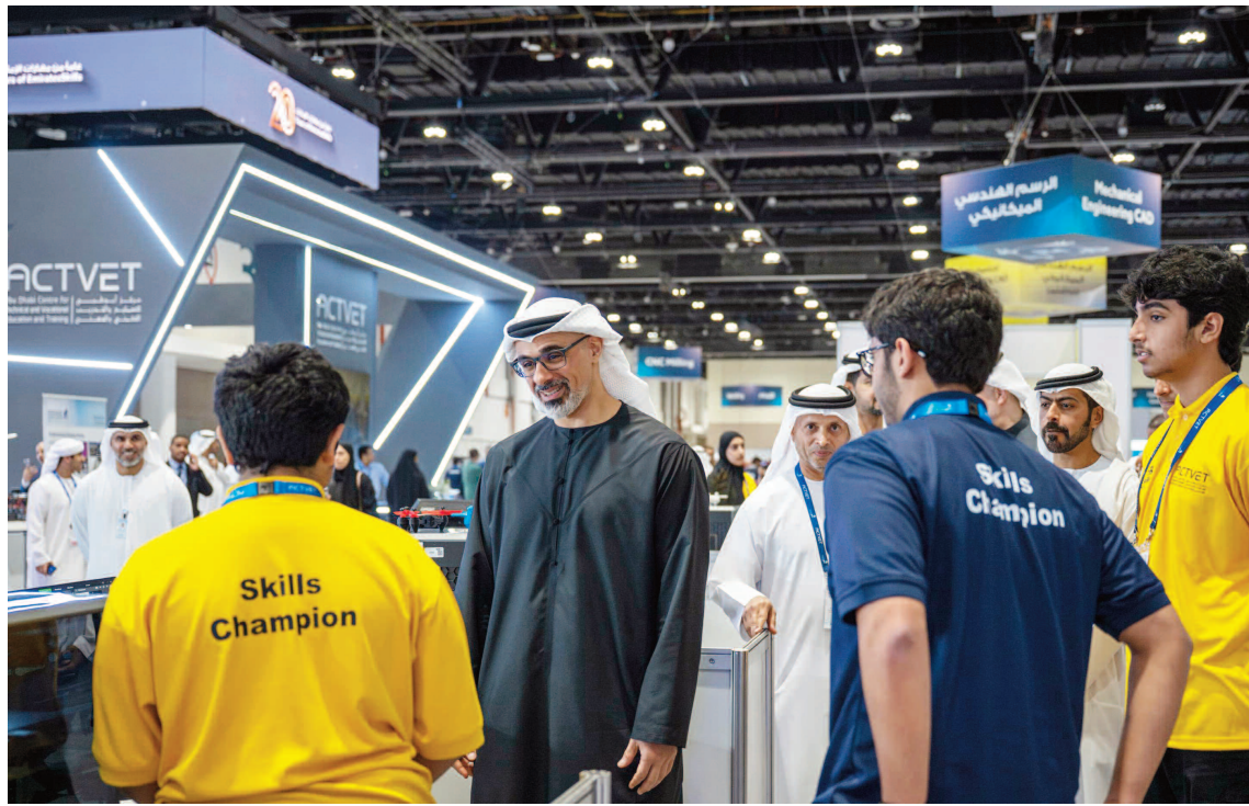
HH Sheikh Khaled bin Mohamed bin Zayed Al Nahyan, Crown Prince of Abu Dhabi and Chairman of the Abu Dhabi Executive Council, while attending the 17th EmiratesSkills National Competition, organised by Abu Dhabi Centre for Technical and Vocational Education and Training (ACTVET), and taking place at ADNEC Centre Abu Dhabi until 20 May 2026