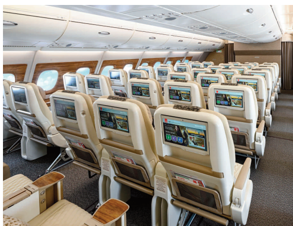
Managed entirely in-house by Emirates Engineering in Dubai, the retrofit programme has so far completed work on 95 Emirates aircraft, including 42 Airbus A380s and 53 Boeing 777s, representing more than one-third of Emirates' current fleet of aircraft

Sir Tim Clark, President of Emirates Airline, said, "The Emirates retrofit programme revolves around the central premise that we will offer our customers a truly ele-