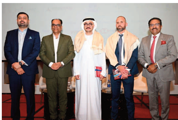
The event focused on CEPA's transformational impact since its implementation in 2022

Organised by the Indian Business and Professional Council Dubai (IBPC Dubai), the event brought together representatives from government entities, diplomatic missions, trade