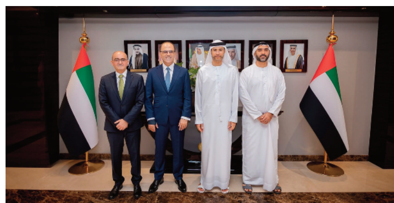
The meeting reflected the shared commitment to strengthening coordination and consultation on regional and global economic developments —WAM