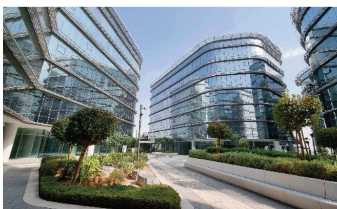
Dubai CommerCity plays a pivotal role in the initiative by facilitating collaboration among stakeholders while enhancing the readiness of businesses operating within its ecosystem to scale regionally and internationally through an integrated digital infrastructure