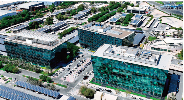
With its proximity to Jebel Ali Port and access to integrated sea, air and land connectivity, the free zone provides an efficient multimodal base for companies serving markets across the Middle East, Africa, South Asia and beyond

The new investments reflect a broad mix of trade and industrial activity, including: Manufacturers of steel, food products and furniture strengthening production; Healthcare-related businesses