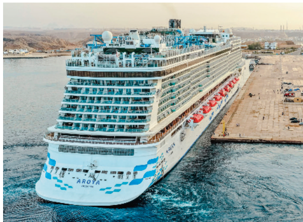
The arrival of "Aroya" in Sharm El Sheikh marks the first of several scheduled calls by the mega cruise vessel in 2026, reinforcing Sharm El Sheikh's position, alongside Hurghada and Safaga, as regular destinations on regional and international cruise itineraries