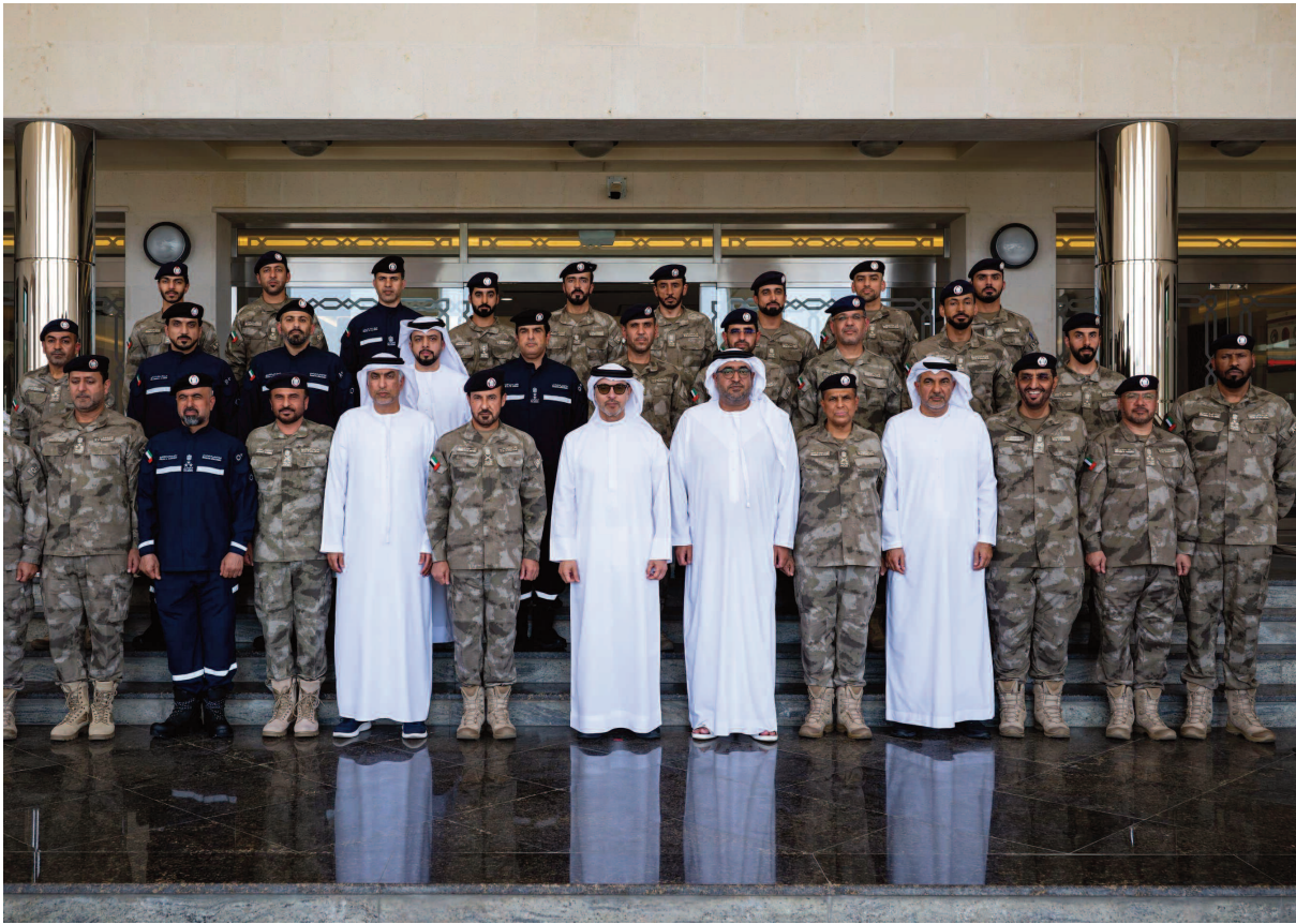
HH Sheikh Hazza bin Zayed Al Nahyan, Ruler's Representative in Al Ain Region, while visiting Al Ain Police Directorate on Tuesday