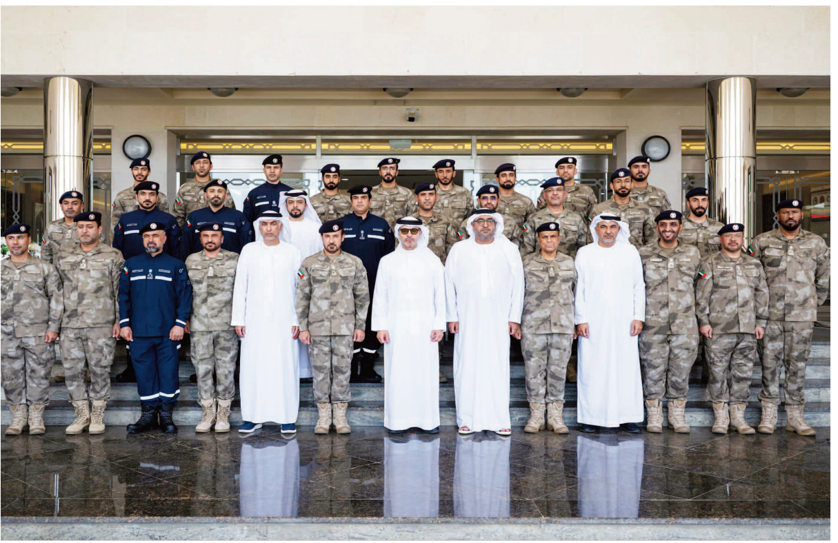
HH Sheikh Hazza bin Zayed Al Nahyan, Ruler's Representative in Al Ain Region, while visiting Al Ain Police Directorate on Tuesday