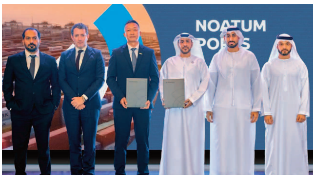
The container terminal will initially include a quay wall of approximately 420 metres in length and 16 metres in depth, capable of accommodating Patagonia-class vessels, alongside a 100,000 sqm logistics area — WAM

AD Ports Group has awarded three major contracts for the design and construction of marine and landside infrastructure, and the sourcing of crane equipment, for the Noatum Ports Pointe-Noire Terminal in the Republic of the Congo. The container terminal is being developed under AD Ports Group's majority-owned joint venture with the CMA CGM Group, through its subsidiary CMA Terminals, following an agreement signed between the two parties in February 2025. The contract awards, with a combined value of approximately AED735 million (US$200 million), mark a milestone in the development of the new container terminal, which is being delivered under AD Ports Group's 30-year concession agreement with the Government of the Republic of the Congo, extendable by a further 20 years.