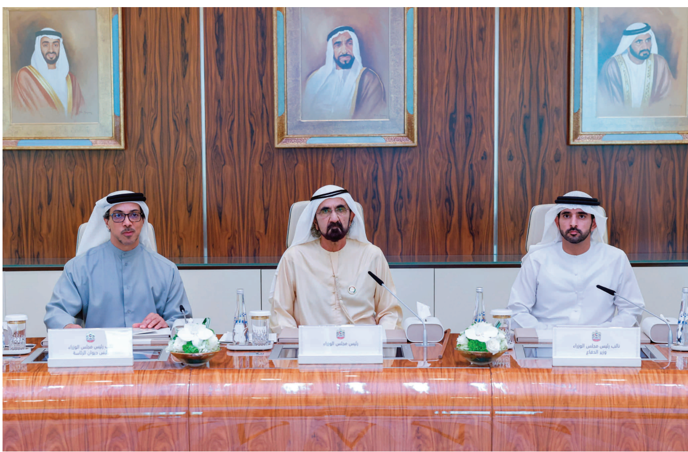
His Highness Sheikh Mohammed bin Rashid Al Maktoum, Vice President, Prime Minister of the UAE and Ruler of Dubai, while chairing the UAE Cabinet meeting in Abu Dhabi on Monday