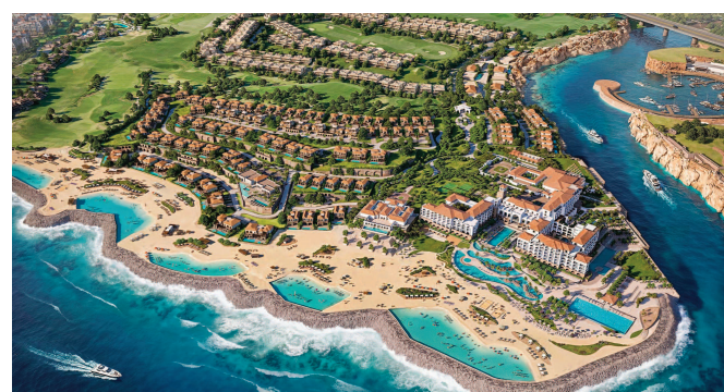
Designed as the experiential core of the wider community, the resort will feature event spaces, expansive outdoor lawns and terraces, and a dedicated Owners' Clubhouse that complements the private residential setting — WAM

tage Residences, and will offer a curated mix of wellness and leisure amenities, including beachfront swimmable lagoons, a Spa Montage with 13 treatment rooms, and six dining venues, alongside retail and family-oriented experiences. Designed as the experiential core of the wider community, the resort will also feature event spaces, expansive outdoor lawns and terraces, and a dedicated Owners' Clubhouse that complements the private residential setting. The residences represent a