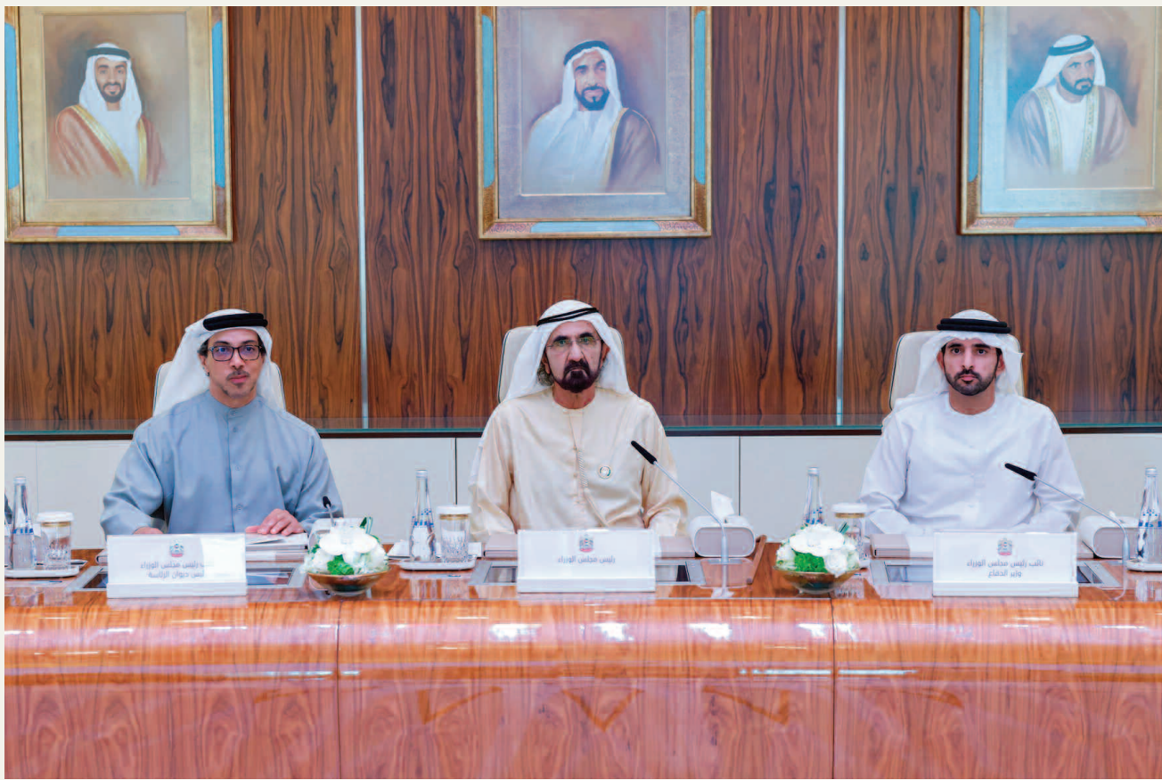
His Highness Sheikh Mohammed bin Rashid Al Maktoum, Vice President, Prime Minister of the UAE and Ruler of Dubai, while chairing the UAE Cabinet meeting in Abu Dhabi on Monday