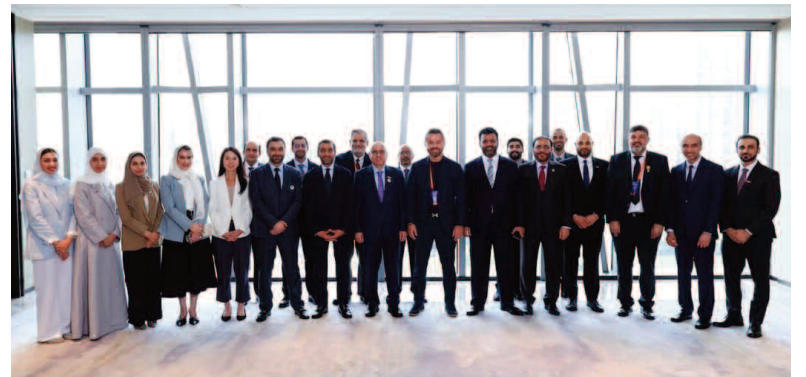
The delegation examined the ways China uses AI to advance higher education, enhance learning outcomes and provide economic sectors with a robust pipeline of skilled talent —WAM