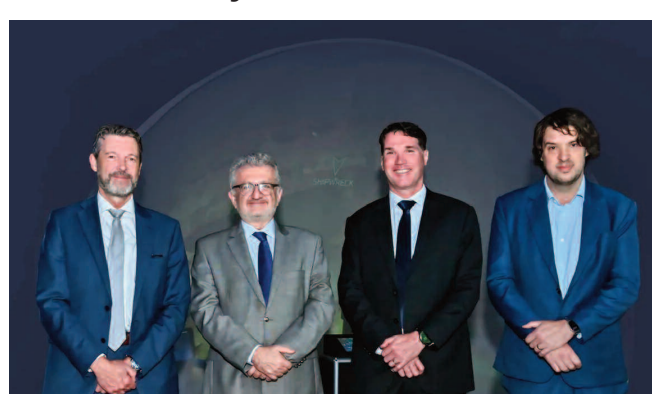
Developed through a collaboration between NYU Abu Dhabi, Dalio Philanthropies, OceanX, and Tamkeen, the portal reveals marine ecosystems, species, and scientific insights rarely accessible to the public — AD MEDIA OFFICE

ABU DHABI / AD MEDIA OFFICE The OceanX Education Portal, a first-of-its-kind immersive projection dome experience, is now on display at the Natural History Museum Abu Dhabi until December 2026. The portal invites visitors to explore beneath the surface of the Arabian Gulf and Gulf of Oman, offering an experiential window into ocean science, exploration, and discovery. Developed through a collaboration between NYU Abu Dhabi, Dalio Philanthropies, OceanX, and Tamkeen, the portal reveals marine ecosystems, species, and scientific insights rarely accessible to the public. Hosted at Natural History Museum Abu Dhabi in the Saadiyat