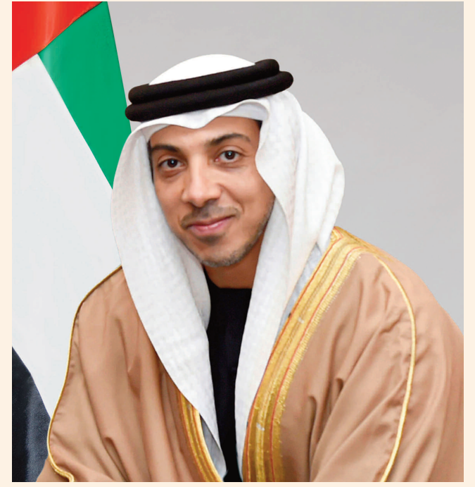
ABU DHABI / WAM