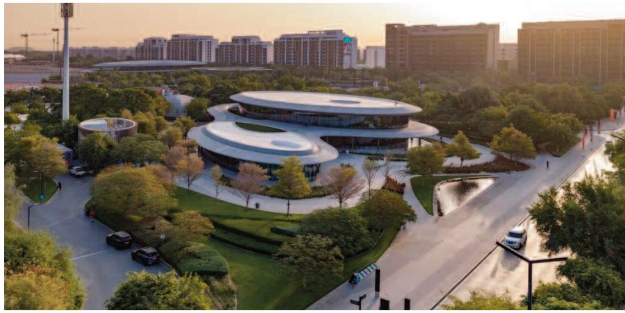
The financing has been linked to Arada's Sustainability Performance Targets (SPTs), which will be measured on an annual basis through the tenure of the facility

"I'm pleased to see that our vision has been supported by our valued partners at FAB and SACE, and that the agreement strengthens our existing partnerships with Italian companies, contributes to Italy's economic growth and additionally enhances trade between the UAE and Italy," he added.