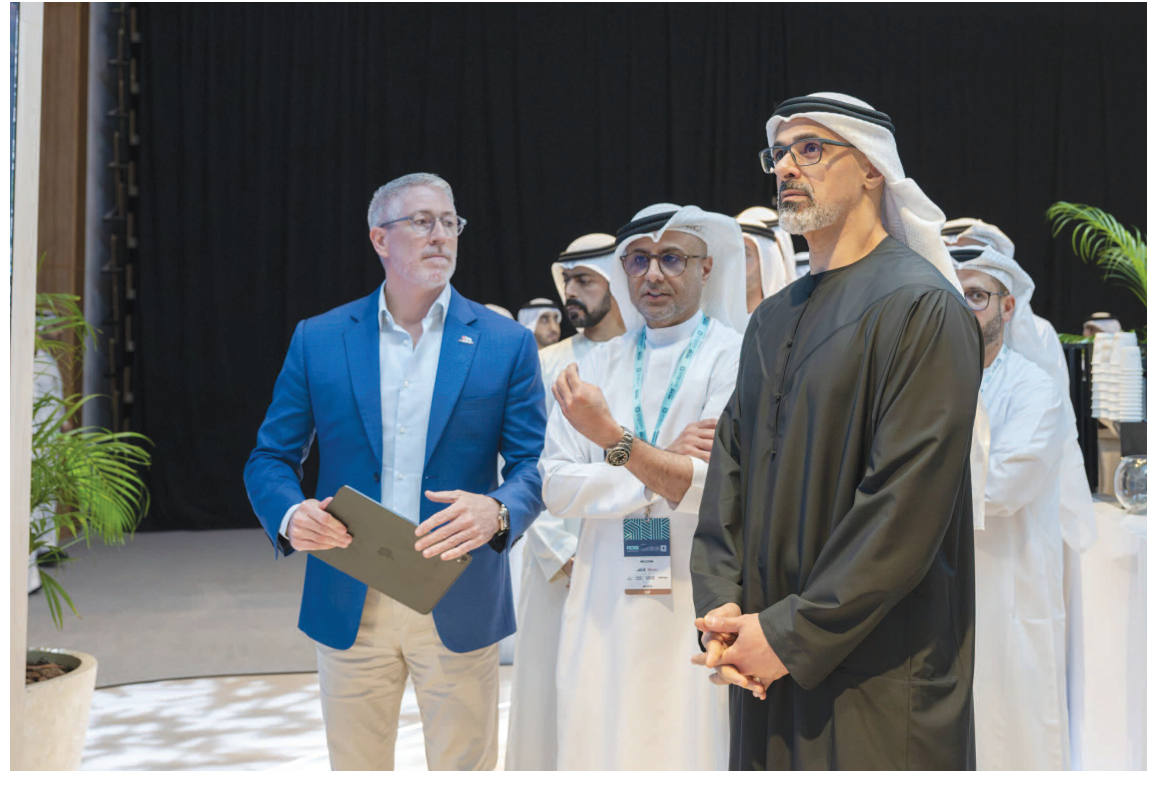
HH Sheikh Khaled bin Mohamed bin Zayed Al Nahyan, Crown Prince of Abu Dhabi and Chairman of the Abu Dhabi Executive Council, while attending the second Abu Dhabi Infrastructure Summit (ADIS) in Abu Dhabi on Thursday