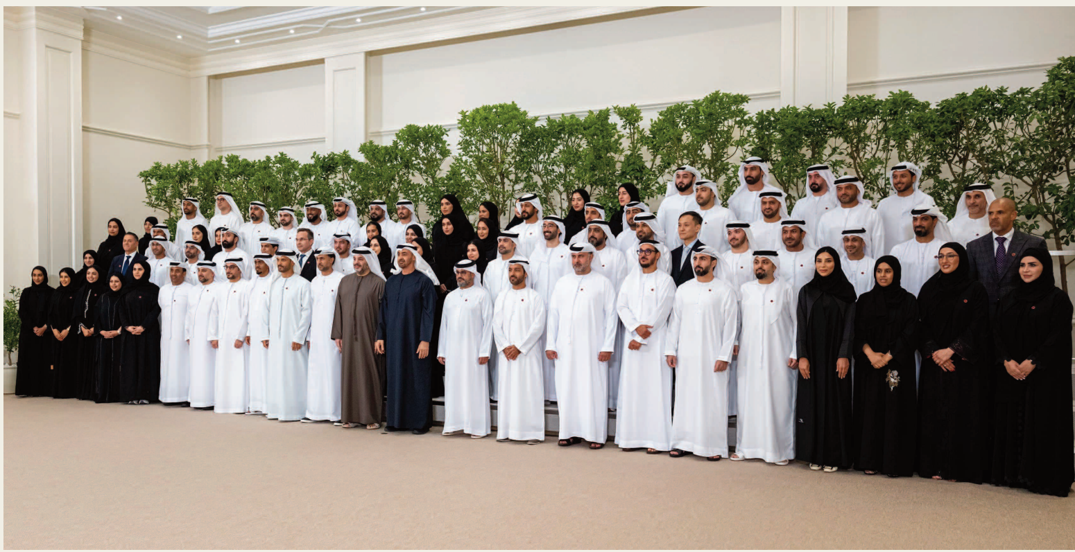
UAE President His Highness Sheikh Mohamed bin Zayed Al Nahyan with a delegation from EDGE Group, the UAE-based advanced technology and defence solutions company, in Abu Dhabi on Thursday