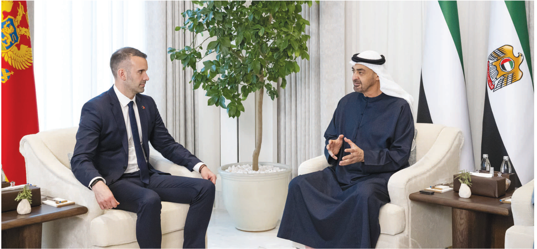
UAE President His Highness Sheikh Mohamed bin Zayed Al Nahyan with His Excellency Milojko Spajić, Prime Minister of Montenegro, in Abu Dhabi on Thursday