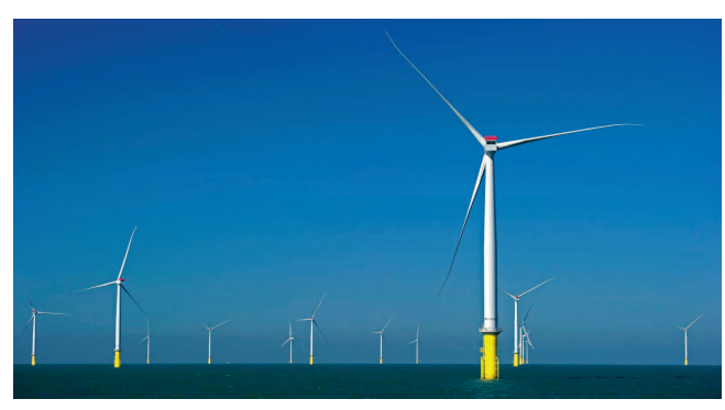
RWE and Masdar will now conduct detailed final design work and progress procurement decisions with the aim of taking a final investment decision (FID) in 2027