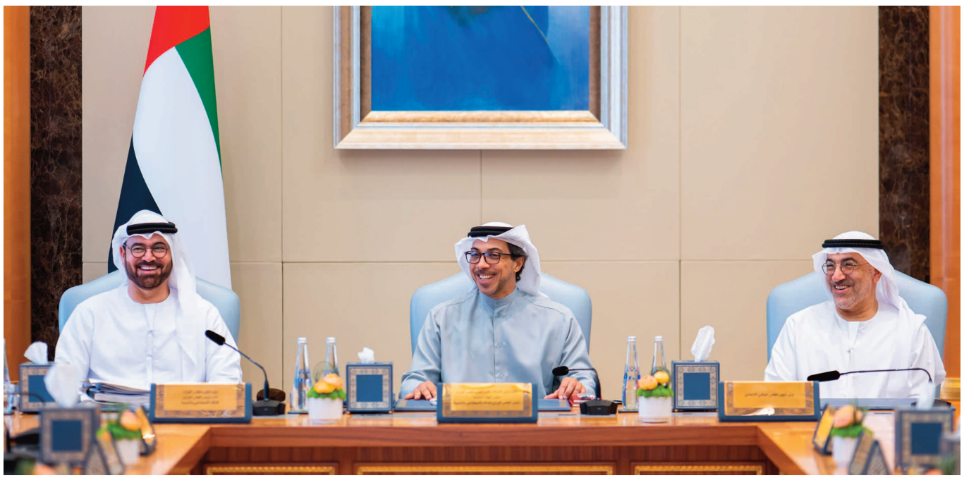
His Highness Sheikh Mansour bin Zayed Al Nahyan, Vice President, Deputy Prime Minister, and Chairman of the Presidential Court, while chairing the meeting of the Ministerial Council for Artificial Intelligence and Development, held at Qasr Al Watan, Abu Dhabi on Wednesday

Ministerial Council for Artificial Intelligence and Development reviewed the readiness of ministries and federal entities to adopt Agentic AI models in their operations