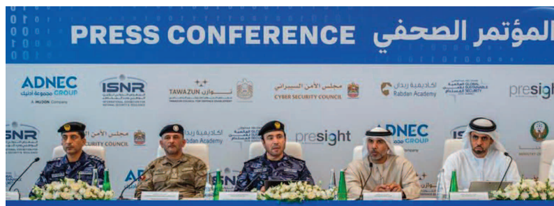
SECURING TOMORROW TODAY

The ninth edition of ISNR will feature the announcement of numerous agreements and commercial deals, underscoring the exhibition's vital role in supporting the development of national industries, enhancing their competitiveness, fostering partnerships, and adding value across various economic sectors