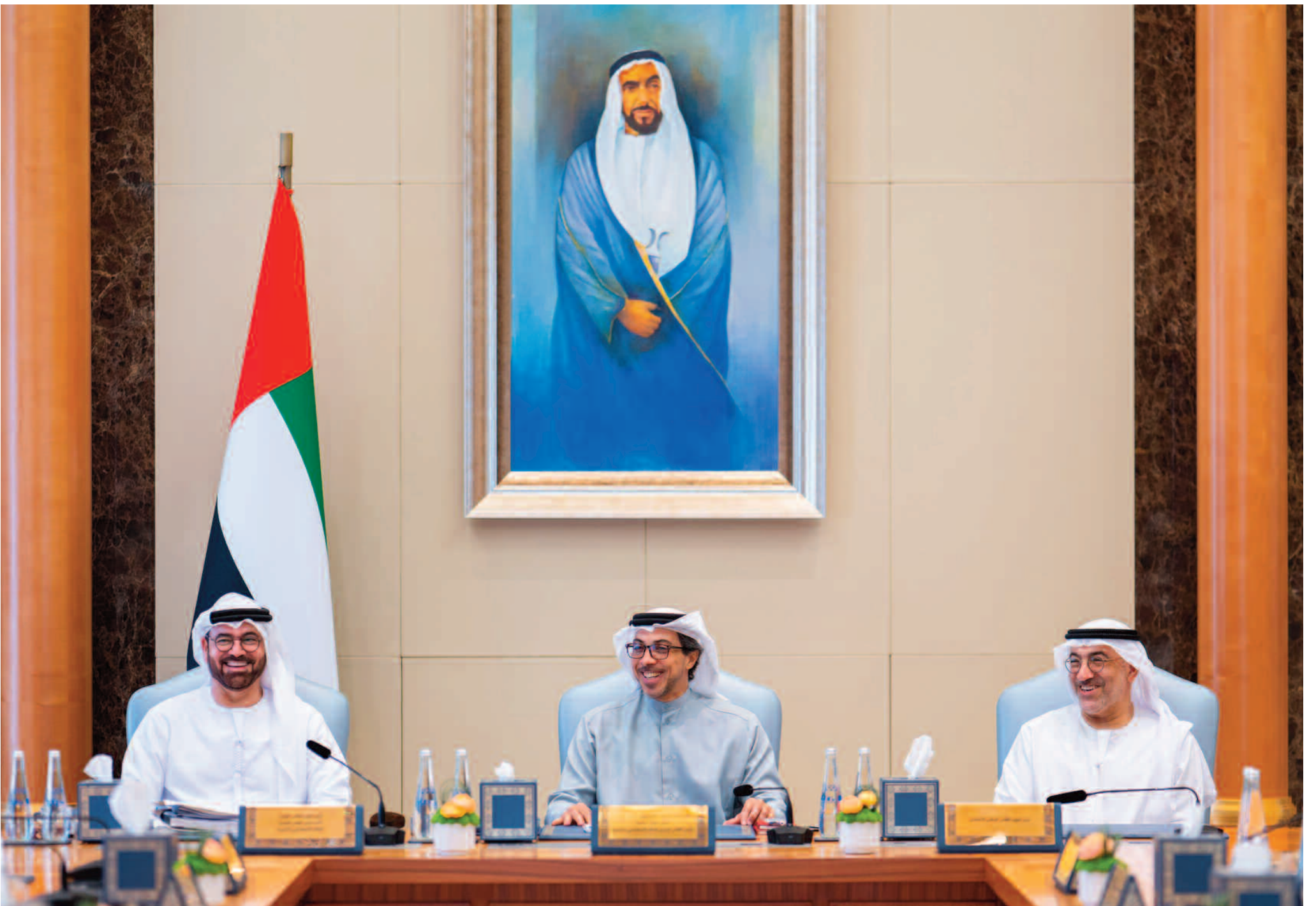
His Highness Sheikh Mansour bin Zayed Al Nahyan, Vice President, Deputy Prime Minister, and Chairman of the Presidential Court, while chairing the meeting of the Ministerial Council for Artificial Intelligence and Development, held at Qasr Al Watan, Abu Dhabi on Wednesday