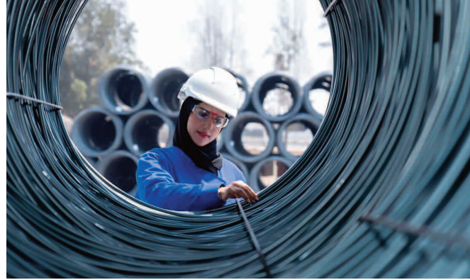
In Q1, EMSTEEL recorded total steel sales volumes, comprising finished steel products and billets, of 768,000 tonnes, representing a 6 percent YoY decline

The improvement was driven by a combination of factors, including lower raw material costs, ongoing optimisation initiatives, a 3 percent YoY in-