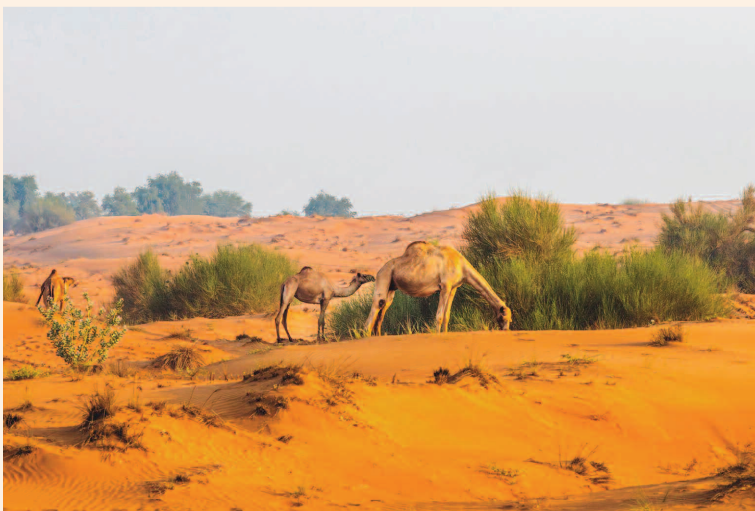
EAD values the role of camel owners and breeders for their cooperation and commitment to adhering to the environmental requirements during camel grazing activities