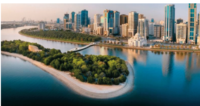
Sales transactions were carried out across 115 areas in Sharjah, covering residential, commercial, industrial, and agricultural properties

According to the data, title deed transactions recorded 8,710 transactions, representing 55.6 percent of total transactions, followed by ownership certificate transactions with 5,291 transactions