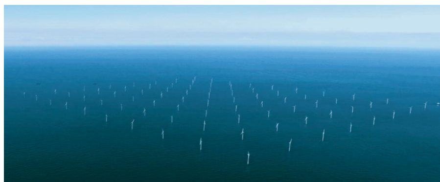
Mubadala has previously invested in renewable energy platforms, including Tata Power Renewables, Skyborn Renewables, PAG Renewables, and Rezolv Energy, supporting renewable power development globally