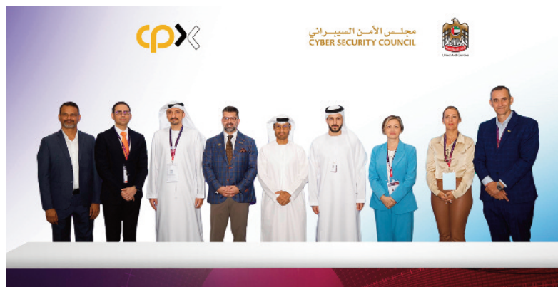
With more than 800,000 daily cyberattacks recorded in recent months, as per the UAE Cyber Security Council, the urgency to build robust and adaptive defences has become critical to safeguarding national infrastructure and public trust —WAM