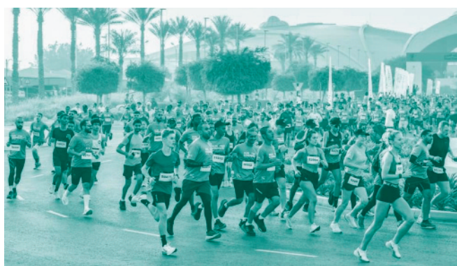
Zayed Charity Run welcomes participants of all ages and backgrounds, creating an inclusive atmosphere where sport serves as a platform for generosity, unity and hope

The run welcomes participants of all ages and backgrounds, creating an inclusive atmosphere where sport serves as a platform for generosity,