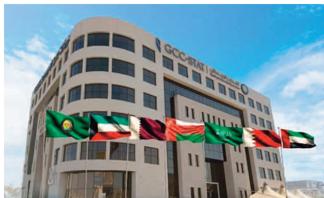
At the real GDP level, the non-oil sector accounted for 70.7 percent, compared to 29.3 percent for the oil sector — WAM

As for real GDP, it reached US$474.4 billion, recording real growth of 5.2 percent, a clear indication that economic growth was not driven solely by price increases, but by an actual expansion in economic activity.