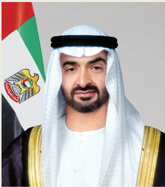
SAN JOSE

On behalf of President His Highness Sheikh Mohamed bin Zayed Al Nahyan, Noura bint Mohammed Al Kaabi, Minister of State, attended the inauguration ceremony of Laura Fernandez, President of the Republic of Costa Rica.