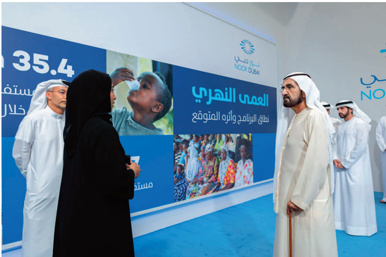
His Highness Sheikh Mohammed bin Rashid Al Maktoum, Vice President and Prime Minister of the UAE and Ruler of Dubai, while announcing the launch of a new initiative in support of ongoing efforts to eradicate river blindness on Sunday