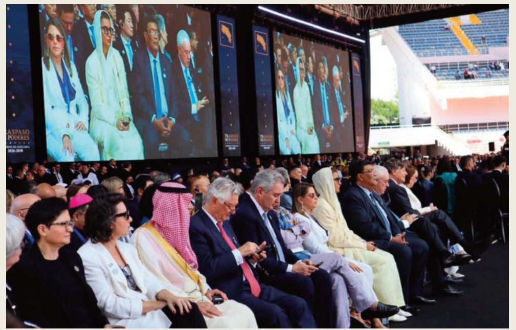
Noura bint Mohammed Al Kaabi, Minister of State, reaffirmed the UAE's commitment to further deepening the bilateral partnership with Costa Rica, which this year marks its sixteenth anniversary since the establishment of diplomatic relations

Noura Al Kaabi reaffirmed the UAE's commitment to further deepening the bilateral partnership with Costa Rica, which this year marks its sixteenth anniversary since the establishment of diplomatic relations. She highlighted the