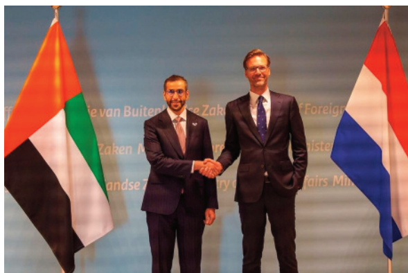
The visit further positions UAE-Netherlands cooperation to respond to evolving global dynamics, including shifts in energy systems, supply chains, and resource security, through more integrated and forward-looking approaches — WAM

He also met with representatives from leading institutions and national entities, including Deltares, IHE Delft, Water Alliance, and the Municipality of Rotterdam. The engagements with research institutes focused on advancing practical