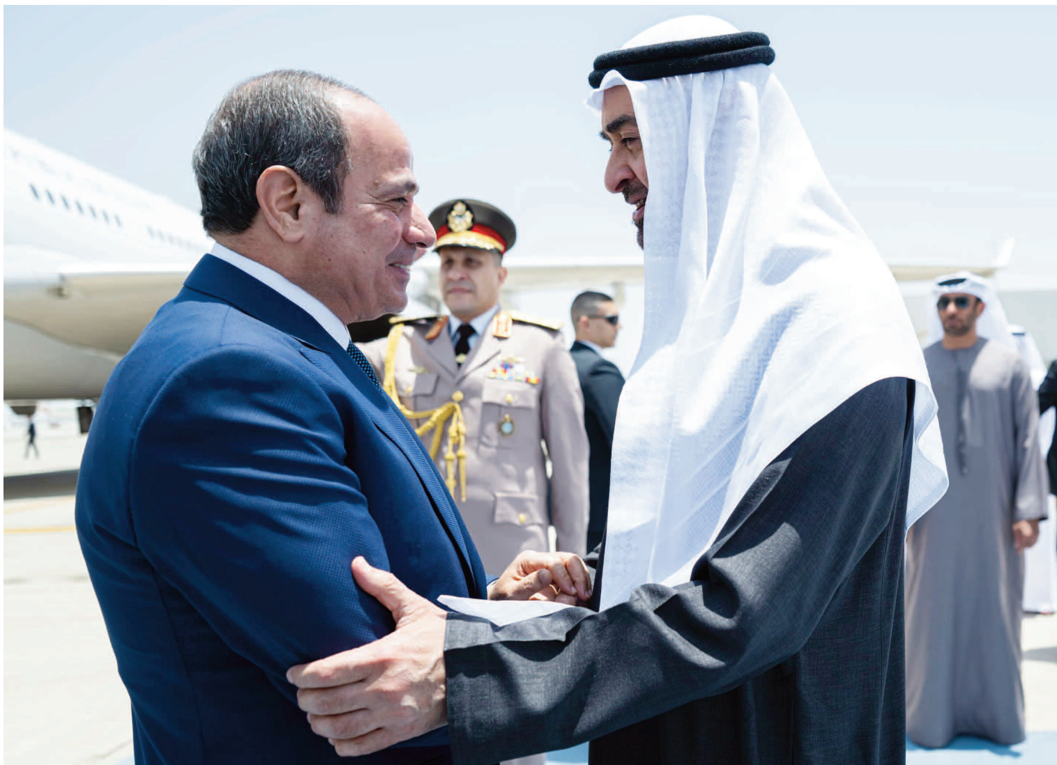
UAE President His Highness Sheikh Mohamed bin Zayed Al Nahyan with His Excellency Abdel Fattah El-Sisi, President of the Arab Republic of Egypt, who is on a fraternal visit to the UAE, in Abu Dhabi on Thursday

UAE President His Highness Sheikh Mohamed bin Zayed Al Nahyan received His Excellency Abdel Fattah El-Sisi, President of the Arab Republic of Egypt, who is on a fraternal visit to the UAE.