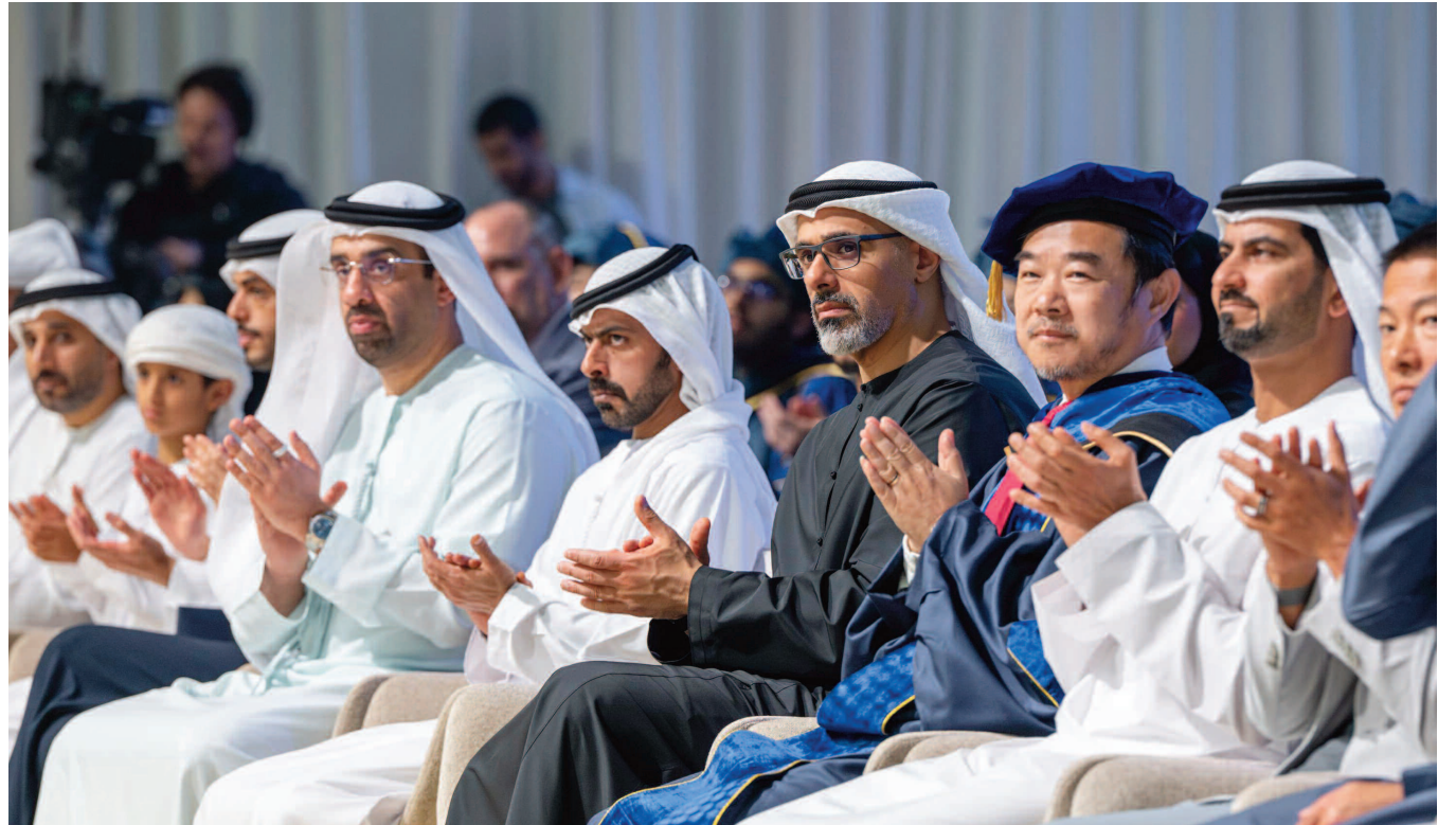
HH Sheikh Khaled bin Mohamed bin Zayed Al Nahyan, Crown Prince of Abu Dhabi and Chairman of the Abu Dhabi Executive Council, while attending the 2026 commencement ceremony of Mohamed bin Zayed University of Artificial Intelligence (MBZUAI) in Abu Dhabi on Thursday