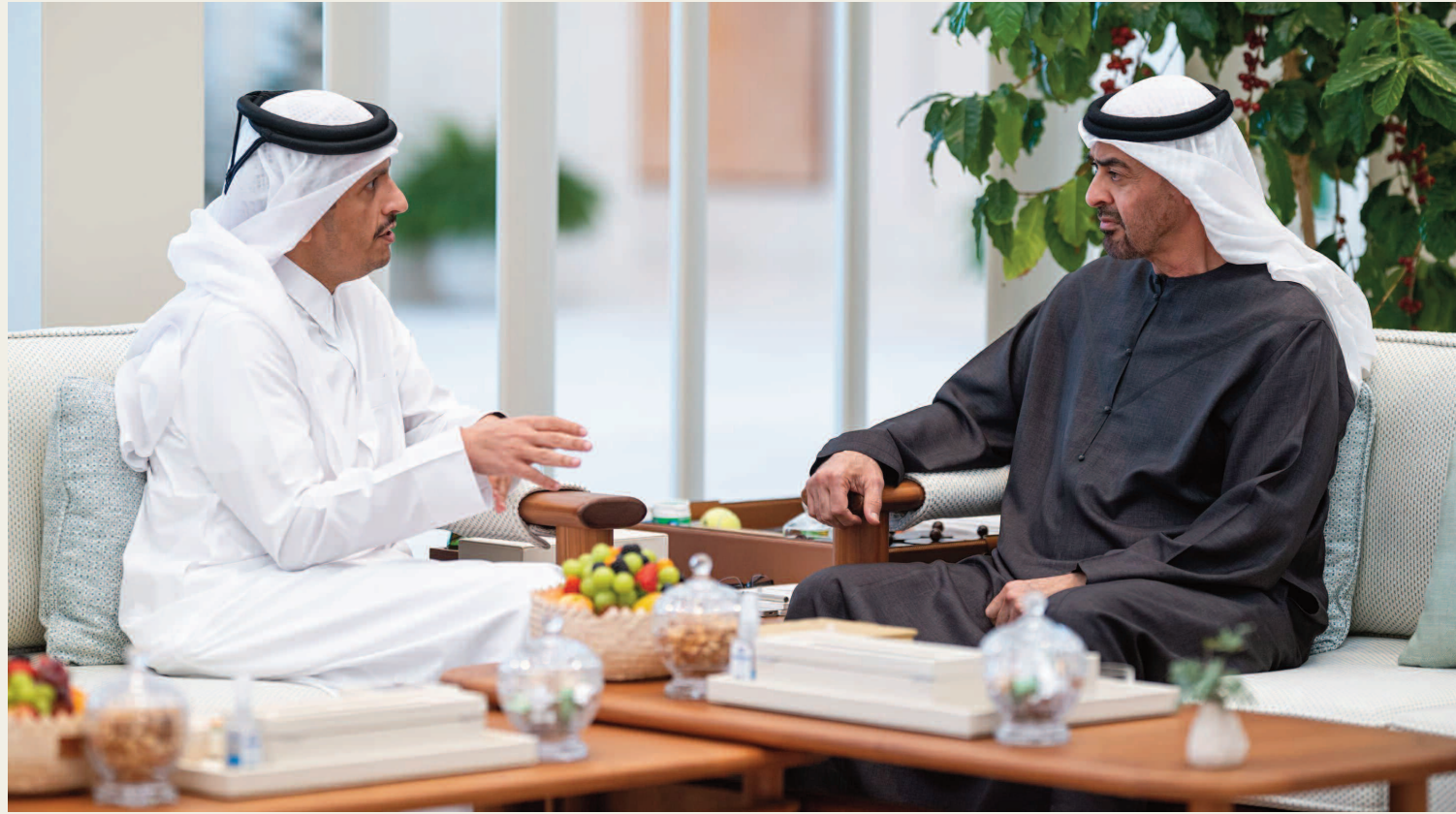
UAE President His Highness Sheikh Mohamed bin Zayed Al Nahyan with His Excellency Sheikh Mohammed bin Abdulrahman bin Jassim Al Thani, Prime Minister and Minister of Foreign Affairs of the State of Qatar, in Abu Dhabi on Thursday