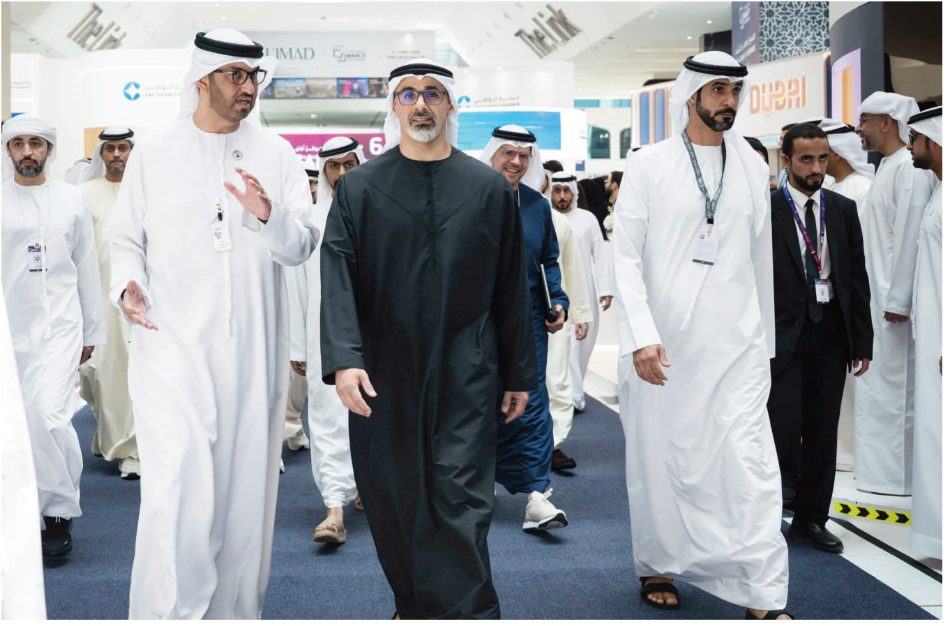
HH Sheikh Khaled bin Mohamed bin Zayed Al Nahyan, Crown Prince of Abu Dhabi and Chairman of the Abu Dhabi Executive Council, while attending the fifth Make it in the Emirates, taking place at ADNEC Centre Abu Dhabi until 7th May 2026, on Tuesday

sented by UAE companies, aimed at further strengthening the national industrial ecosystem and reinforcing the UAE's standing as a regional and global industrial hub, while supporting economic diversification and advancing industrial excellence in line with future aspirations and evolving priorities. HH Sheikh Khaled bin Mohamed underscored that the industrial sector is becoming a cornerstone of sustainable development and a key pillar in building a diversified, resilient national economy prepared to meet the demands of future industries. He further emphasised the importance of public-private partnerships as a strategic driver to attract investment and foster an innovative industrial ecosystem ready to respond to rapid technological change and transform national industrial priorities into high-impact projects. Make it in the Emirates features 1,245 exhibiting companies and more than 2,000 specialised exhibitors, showcasing over 5,000 products. ■ For full story, read www.gulftime.ae