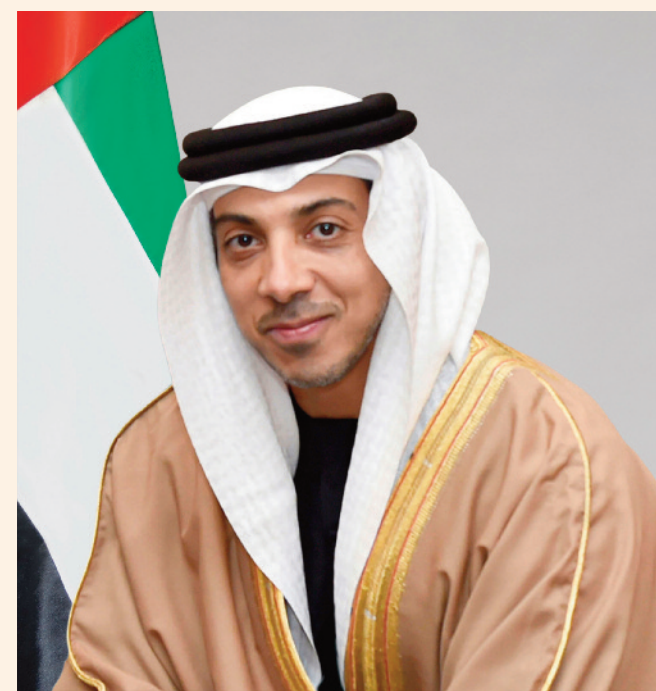
ABU DHABI / WAM