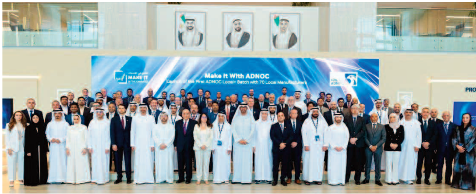
The Make it With ADNOC Forum was convened by Dr Al Jaber and brought together over 400 attendees, including government entities, private sector companies and ADNOC's EPC contractors

The planned project awards span ADNOC's upstream and downstream operations and usher in a new phase of project delivery that will supercharge UAE's manufacturing capacity, strengthen industrial resilience, deepen the impact of the company's In-Country Value program and advance the 'Make it in the Emirates' initiative.