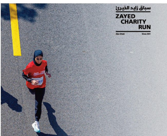
The run is scheduled to take place on 3 May 2026, at Meskel Square in Addis Ababa, Ethiopia, at 7am

The Zayed Charity Run is one of the UAE's most prominent humanitarian and sporting initiatives, launched in honour of the legacy of the late Sheikh Zayed bin Sultan Al Nahyan. Since its inception, it has served