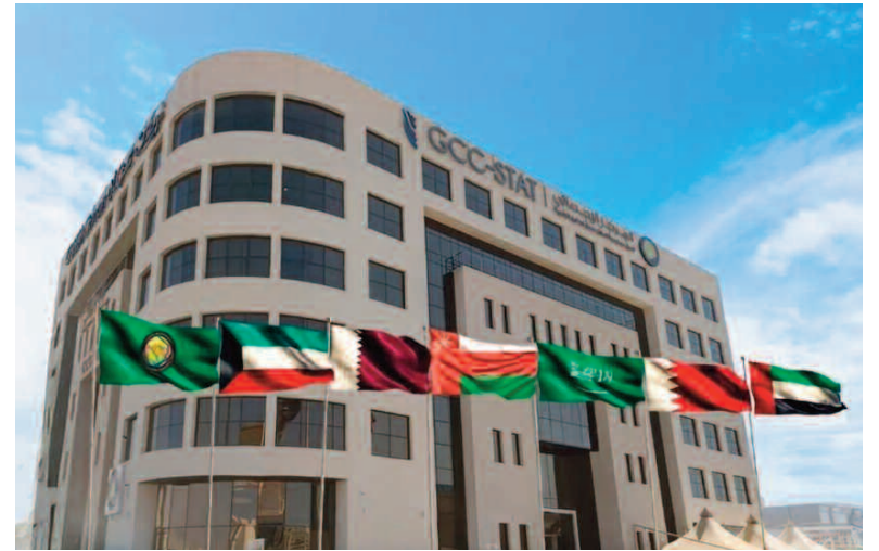
The increase in the contribution of renewable water resources within the overall water resource mix reflects the GCC countries' orientation toward diversifying water sources and reducing pressure on groundwater reserves, thereby supporting sustainable development plans and strengthening water security across the region during the coming phase —WAM

The increase in the contribution of renewable water resources within the overall water resource mix reflects the GCC countries' orientation toward diversifying water sources and reducing pressure on groundwater reserves, thereby supporting sustainable development plans and strengthening water security across the region during the coming phase.