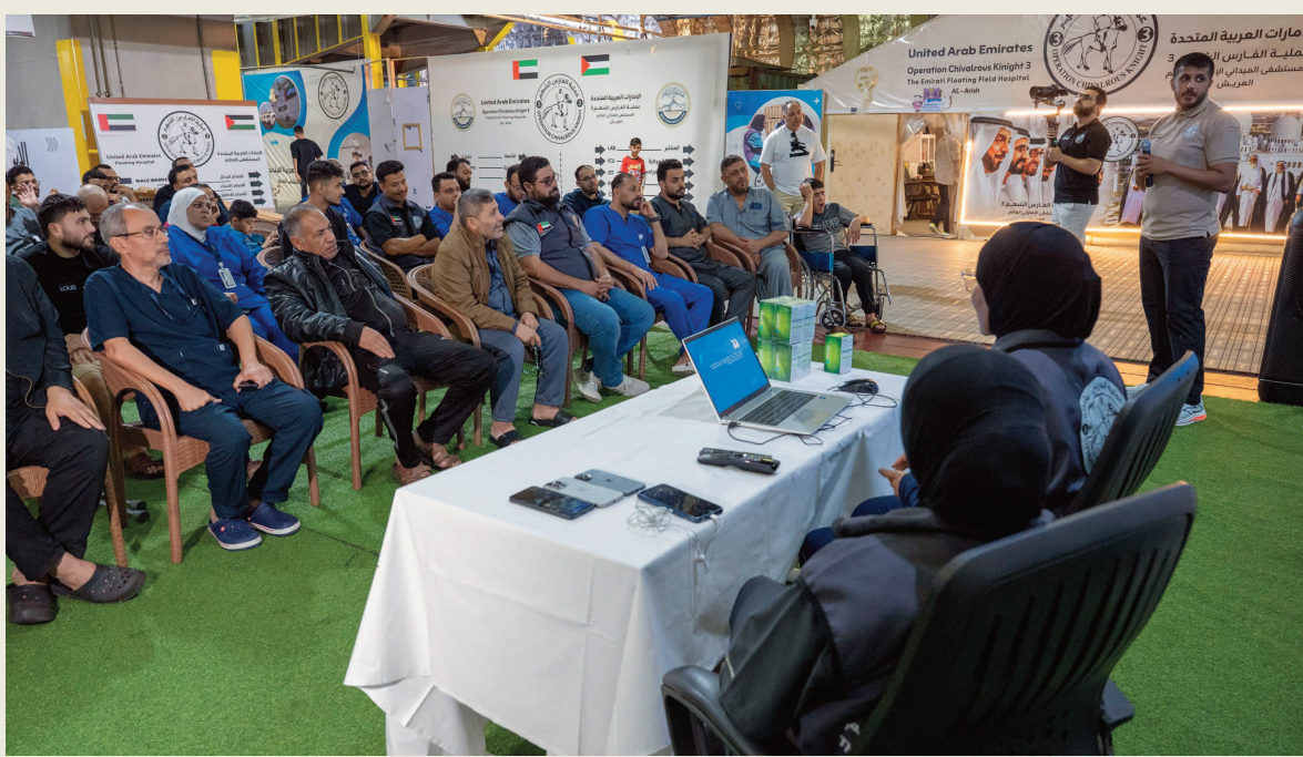
Held as part of Operation Chivalrous Knight 3, the event included awareness sessions and medical consultations highlighting the dangers of smoking, as well as educational materials underscoring the benefits of quitting smoking and preventing chronic diseases