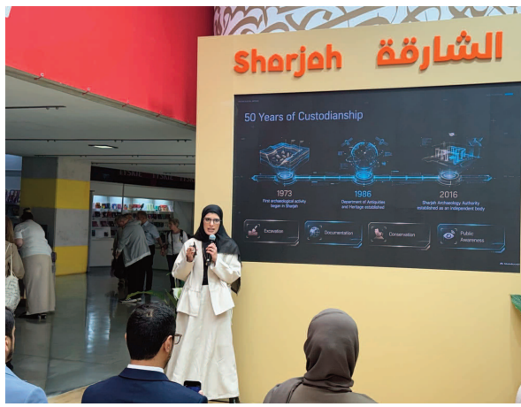
The lecture attracted significant interest from fair visitors and culture and heritage enthusiasts, offering attendees valuable insights into the SAA's key initiatives in archaeological research, digital documentation, and archaeological site management —WAM

The Sharjah Archaeology Authority highlighted its pivotal role in the protection, management, and documentation of archaeo-