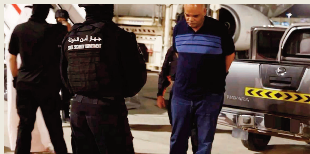
The investigation resulted in conclusive evidence, including the seizure and analysis of financial and commercial records, documents and official correspondence, as well as tracked bank transfers and cash flows linked to the transactions