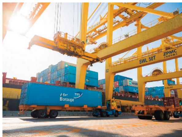
Borouge Plc shareholders approved a total of $1.32 billion of dividend payments in respect of FY 2025 (16.2 fils per share) at the company's Annual General Assembly on 7th April 2026

He added that Borouge delivered a resilient Q1 2026 performance, reflecting strong execution, operational excellence and continuous cost discipline. The business continuity plans have been tested and proven. "With global prices showing encouraging signs of recovery and as market conditions improve, we are