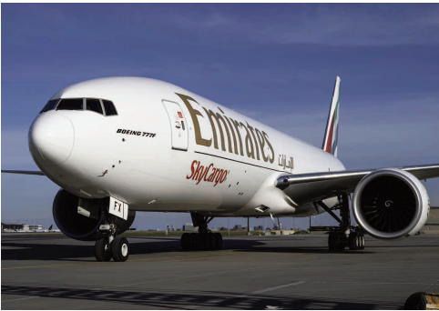
Emirates SkyCargo is an important facilitator of trade to and from Canada since start of passenger flight to Toronto in 2007 —WAM