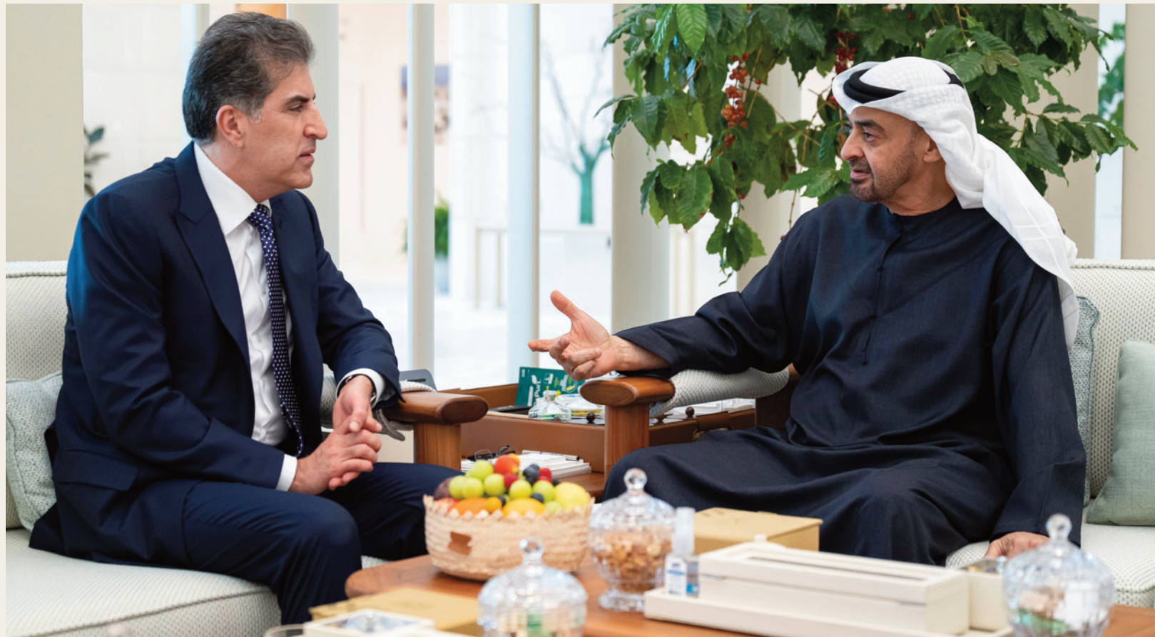
UAE President His Highness Sheikh Mohamed bin Zayed Al Nahyan with Nechirvan Barzani, President of the Kurdistan Region of Iraq, in Abu Dhabi on Thursday