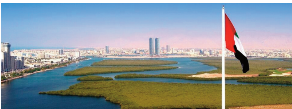
Commercial licences accounted for the largest share at 62.3 percent, underscoring robust business activity and expansion in Ras Al Khaimah

made up 18.2 percent, pointing to expansion in services. Agri-