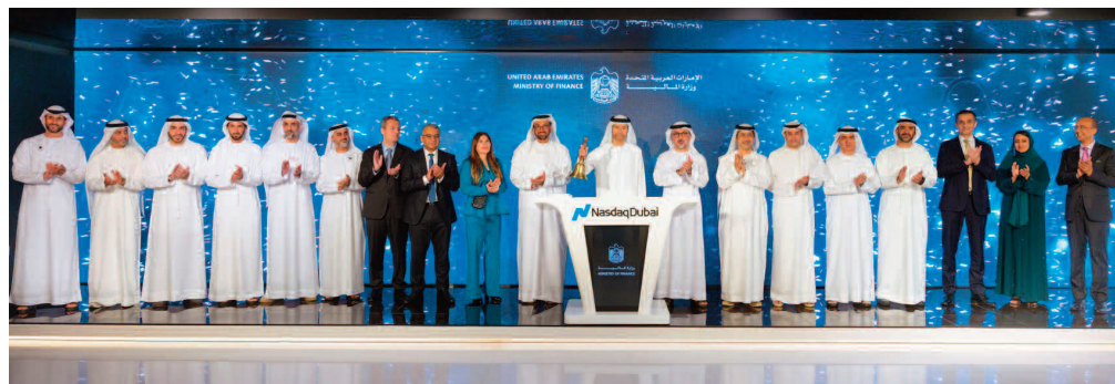
The listing further underlines the growing role of UAE dirham-denominated Islamic Treasury Sukuk within domestic capital markets, contributing to the development of the government debt market and enhancing the visibility of UAE sovereign issuances on Nasdaq Dubai