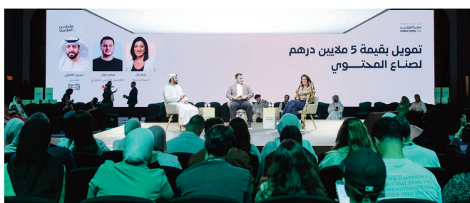
The announcement was made during Creators Gathering, the event bringing together over 1,000 content creators, media professionals, which kicked off on Tuesday at Atlantis, The Palm Dubai

This follows the strategic partnership signed between Creators