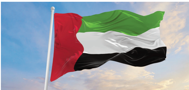
The UAE is a trusted producer of some of the world's most cost-competitive and lower-carbon barrels the market's pressing needs.

This decision follows a comprehensive review of the UAE's production policy and its current and future capacity and is based on our national interest and our commitment to contributing effectively to meeting