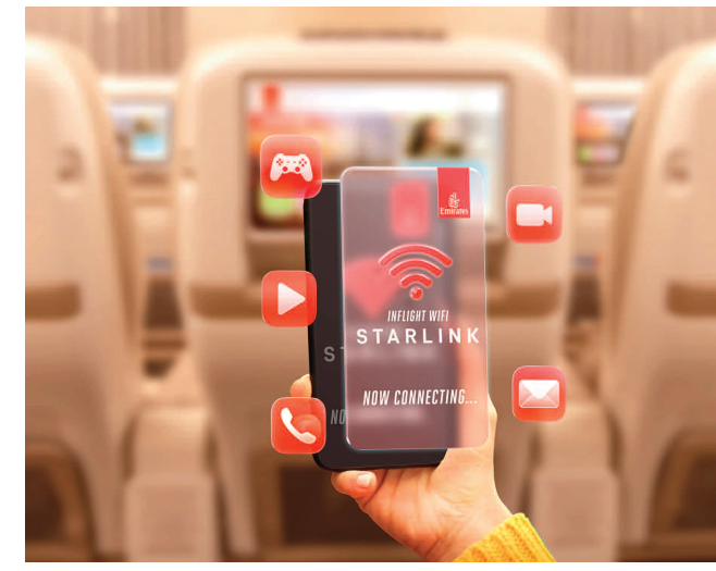
Starlink installations will begin at Emirates Engineering facilities in Dubai to speed up fleet-wide deployment

Starlink installations will begin at Emirates Engineering