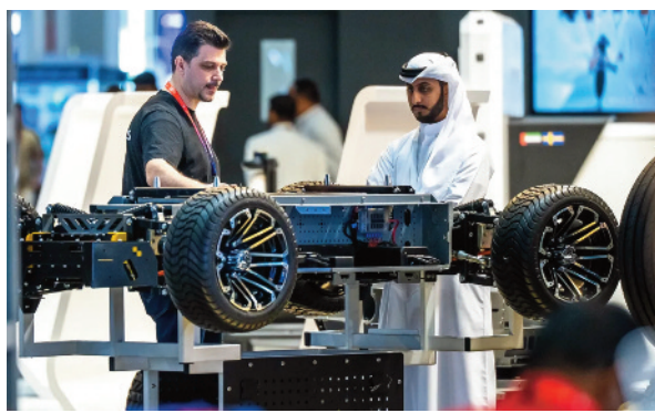
At MIITE 2026, MoIAT will unveil a series of forward-looking initiatives designed to strengthen the UAE's industrial resilience and support companies through today's volatile environment

The forum was chaired by His Excellency Dr Sultan bin Ahmed Al Jaber, Minister of Industry and Advanced Technology and Managing Director and CEO of ADNOC and its group of companies, with the participation of a number of ministers from the UAE government and representatives of industrial