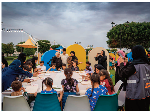
A total of 35 children, teenagers, and young entrepreneurs from Al Aamerah and surrounding areas took part in the ‘Where Life Pulses’ event, managing their own projects with the support of their families

The Department of Community Development – Abu Dhabi (DCD Abu Dhabi) has successfully concluded the first activation of the ‘Where Life Pulses’ initiative, which ran from 10th to 12th April 2026 at Al Aamerah Park in the Al Aamerah district of Al Ain. The event attracted more than 22,000 visitors, underscoring the success of the initiative, which aimed to enhance social interaction and strengthen community bonds through a diverse range of community-focused activities.