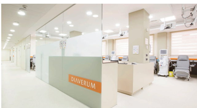
As M42 continues to expand globally, insights and clinical learnings from high-volume markets such as Brazil will further strengthen innovation, research and care delivery capabilities across its geographical footprint

Diaverum's expanded operations in Brazil will deliver more than 220,000 treatments annually. The platform combines owned clinics, public hospital partnerships, and acute service agreements,