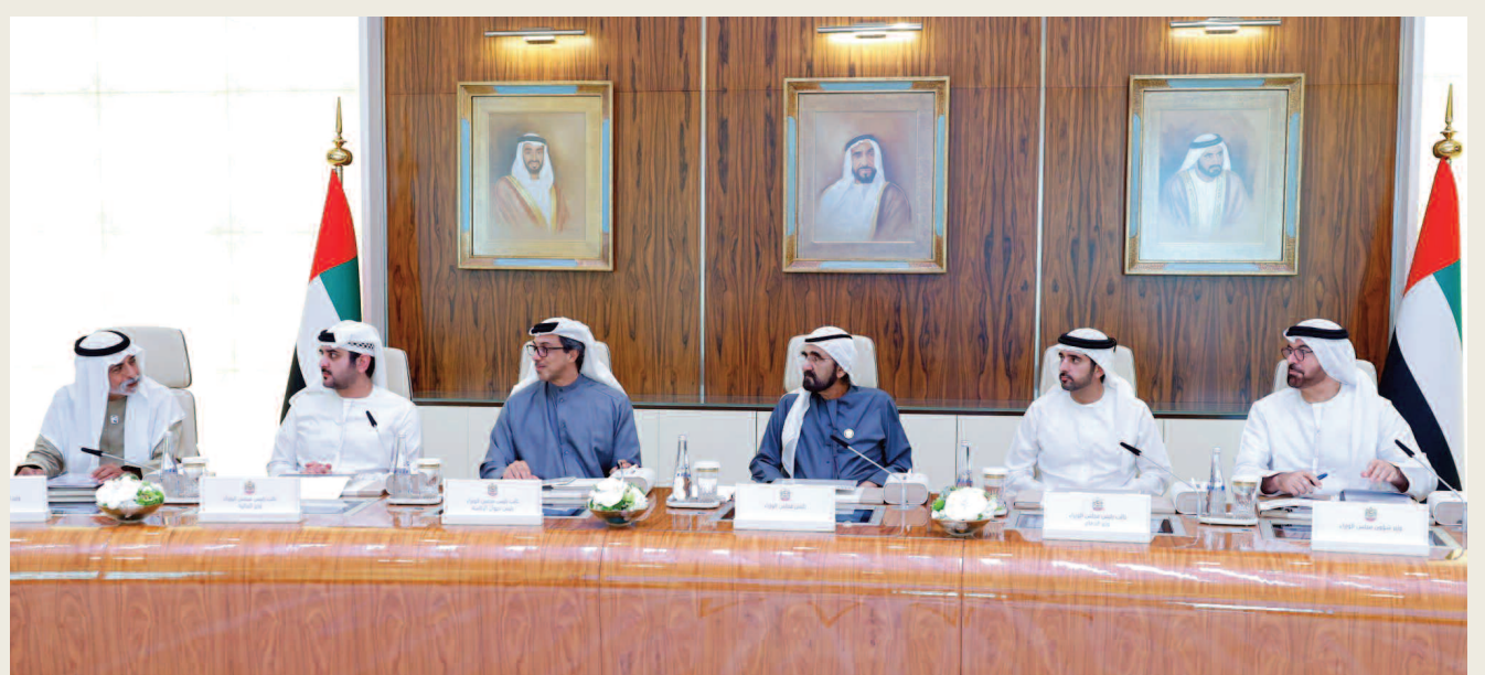
His Highness Sheikh Mohammed bin Rashid Al Maktoum, Vice President, Prime Minister and Ruler of Dubai, with His Highness Sheikh Mansour bin Zayed Al Nahyan, Vice President, Deputy Prime Minister, and Chairman of the Presidential Court, while chairing the UAE Cabinet meeting in Abu Dhabi on Thursday

that period, the performance of ministers, directors general, and entities will be assessed based on their ability to adopt this transformation, their speed in implementing the new standards... their understanding of the world new technological reality, and their mastery of artificial intelligence tools to create new