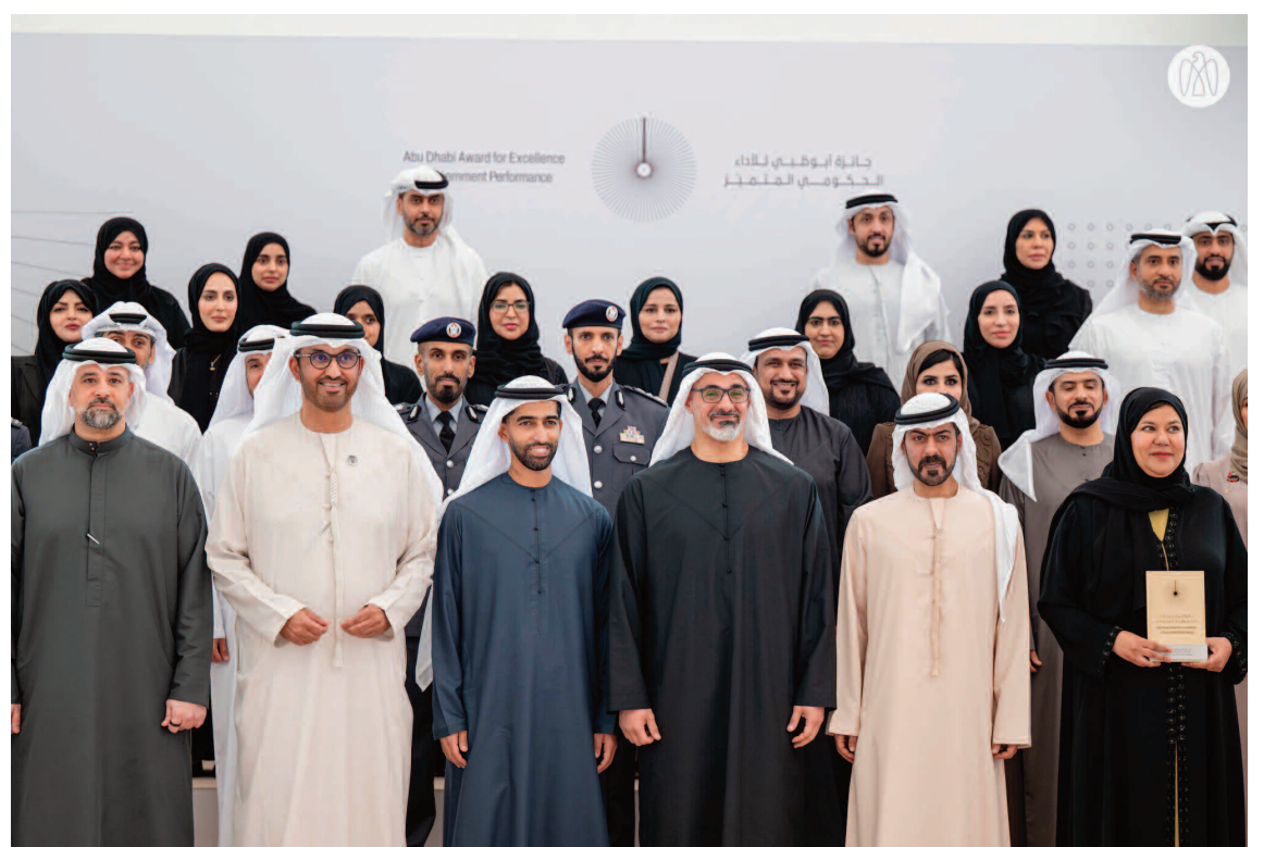
His Highness Sheikh Khaled bin Mohamed bin Zayed Al Nahyan, Crown Prince of Abu Dhabi and Chairman of the Abu Dhabi Executive Council, while honouring winners of the Abu Dhabi Award for Excellence in Government Performance (ADAEP) at ADNEC Centre in Abu Dhabi on Thursday