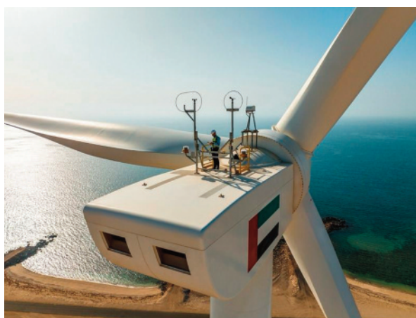
From a handful of employees in 2006, Masdar now employs over 1,100 people across 12 countries

Dr. Sultan Ahmed Al Jaber, Minister of Industry and Advanced Technology and Masdar's founding CEO, said, "In 2006, investing in renewable energy wasn't the obvious call. It was the courageous one. Technologies were nascent. Scale was unproven. The economics hadn't yet turned. His Highness Sheikh Mohamed bin Zayed Al Nahyan saw not what renewables were, but what they could become