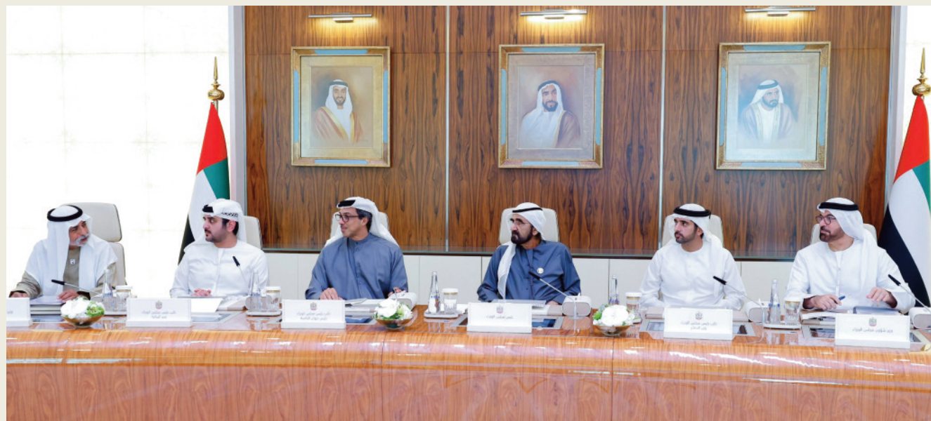
His Highness Sheikh Mohammed bin Rashid Al Maktoum, Vice President, Prime Minister and Ruler of Dubai, with His Highness Sheikh Mansour bin Zayed Al Nahyan, Vice President, Deputy Prime Minister, and Chairman of the Presidential Court, while chairing the UAE Cabinet meeting in Abu Dhabi on Thursday

deploy Agentic AI models across its government sectors and operations."