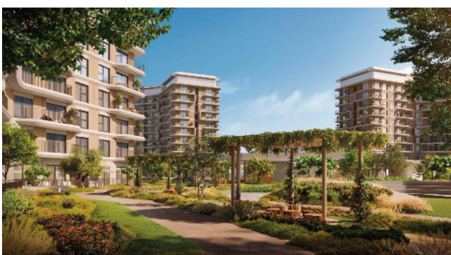
Aldar released four buildings in the first phase, with the remaining two buildings to be released in the second phase, building on the strong momentum generated during launch