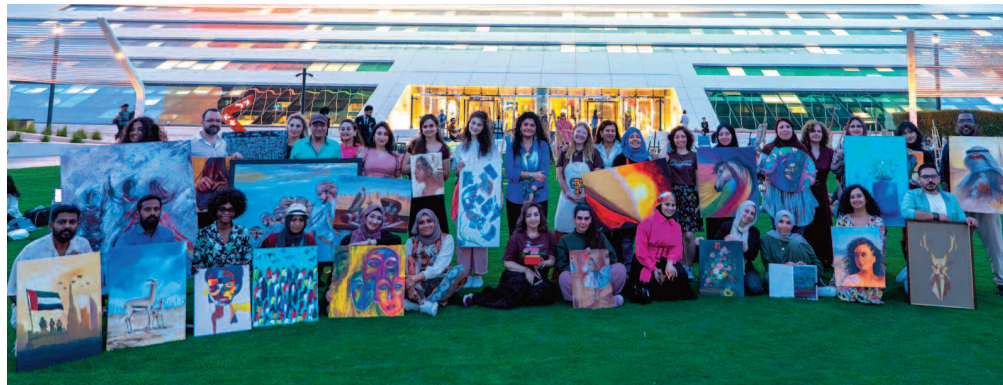
The event witnessed strong attendance from the public, art enthusiasts, and artists, with attendees praising the diversity and quality of the programme. They highlighted the importance of such initiatives in supporting artists and providing opportunities to present their work to a broad and diverse audience

The initiative underscores the library's ongoing efforts to promote art and enrich the local cultural landscape