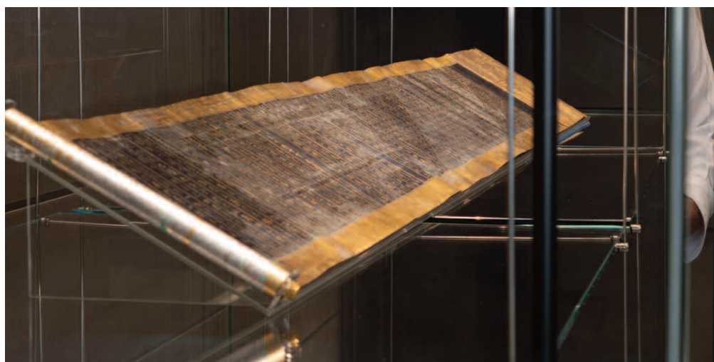
Through its continued investment in restoration, digitisation, and the development of local talent, the Library reaffirms its commitment to serving as a global platform for preserving human heritage and a hub of knowledge that fosters cultural dialogue among nations and strengthens the cultural identity of future generations

The library houses more than 8,000 rare items, along with hundreds of unique pieces in the Treasures of the Library Exhibition, making it a global centre for preserving cultural heritage in its various languages and forms