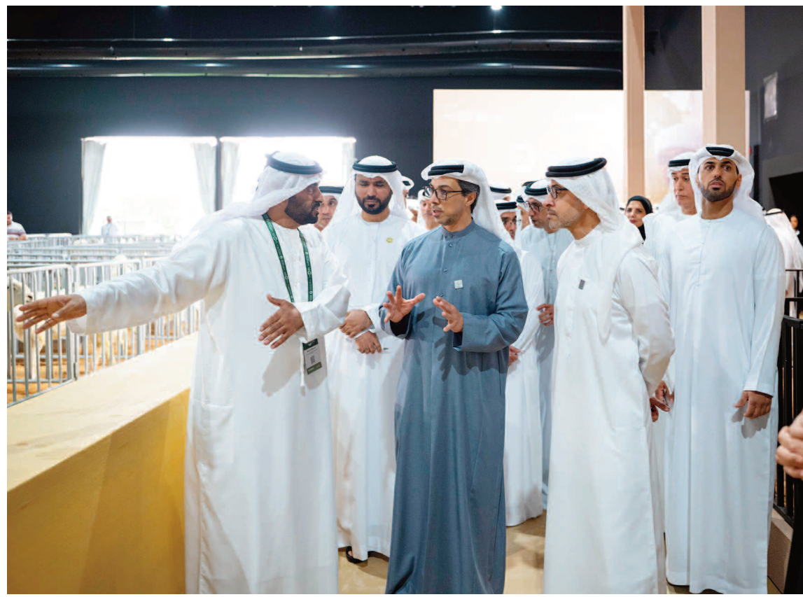
His Highness Sheikh Mansour bin Zayed Al Nahyan, Vice President, Deputy Prime Minister and Chairman of the Presidential Court, and HH Sheikh Hazza bin Zayed Al Nahyan, Ruler's Representative in Al Ain Region, while witnessing the launch of the second edition of the EACE 2026 in Al Ain on Wednesday

AL AIN / WAM His Highness Sheikh Mansour bin Zayed Al Nahyan, Vice President, Deputy Prime Minister and Chairman of the Presidential Court, and HH Sheikh Hazza bin Zayed Al Nahyan, Ruler's Representative in Al Ain Region, witnessed the launch of the second edition of the Emirates Agriculture Conference and Exhibition (EACE) 2026, which is being held in Al Ain from April 22 to 26. During the visit, Their Highnesses toured the exhibition pavilions, where they reviewed the latest advancements in modern agriculture that enhance the efficiency of local agricultural production. The tour featured several national company platforms showcasing innovative solutions to address climate challenges in desert environments, alongside companies specialising in advanced food industries. This reflects the country's broader efforts to establish an agricultural model that is both resilient and adaptable to environmental change, ultimately contributing to strengthened food security. ■ For full story, read www.gulfime.ae