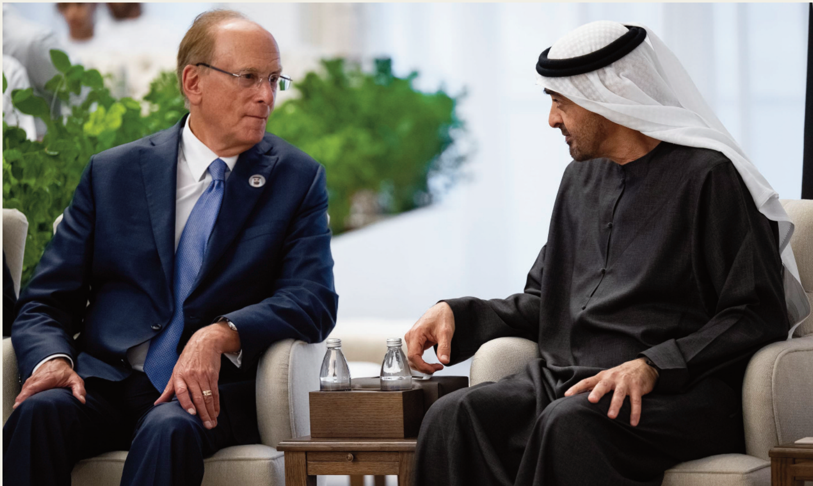
UAE President His Highness Sheikh Mohamed bin Zayed Al Nahyan with Larry Fink, Chairman and Chief Executive Officer of BlackRock, in Abu Dhabi on Wednesday