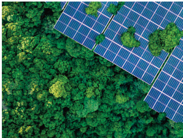
FAB remained on track against its 2030 pathways across eight high-emitting sectors, supported by improved client disclosures and early transition actions

The report outlined FAB's approach to measuring, managing and reducing climate and nature-related impacts across its operations and financing portfolio. It also demonstrated how the bank is translating its net zero and nature-positive commitments into tangible,