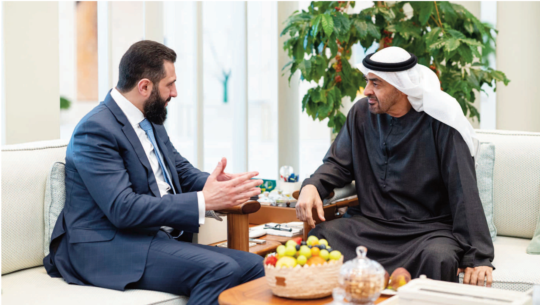
UAE President His Highness Sheikh Mohamed bin Zayed Al Nahyan with His Excellency Ahmed Al-Sharaa, President of the Syrian Arab Republic, in Abu Dhabi on Wednesday