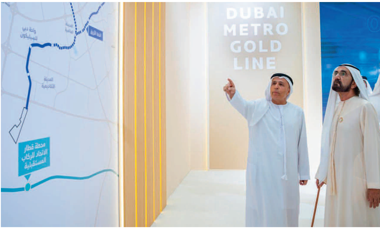
His Highness Sheikh Mohammed bin Rashid Al Maktoum, Vice President and Prime Minister of the UAE and Ruler of Dubai, while approving the Dubai Metro Gold Line, the emirate's largest sustainable transport project in Dubai on Wednesday