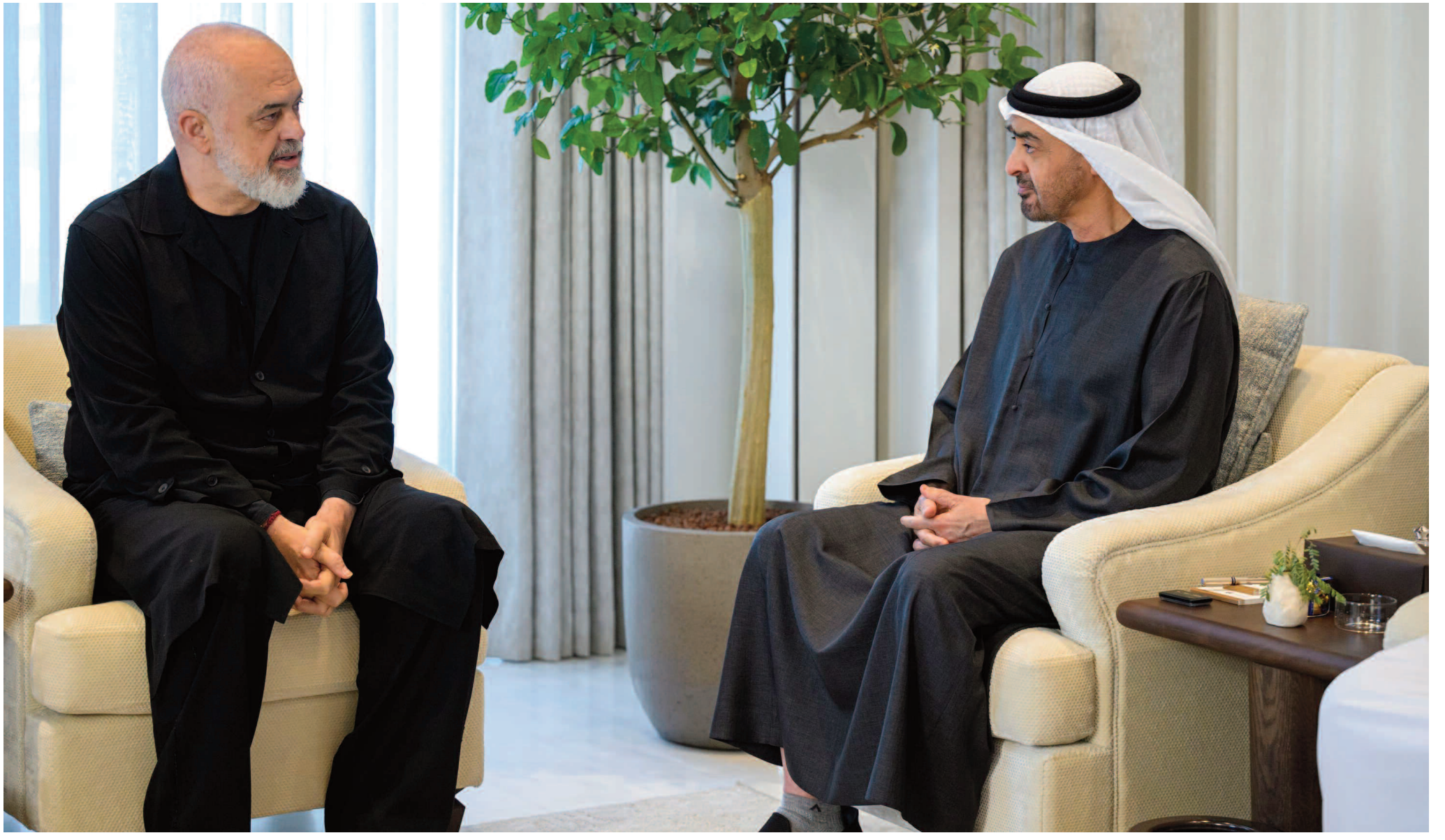
UAE President His Highness Sheikh Mohamed bin Zayed Al Nahyan with His Excellency Edi Rama, Prime Minister of the Republic of Albania, who is on a working visit to the UAE, in Abu Dhabi on Monday