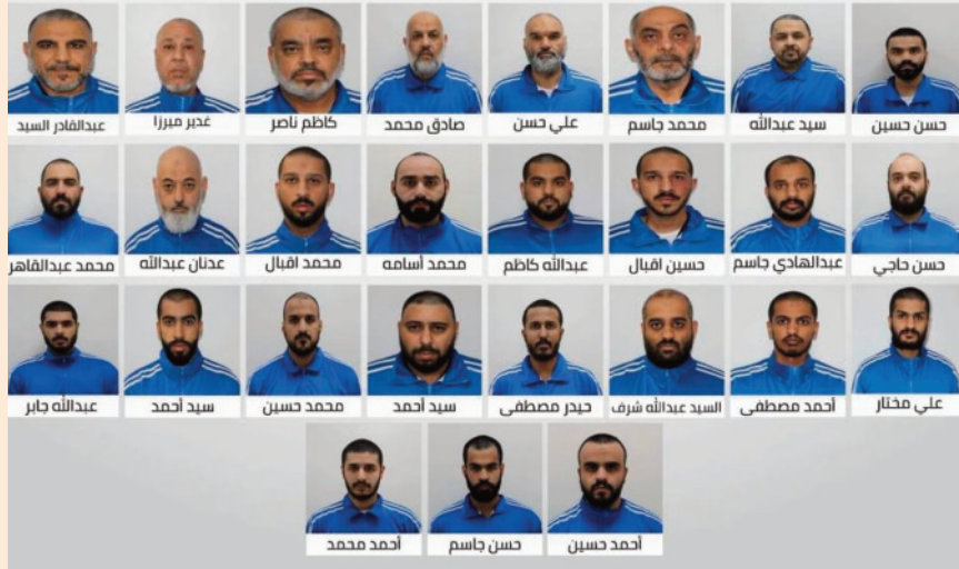
The UAE State Security Department's Investigations revealed links between the organisation and Iran's "Wilayat al-Faqih" ideology —WAM

According to surveillance and follow-up investigations, the organisation held clandestine meetings inside and outside the country with terrorist elements and