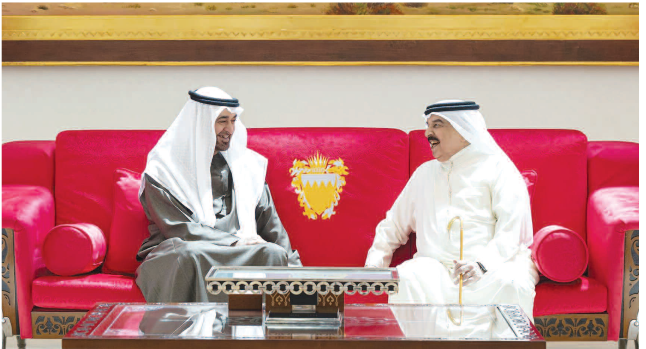
UAE President His Highness Sheikh Mohamed bin Zayed Al Nahyan with His Majesty King Hamad bin Isa Al Khalifa of the Kingdom of Bahrain in Manama on Monday