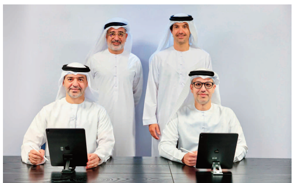
The agreement consolidates a strong working relationship between DET and HSBC, which has evolved significantly in recent years through joint international engagement and investment promotion initiatives —WAM

The agreement brings together DET's mandate to drive Dubai's economic agenda with HSBC's global network and international connectivity, to further position Dubai as a preferred hub for capital deployment, access to global markets, and support cross-border expansion across the Middle East, Africa, and South Asia.