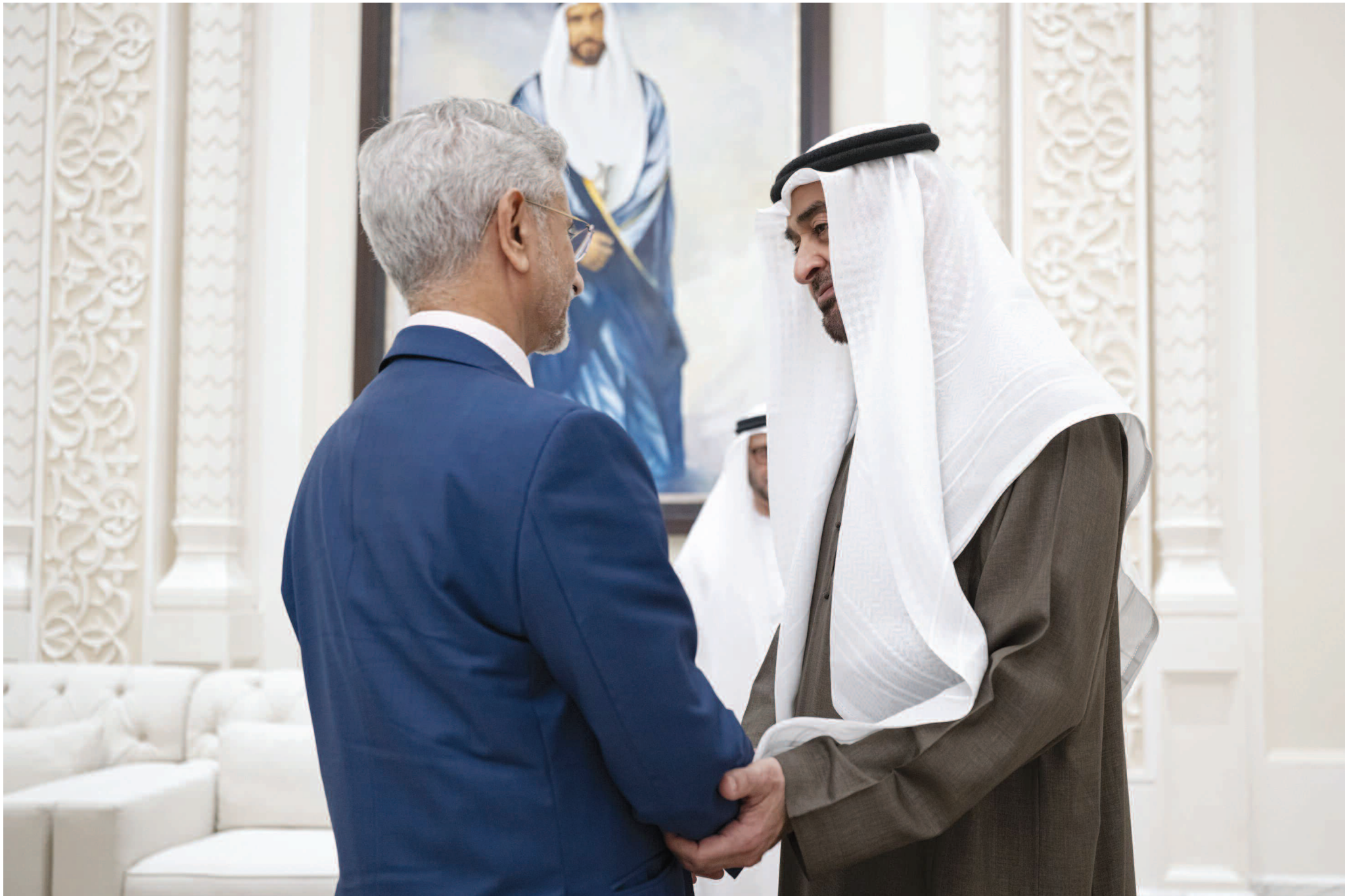
UAE President His Highness Sheikh Mohamed bin Zayed Al Nahyan with His Excellency Dr Subrahmanyam Jaishankar, Minister of External Affairs of the Republic of India, in Abu Dhabi on Sunday