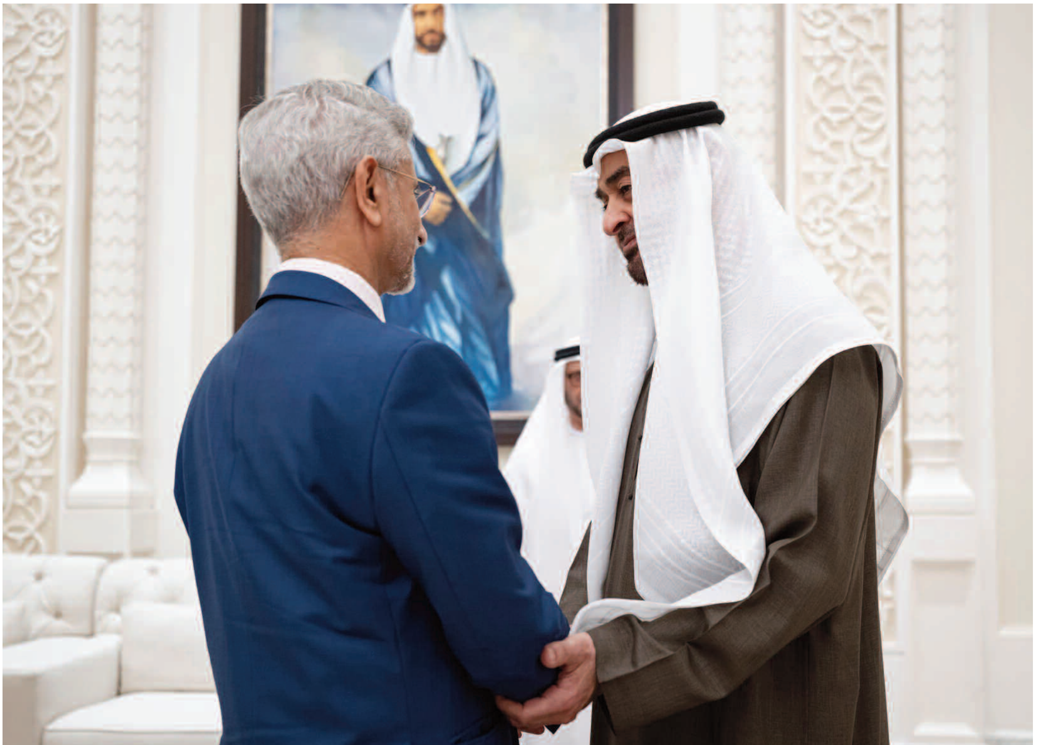
UAE President His Highness Sheikh Mohamed bin Zayed Al Nahyan with His Excellency Dr Subrahmanyam Jaishankar, Minister of External Affairs of the Republic of India, in Abu Dhabi on Sunday