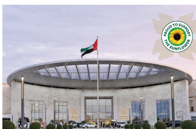
Led locally by Zayed Authority for People of Determination as the enabling partner in the UAE and supported by Topland as the exclusive partner of Hidden Disabilities Sunflower in the Middle East (official accreditation body of the Sunflower lanyards), the partnership brings the globally recognised initiative to Yas Mall

As part of this commitment, Aldar has commissioned 10,000 Sunflower lanyards, produced by People of Determination, enrolled at Zayed Authority for People of Determination's printing