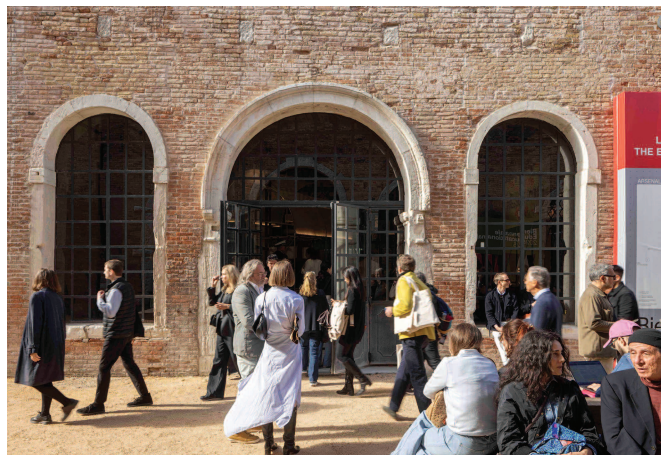
The title "Washwasha", a phonetic rendering of the Arabic word for "whispering", serves as a starting point for exploring themes of movement, technology, oral histories, and the relationship between language, body, and identity

'Washwasha' situates contemporary artistic practices within this extended continuum of transmission and exchange