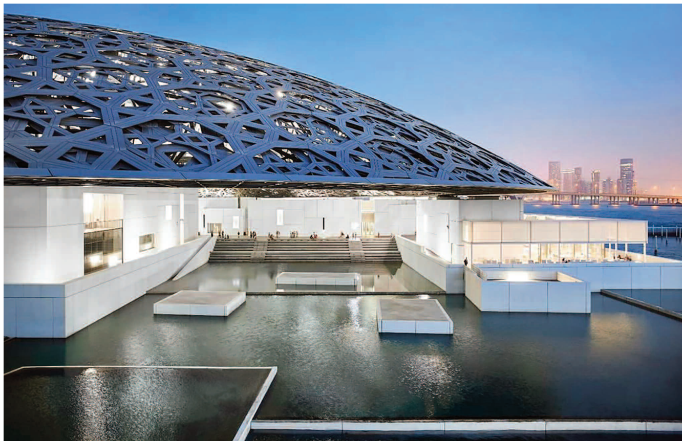
The call for proposals is open until 31st May 2026, and artists can submit their proposals via Louvre Abu Dhabi's website