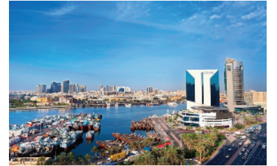
China ranked seventh among the countries of origin for new foreign companies joining Dubai Chamber of Commerce in 2025

China ranked seventh among the countries of origin for new foreign companies joining Dubai Chamber of