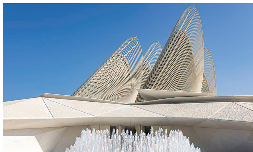
For residents and visitors looking to explore more than one museum in a single visit or across several weeks, the pass offers both the flexibility and the value to make that easy

■ Louvre Abu Dhabi, the first universal museum in the Arab world, brings together art and artefacts from across civilisations and centuries, tracing the connections between cultures from antiquity to the present