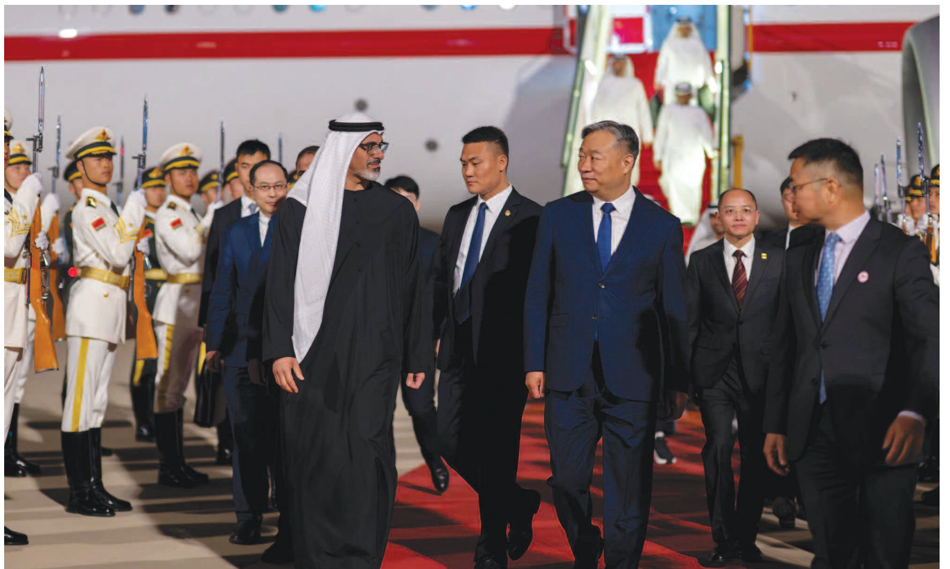
His Highness Sheikh Khaled bin Mohamed bin Zayed Al Nahyan, Crown Prince of Abu Dhabi, during his arrival in Beijing to start an official visit to the People's Republic of China on Sunday