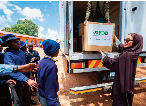
Launched in 2023 during the UAE's Year of Sustainability, the "Donate Your Own Device" campaign, represents an exceptional Emirati model that combines humanitarian innovation with environmental sustainability

Omar Sultan Al Olama, Minister of State for Artificial Intelligence, Digital Economy and Remote Work Applications and Chairman of the Board of the Digital School, stated that the campaign's achievements embody the UAE's vision and reflect the leadership's strategic directives to leverage technology and digital knowledge in humanitarian and community empowerment, thus contributing to