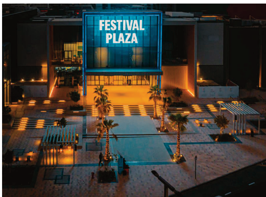
The strong holiday results signal positive momentum and long-term resilience for the retail sector, with a clear strategy focused on stability, customer engagement, and the enduring strength of the malls as a center for community

“The strong Ramadan and Eid performance across our portfolio reflects the underlying strength and resilience of our malls business, particularly in an environment where customer expectations and market dynamics continue to evolve