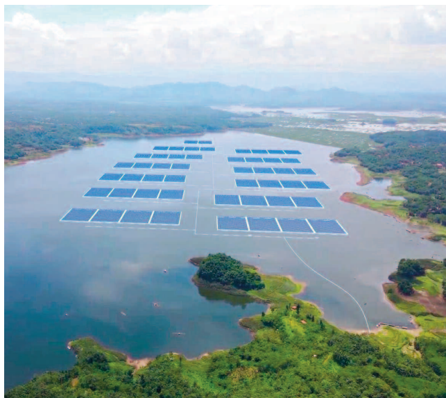
The Masdar-TotalEnergies JV will have a portfolio capacity of 3 GW of operational assets and 6 GW of assets in advanced development that are expected to be operational by 2030. Each partner will contribute assets of comparable value

Dr. Sultan Al Jaber, Minister of Industry and Advanced Technology and Chairman of Masdar, said, "The UAE has es-