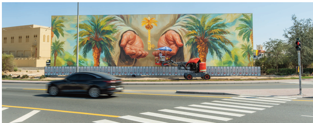
'Al Amanah - a Sheikh Zayed Memorial' project is a pioneering cultural and national achievement that embodies the concepts of giving and resilience rooted in Sheikh Zayed's journey

Paying tribute to the late Sheikh Zayed bin Sultan Al Nahyan, may his soul rest in peace, Dubai Culture and Arts Authority (Dubai Culture) and Dubai's Road and Transport Authority (RTA) have unveiled 'Al Amanah,' a Sheikh Zayed Memorial. The mural, delivered in collaboration with Tashkeel, honours the founding father and his role in laying the foundations of the Union; while celebrating the values he instilled in society and their enduring im-