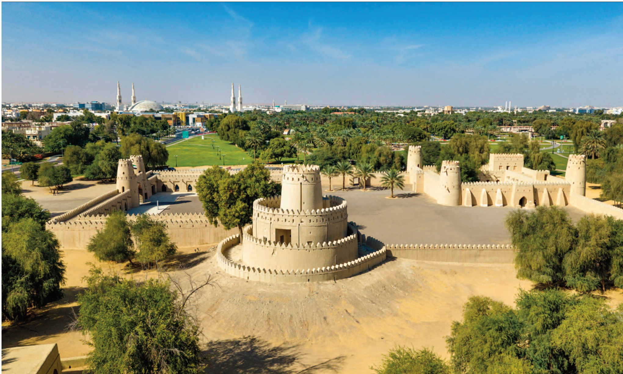
Al Ain Region, renowned as Abu Dhabi's "living oasis" and home to The Cultural Sites of Al Ain, a UNESCO World Heritage Site, boasts a rich history, with evidence of human presence spanning 8,000 years. Its unique blend of cultural heritage, world-class hospitality, and adventure tourism has earned it the prestigious title of Gulf Tourism Capital for 2025 and Arab Capital of Tourism for 2026