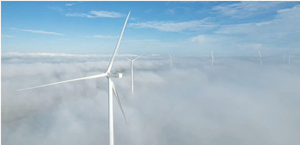
Mubadala’s and Actis’ combined commitment to Rezolv Energy will help accelerate the company’s growth, with the goal of seeing Rezolv Energy become the market-leading renewable energy champion in Central and Eastern Europe —WAM

ABU DHABI / WAM Mubadala Investment Company has committed circa €300 million to partner with leading growth market sustainable infrastructure investor Actis in Rezolv Energy, a rapidly scaling independent renewable energy platform in Central and Eastern Europe. Since Actis has launched and invested in Rezolv Energy, it has emerged as a key player in clean power generation in Central and Eastern Europe and is helping companies and countries across the region meet their energy needs in response to energy security challenges and climate policies