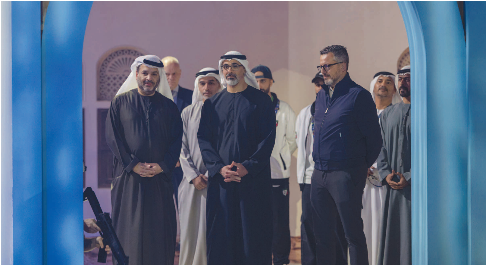
His Highness Sheikh Khaled bin Mohamed bin Zayed Al Nahyan, Crown Prince of Abu Dhabi and Chairman of the Abu Dhabi Executive Council, while attending the hybrid digital (phygital) competitions at Games of the Future 2025, taking place at ADNEC Centre Abu Dhabi until 23 December on Monday

The championship is organised by ASPIRE, the innovation acceleration arm of the Advanced Technology Research Council, with support from Abu Dhabi National Oil Company