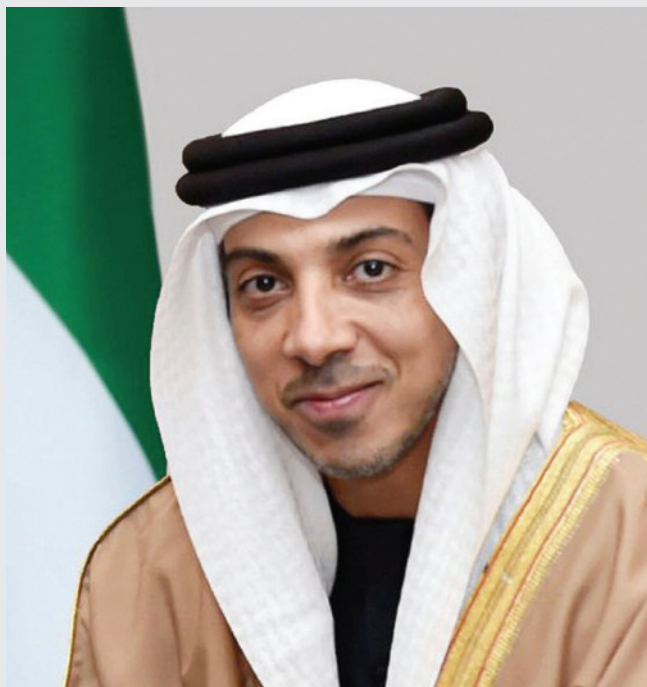
ABU DHABI / WAM