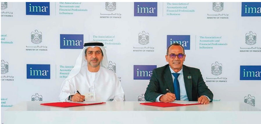
The signing of this MoU builds on the successes of the Ministry’s previous initiatives to develop national talent, notably qualifying over 145 Emirati employees in collaboration with other international associations in the areas of accounting standards, public finance and financial sustainability

The Ministry of Finance (MoF) has signed a strategic Memorandum of Understanding (MoU) with the Institute of Management Accountants (IMA) to launch the Certified Management Accountant (CMA) and Financial and Managerial Accounting Associate (FMAA) certifications.