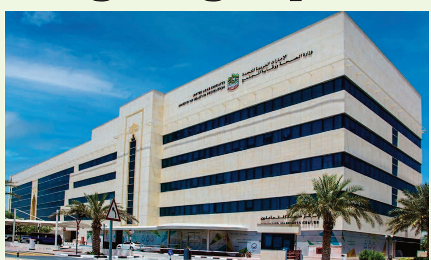
As part of its ongoing healthcare reforms, the UAE government has prioritised the continuous development of its legislative and regulatory frameworks to strengthen community resilience

It calls for raising public awareness, educating individuals on prevention methods, encouraging regular screening, expanding access to integrated healthcare services, and working toward ending hepatitis as a public health problem by 2030 in line with the global