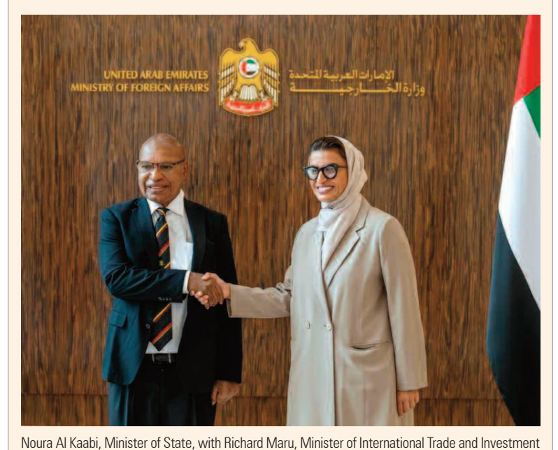
of the Independent State of Papua New Guinea, in Abu Dhabi on Sunday