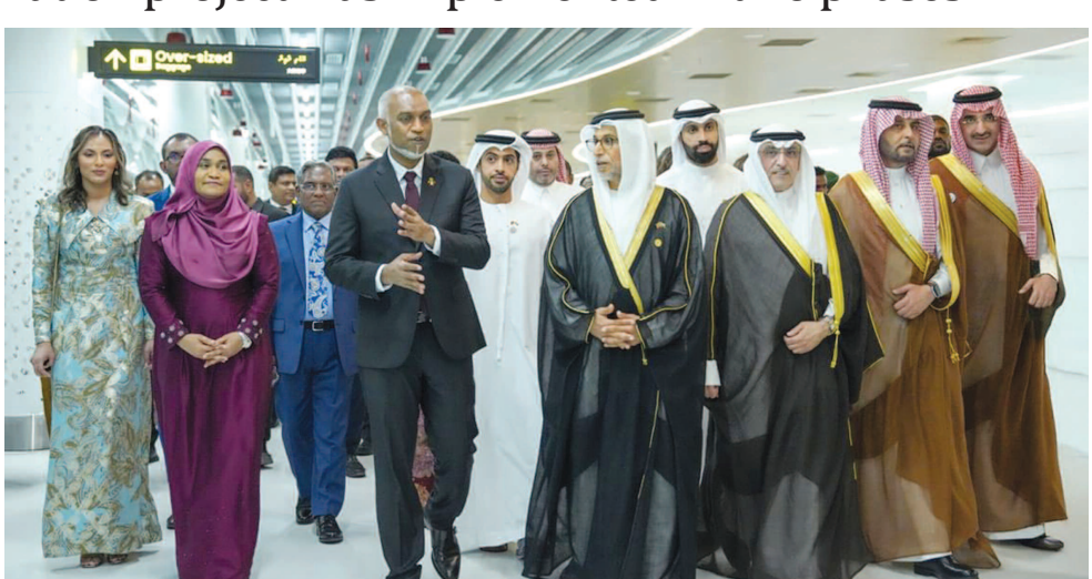
ADFD's partnership with Maldives dates to 1978. Over the past four decades, the fund financed 11 projects with a total investment of AED1.11b, spanning across key sectors including transportation, tourism, healthcare, and energy

With a total investment of AED 330.5 million (USD 90 million) from ADFD, the project implemented two phases, receiving co-financfrom Saudi Fund for Development, Kuwait Fund for Arab Economic Development, and OPEC Fund for International Development. This cooperation