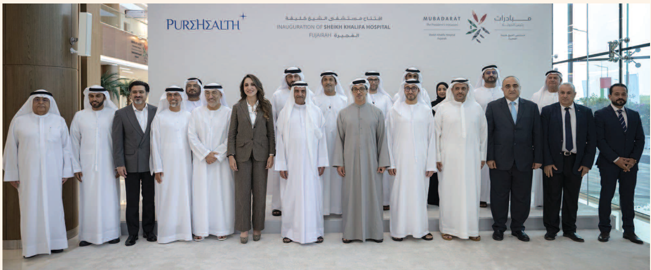
His Highness Sheikh Hamad bin Mohammed Al Sharqi, Supreme Council Member and Ruler of Fujairah, and His Highness Sheikh Mansour bin Zayed Al Nahyan, Vice President, Deputy Prime Minister and Chairman of the Presidential Court, officially inaugurate Sheikh Khalifa Hospital in Fujairah on Tuesday

Their Highnesses, accompanied by several officials, toured the hospital's facilities, including centres of excellence, operating theatres, intensive care units, laboratories and inpatient wards. The hospital features three medical centres of excellence: the Burn Treatment Centre, the Rehabilitation Centre and the Trauma Treatment Centre, all