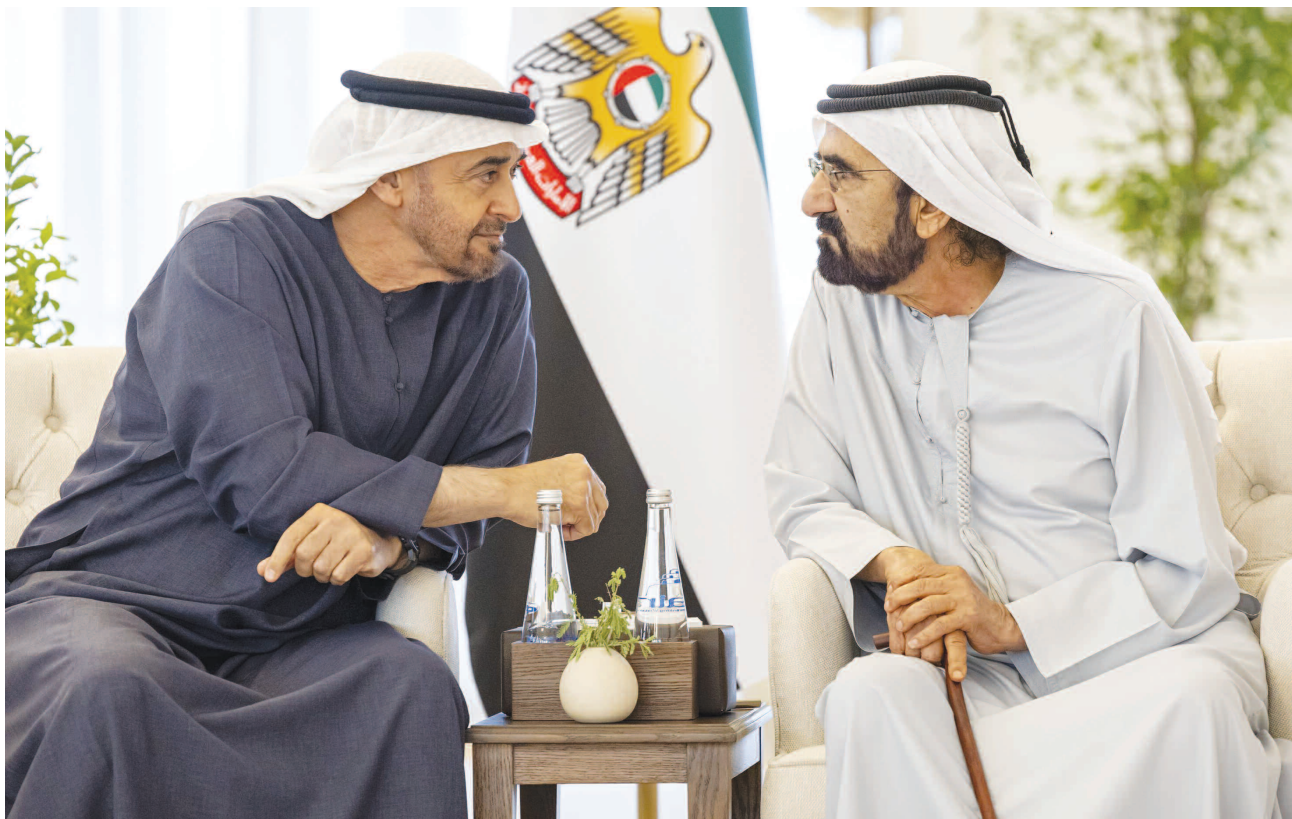
UAE President His Highness Sheikh Mohamed bin Zayed Al Nahyan with His Highness Sheikh Mohammed bin Rashid Al Maktoum, Vice President and Prime Minister of the UAE and Ruler of Dubai, at Qasr Al Bahr in Abu Dhabi on Tuesday