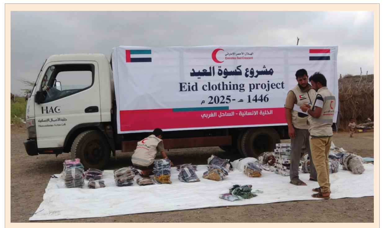
Emirates Red Crescent initiative aims to provide Eid garments to 35,000 families, including the poor, the sick, orphans, and displaced persons in both regions