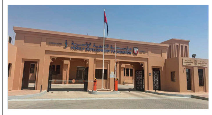
The initiative aims to provide social services to senior citizens, residents and individuals approaching retirement