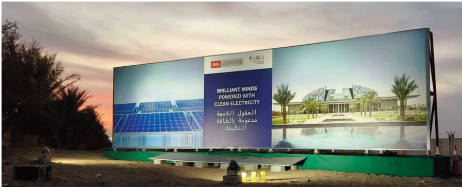
Since its inception in January 2020, TAQA Energy Services has been at the forefront of transforming Abu Dhabi's power and water sectors

TAQA Energy Services, a subsidiary of the Abu Dhabi National Energy Company (TAQA), announced on Wednesday the completion of the third phase of the 9000-kilowatt peak (kWp) solar photovoltaic (PV) project at the United Arab Emirates University's (UAEU) campus. The 14,400 advanced solar panels, strategically installed across 84,000 square metres, can generate 18.7 million kilowatt-hours (kWh) of renewable energy annually, supplying 30 percent of the university's electricity needs and curbing carbon dioxide emissions by over 8,000 tonnes each year.