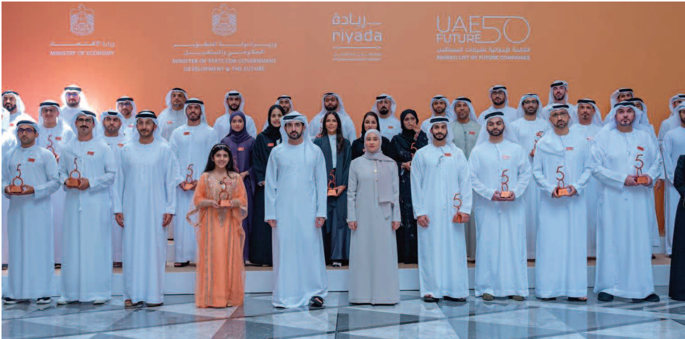
HH Sheikh Hamdan bin Mohammed bin Rashid Al Maktoum, Crown Prince of Dubai, Deputy Prime Minister and Minister of Defence, while witnessing the launch of the 'UAE Future 50' initiative, featuring a list of future-focused Emirati companies in Dubai on Wednesday