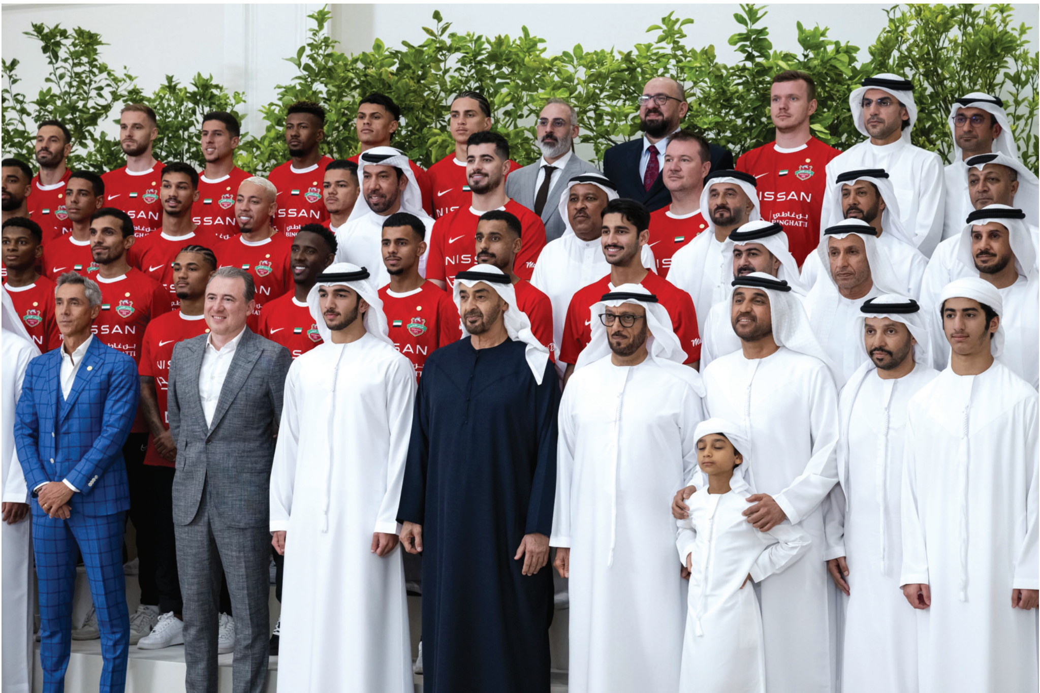
UAE President His Highness Sheikh Mohamed bin Zayed Al Nahyan with the Shabab Al Ahli football team at Qasr Al Bahr in Abu Dhabi on Wednesday