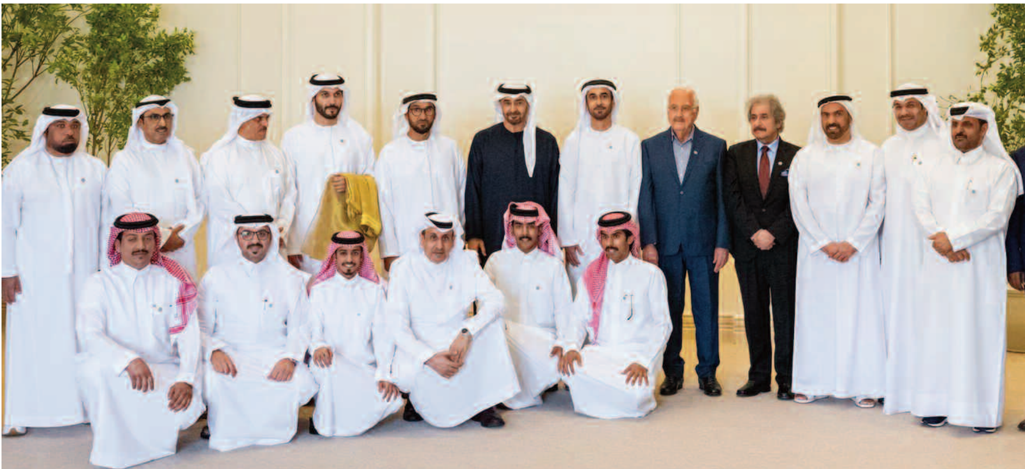
UAE President His Highness Sheikh Mohamed bin Zayed Al Nahyan with the winners of the 11th season of the Prince of Poets and Million's Poet competitions, as well as the fourth season of the Al-Mankous programme, along with their respective judges at Qasr Al-Bahr in Abu Dhabi on Wednesday