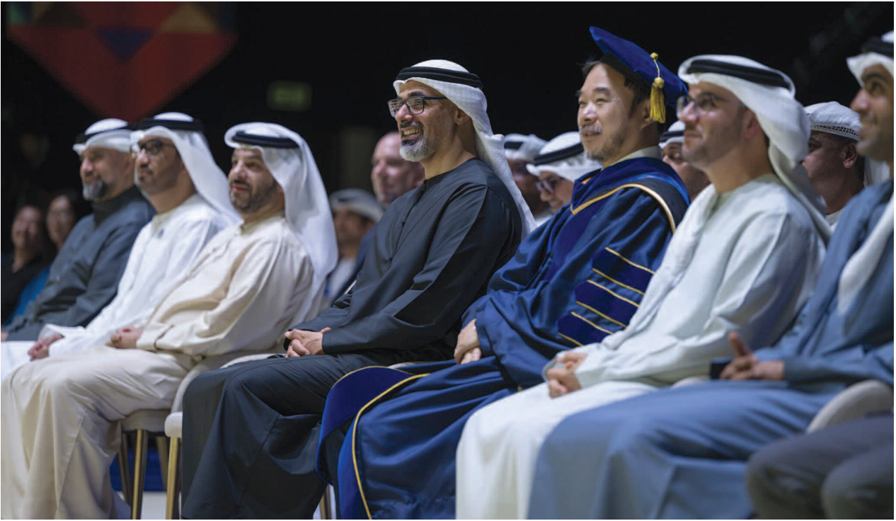
HH Sheikh Khaled bin Mohamed bin Zayed Al Nahyan, Crown Prince of Abu Dhabi and Chairman of the Abu Dhabi Executive Council, while attending the 2025 commencement ceremony of Mohamed bin Zayed University of Artificial Intelligence (MBZUAI) in Abu Dhabi on Wednesday

UAE, EU continue talks on Cepsa DUBAI/ WAM Dr Thani bin Ahmed Al Zeyoudi, Minister of State for Foreign Trade, welcomed Maroš Šefčovič, EU Commissioner for Trade and Economic Security, to the UAE for ongoing talks regarding Comprehensive Economic Partnership Agreement between the UAE and the EU. The visit also included an investment roundtable with representatives from leading private sector companies aimed at exploring opportunities for increased collaboration and investment flows between the EU and UAE. The UAE-EU CEPA is poised to be a significant milestone in strengthening economic ties and unlocking new avenues for trade and cooperation. ■ For full story, read www.gulftime.ae