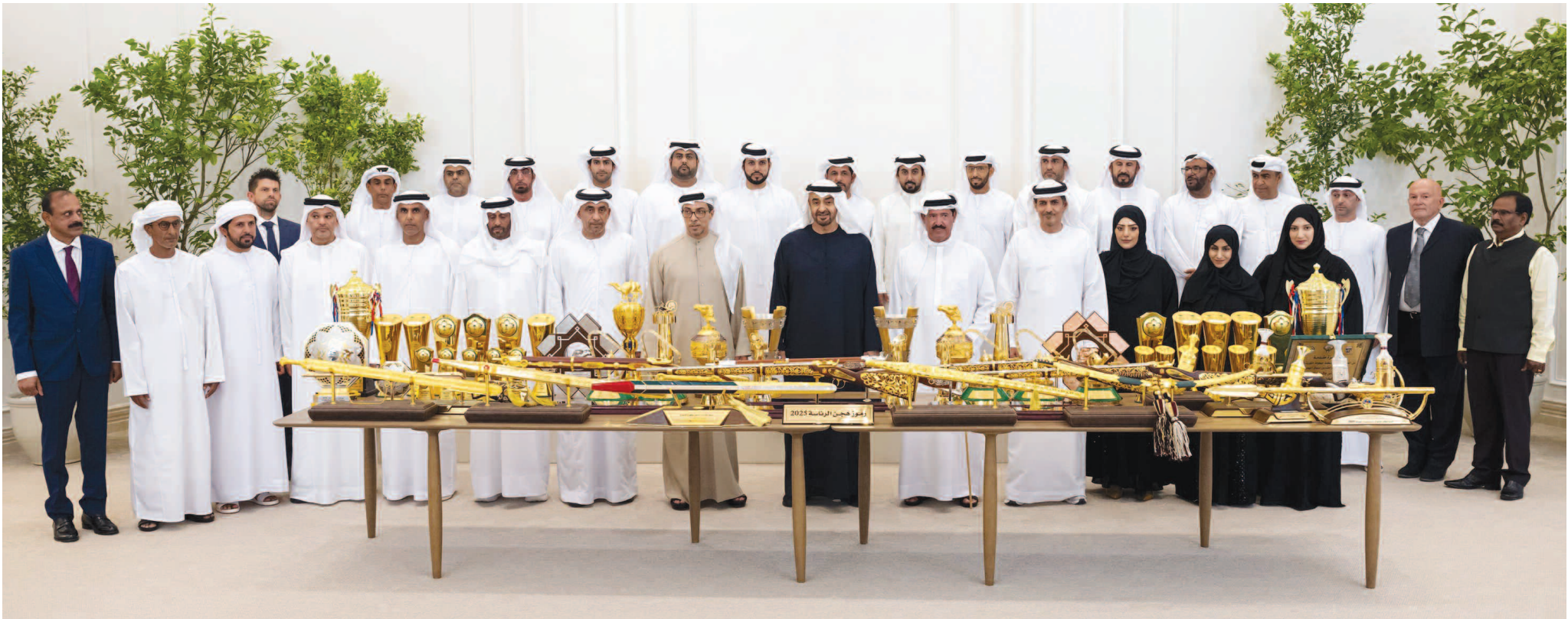
UAE President His Highness Sheikh Mohamed bin Zayed Al Nahyan with the Presidential Camel Racing Team at Qasr Al-Bahr in Abu Dhabi, in the presence of His Highness Sheikh Mansour bin Zayed Al Nahyan, Vice President, Deputy Prime Minister and Chairman of the Presidential Court, on Wednesday

UAE President receives Presidential Camel Racing Team His Highness Sheikh Mohamed bin Zayed was briefed on the team’s key achievements during the 2024–2025 season and its successes in various festivals and competitions held across the UAE and other GCC countries