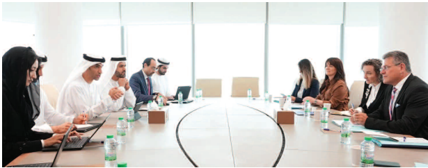
The EU is already one of the UAE’s key trading partners, accounting for 8.3% of non-oil trade. In 2024, non-oil trade between the two reached US$67.6 billion, representing a growth of 3.6% over 2023 —WAM

UAE, EU continue talks on Cepsa DUBAI/ WAM Dr Thani bin Ahmed Al Zeyoudi, Minister of State for Foreign Trade, welcomed Maroš Šefčovič, EU Commissioner for Trade and Economic Security, to the UAE for ongoing talks regarding Comprehensive Economic Partnership Agreement between the UAE and the EU. The visit also included an investment roundtable with representatives from leading private sector companies aimed at exploring opportunities for increased collaboration and investment flows between the EU and UAE. The UAE-EU CEPA is poised to be a significant milestone in strengthening economic ties and unlocking new avenues for trade and cooperation. ■ For full story, read www.gulftime.ae