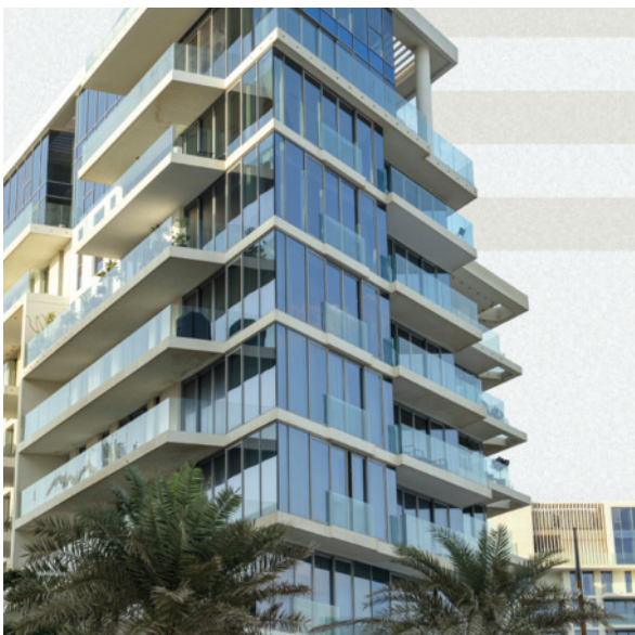
Adrec's report highlighted continued activity in Foreign Direct Investment (FDI), with 384 transactions valued at AED1.582 billion concluded by investors from 68 nationalities in Q1, 2025 —WAM

The report highlighted continued activity in Foreign Direct Investment (FDI), with 384 transactions val-