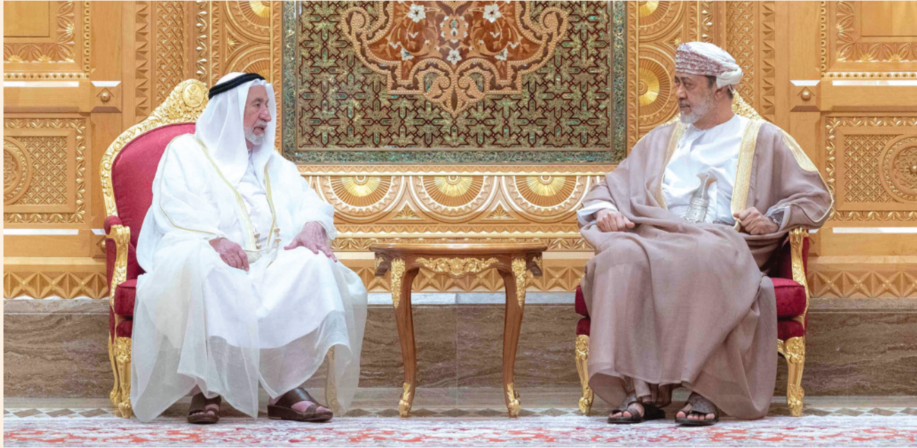
His Highness Sheikh Dr Sultan bin Mohammed Al Qasimi, Supreme Council Member and Ruler of Sharjah, with His Majesty Sultan Haitham bin Tariq of Oman at Al Alam Palace in Muscat, Oman, on Thursday

He also praised His Highness' latest historical work, "The Por-