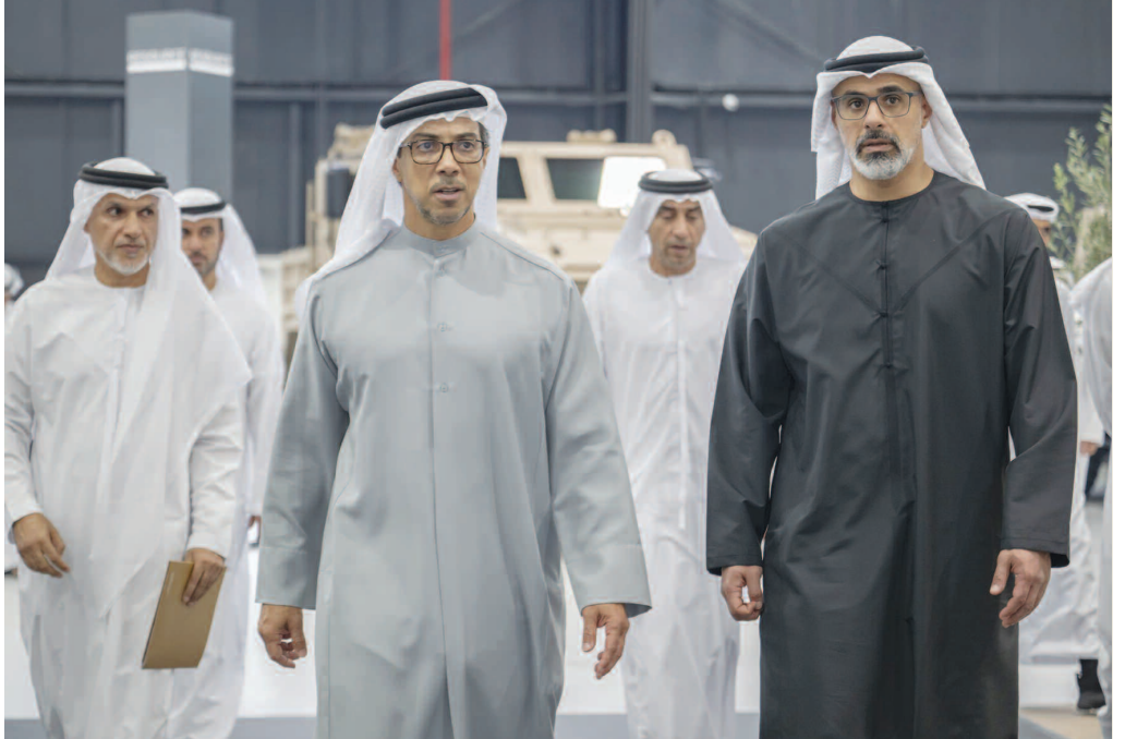
His Highness Sheikh Mansour bin Zayed Al Nahyan, Vice President, Deputy Prime Minister, Chairman of the Presidential Court, and Chairman of the Board of Directors of Tawazun Council, with His Highness Sheikh Khaled bin Mohamed bin Zayed Al Nahyan, Crown Prince of Abu Dhabi and Chairman of the Abu Dhabi Executive Council, during the first meeting of the executive committee of Tawazun Council's board of directors for 2025, at Tawazun Defence Hall in Abu Dhabi on Thursday