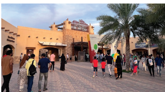
Al Ain Zoo is one of the UAE's and the region's leading educational and tourist destinations