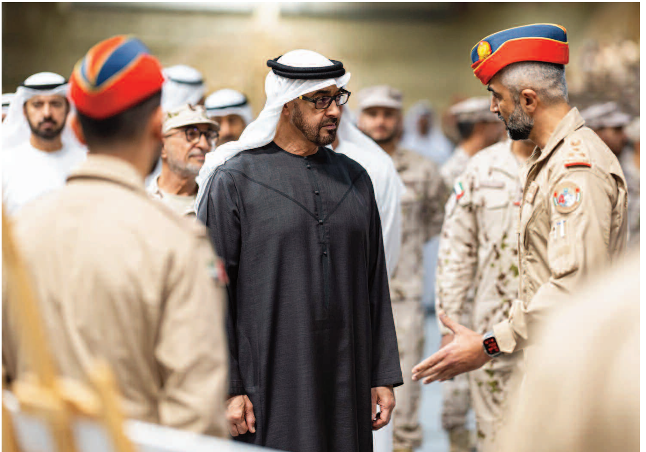
UAE President His Highness Sheikh Mohamed bin Zayed Al Nahyan during his visit to the Khalifa bin Zayed II Airborne Brigade Command in Dubai on Thursday