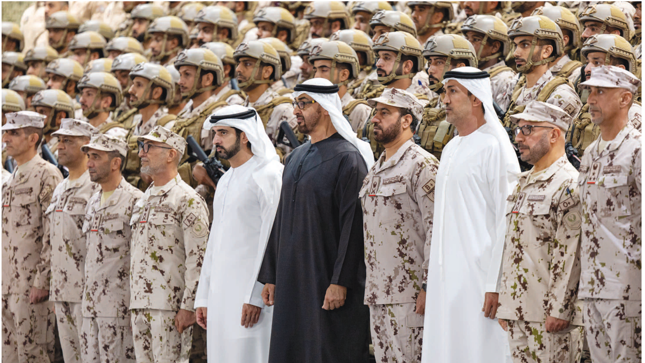
UAE President His Highness Sheikh Mohamed bin Zayed Al Nahyan during his visit to the Khalifa bin Zayed II Airborne Brigade Command in Dubai on Thursday