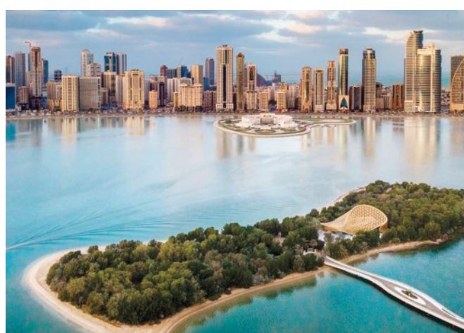
Sharjah recorded a total of 8,123 real estate sales transactions during Q1 2025, a 32.2 percent increase from 6,146 in Q1 2024 —WAM

A total of 8,123 sales transactions were recorded during the quarter, a 32.2 percent increase from 6,146 in Q1 2024. The transactions were spread across 169 areas, covering 46 million square feet and amounting to