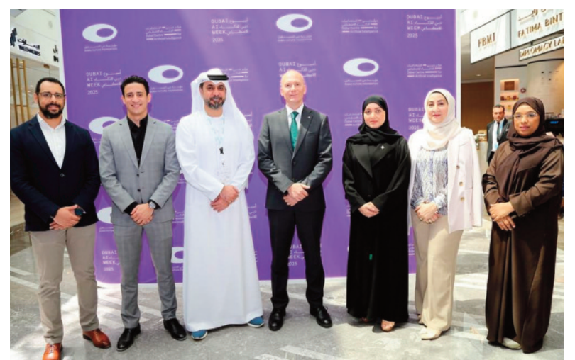
Dubai Health Authority's newly deployed system enables DHA to automatically analyse and interpret human emotions and understand customer needs through voice and digital channels —WAM