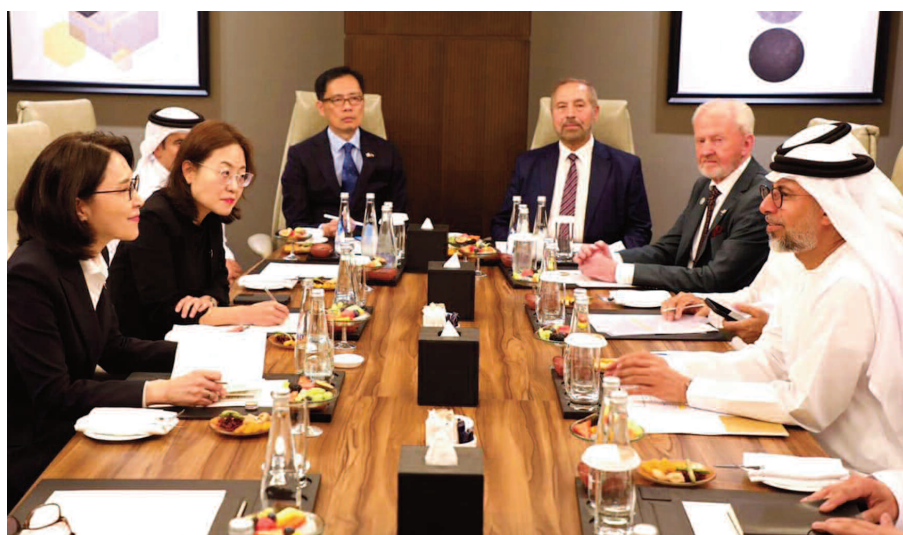
The sixth meeting of the High-Level Consultations Committee on Nuclear Cooperation between the Republic of Korea and the UAE in Abu Dhabi was chaired by Suhail bin Mohammed Faraj Faris Al Mazrouei, Minister of Energy and Infrastructure, and Kang Insun, Second Vice Minister of Foreign Affairs of Korea

He added that the High-Level Consultations Committee on Nuclear Cooperation has played a