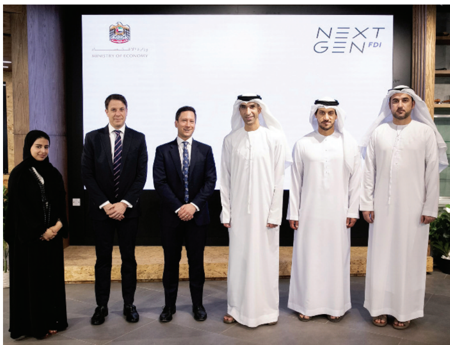
Welligence has offices in 10 cities around the world and the UAE represents its first foray into the Middle East —WAM

Their platform provides granular information on energy projects in 193 countries. Welligence has offices in 10 cities around the world and the UAE represents its first foray into the Middle East.