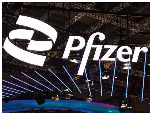
Pfizer's new research and development (R&D) centre in Beijing is situated at BioPark in the Beijing Economic-Technological Development Area (BDA)

Multinational pharmaceutical firms are increasingly