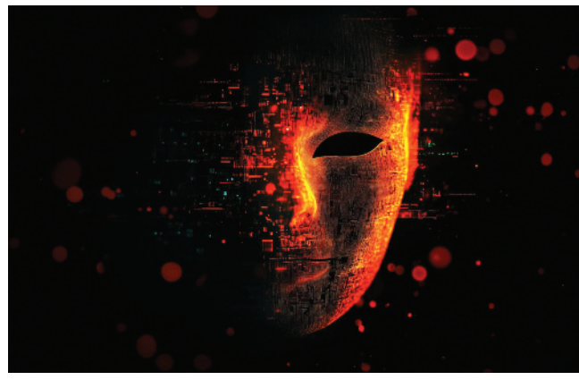
Edge's UNMASK cyber solution enables users to identify and counter the growing threat of malicious online activities —WAM

EDGE, one of the world's leading advanced technology and defence groups, has announced the launch of UNMASK, a powerful cybersecurity solution offered by its entity ORYXLABS, a global provider of advanced digital solutions designed to help enterprises monitor, secure, and optimise their networked environments. Developed to support law enforcement and national security organisations, this solution enables users to identify and counter the growing threat of malicious online activities carried out under the shield of digital anonymity. As encrypted communication platforms and anonymous online services become increasingly exploited by threat actors, law enforcement and security agencies face critical