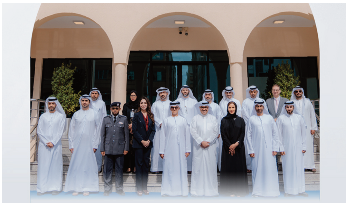
Run by Seha's expert healthcare teams, SEHA Abu Dhabi Dialysis Centre provides free dialysis care for those living with kidney failure