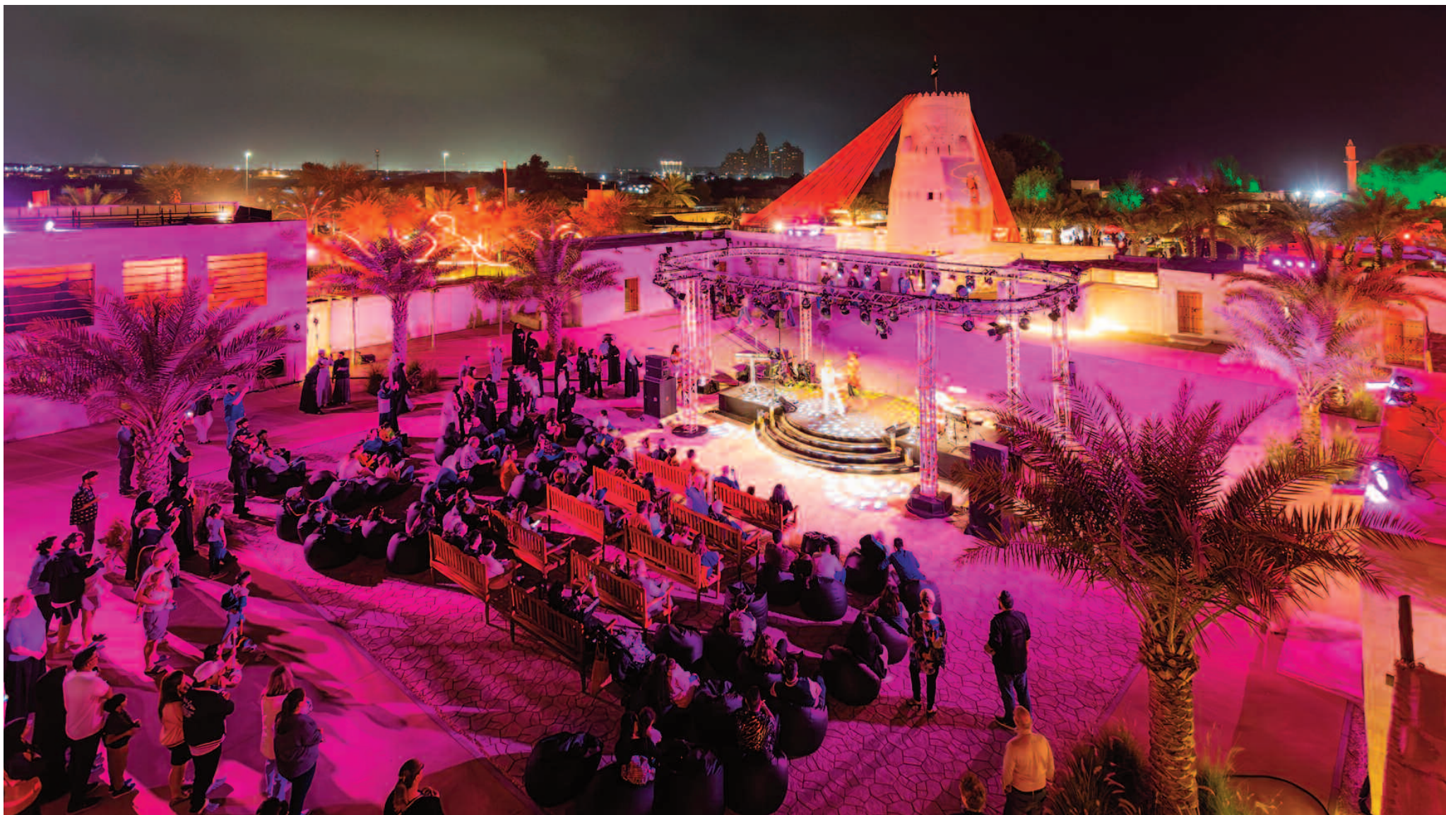
The Ras Al Khaimah Art 2025 Festival witnessed active engagement from seven diplomatic missions — United Kingdom, Netherlands, Germany, United States, China, Japan, and Brazil