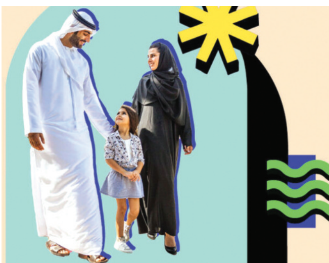
Ghaitah Al Ain 2025 is expected to draw crowds of families and visitors from across the UAE

The event reaffirms the Al Ain Region's commitment to community building and inclusivity, further consolidating its stature as an ideal destination for both residents and tourists. Among the festival's key attractions are the Echoes of Al Ain art installation zones offering sensory experiences, as well as the Heritage Zone highlighting Al Ain Region's culture. In addition, several live entertainment shows and performances will be held on the main stage, while the Art Oasis will feature curated art collections reflecting the creative spirit