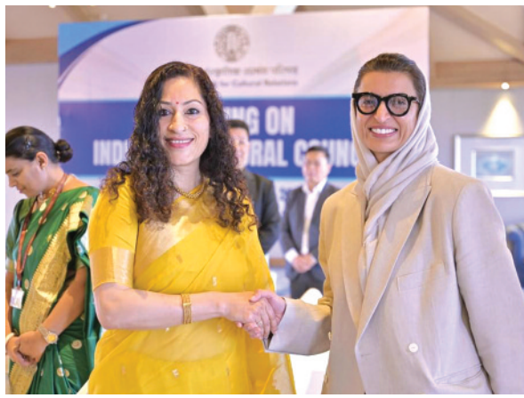
Noura bint Mohammed Al Kaabi, Minister of State, co-chaired a high-level delegation meeting with K Nandini Singla, Director General of the Indian Council for Cultural Relations (ICCR) in New Delhi, India on Sunday

A key highlight of the meeting was a discussion on