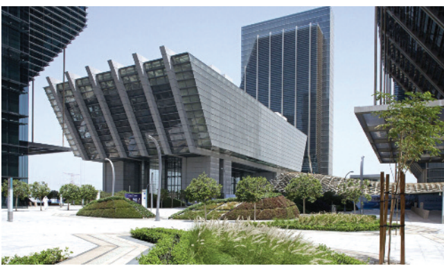
The Adio-Gushcloud partnership will drive IP development in media content, reinforcing Abu Dhabi's position as a leader in content development and digital rights management —WAM

Abu Dhabi Investment Office (ADIO) has entered into a strategic, multi-year partnership with Gushcloud International, a global creator management and licensing company, powered by AI. Under the agreement, Gushcloud will establish its EMEA and India regional headquarters in Abu Dhabi, advancing the emirate's rapidly growing digital creator economy and reinforcing its position as a global digital media hub.