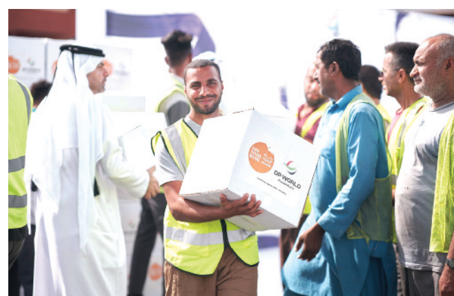
DP World Foundation's humanitarian initiatives, marking Zayed Humanitarian Day, include over 1,000 food supply boxes distributed across Mina Al Hamriya and Mina Al Marfaa