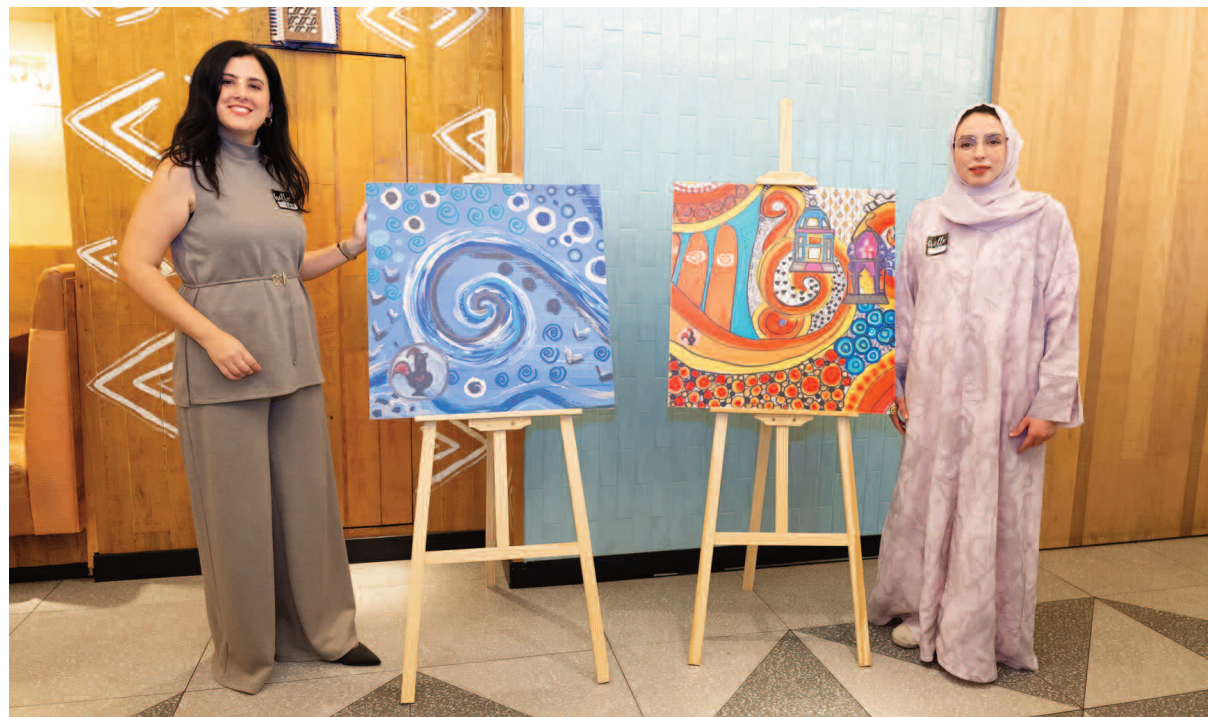
Dubai Autism Center, a pioneering non-profit organization established in 2001, is dedicated to raising awareness and providing specialized educational programs, therapies, and community engagement opportunities that make a lasting impact

Dubai Autism Center, a pioneering non-profit organization established in 2001, is dedicated to raising awareness and providing specialised educational programs, therapies, and community engagement opportunities that make a lasting impact. Through this initiative, Nando's UAE reinforces its dedication to inclusivity and social responsibility.