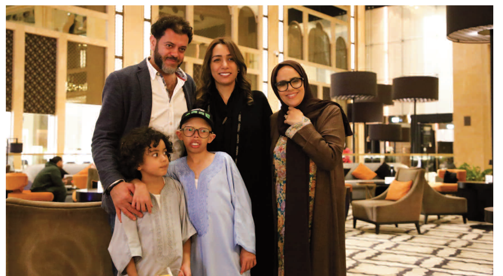
As The H Dubai continues to champion meaningful initiatives like the inclusive Iftar for Children on the Autism Spectrum, it reaffirms the power of hospitality in fostering a more inclusive and understanding world

vancing awareness and providing expert guidance for families and professionals, the Center cultivates a better understanding of