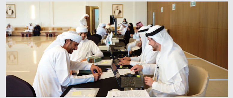
Al Saad residential project in Al Ain features five-bedroom villas spanning 505 square metres, built on plots of 2,025 square metres each

The AED993.7 million project includes 306 residential units, spread over 1.23 million square metres.