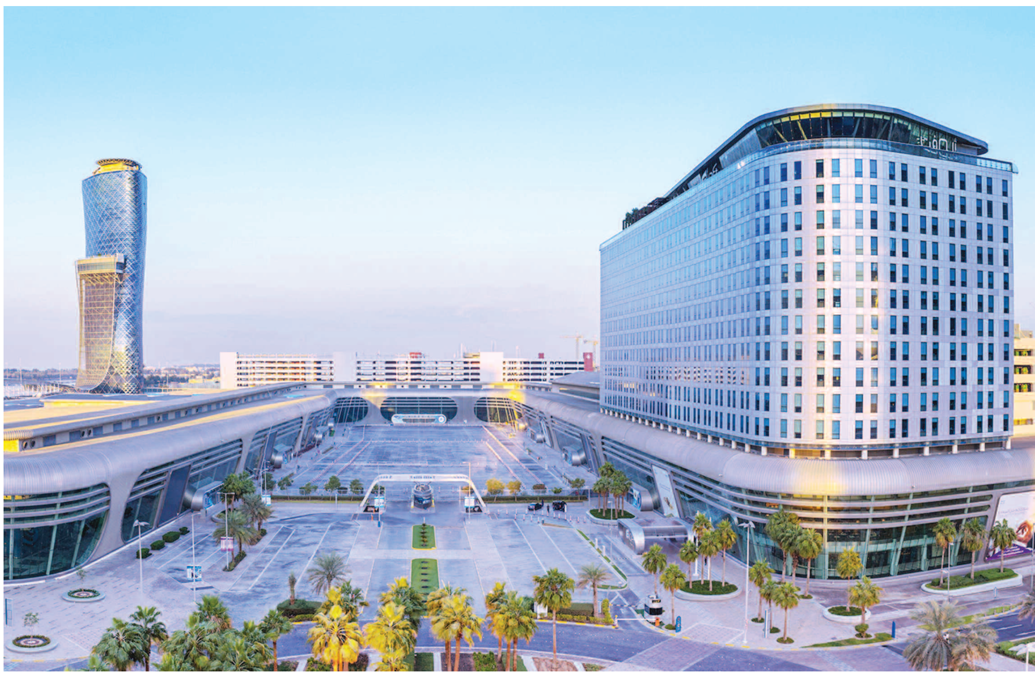
The ADNEC Centre Abu Dhabi became the first MICE venue in the Middle East to be powered by clean energy from the Emirates Water and Electricity Company (EWEC), setting a new standard for environmental leadership in the region