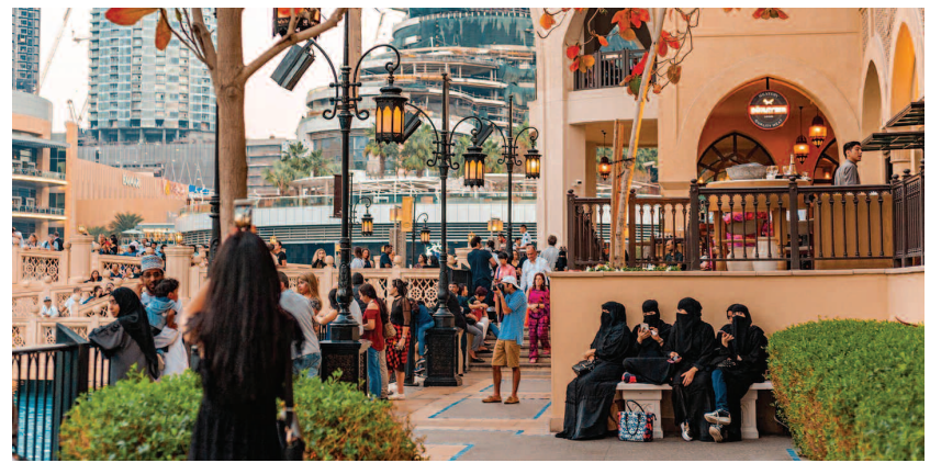
The pact between Dubai Culture and Arts Authority and Dubai Municipality to transform public spaces into artistic landmarks will contribute to transforming the emirate into an open-air global art gallery accessible to all

The MoU underscores the shared commitment of Dubai Culture and Dubai Municipality to expanding cooperation, strengthening communication channels, and exchanging best practices and experiences in identifying suitable locations for displaying artworks and artistic installations. This initiative will contribute to transforming Dubai into an open-air global art gallery accessible to all. Under the agreement, Dubai Culture will determine the number of artworks and installations to be implemented annually within a set timeframe, aligning with the city's beautification plan. Meanwhile, Dubai Municipality will be responsible for selecting proposed showcasing sites and coordinating with government and pri-