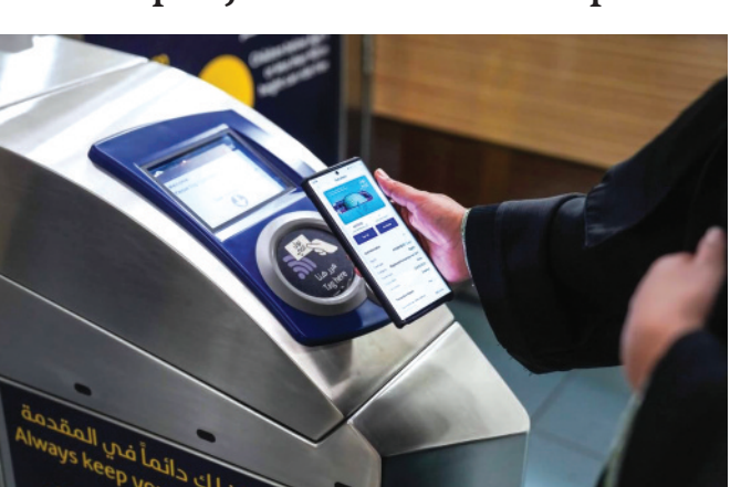
The RTA's nol system upgrade will transition from the existing card-based ticketing system to the more advanced account-based ticketing (ABT) technology

"In the third and final phase, the system upgrade will be completed, enabling the acceptance of alternative payment methods, including bank cards and digital wallets, for public