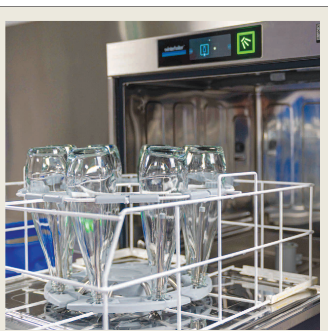
Opened in January 2025, the new bottling room is set to eliminate 1,097,328 single-use plastic bottles per year from Beach Rotana Abu Dhabi's operations