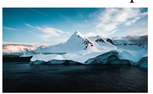
\textbf{BEIJING} \, / \, \text{WAM}

Chinese scientists have successfully conducted an ice-cap detection experiment in Antarctica using a domestically developed ultra-wideband hyperspectral microwave radiometer, as reported by China's 41st Antarctic expedition team.