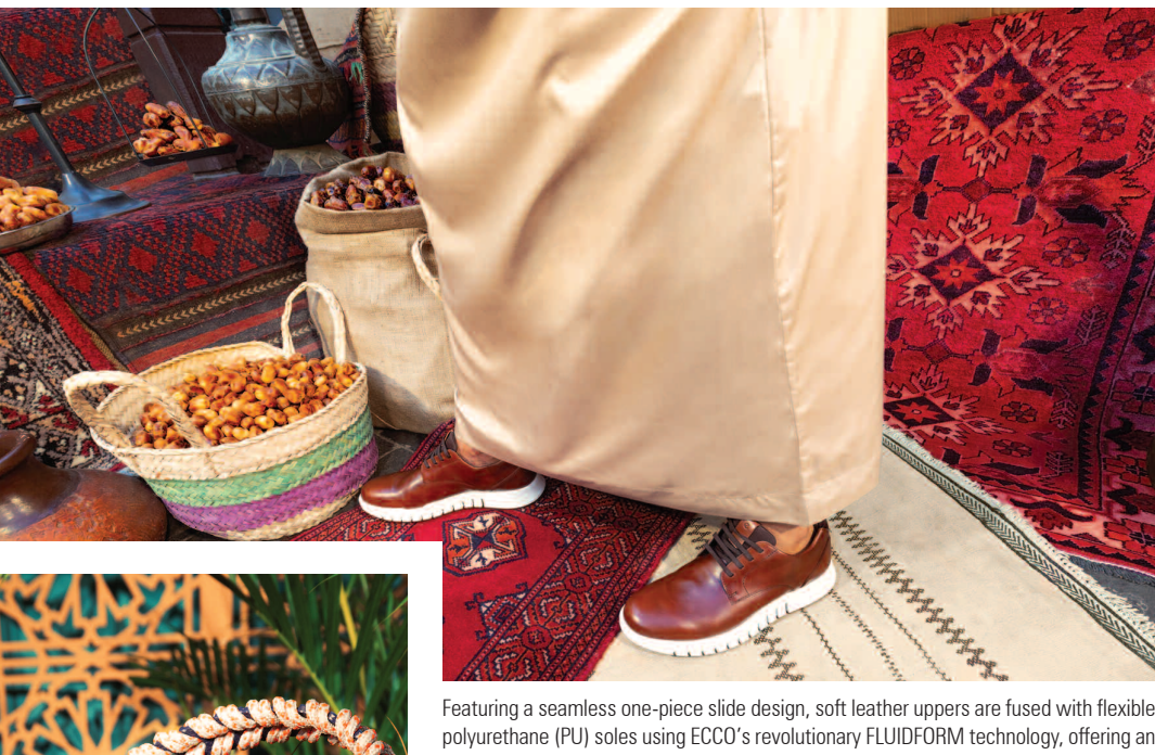
polyurethane (PU) soles using ECCO's revolutionary FLUIDFORM technology, offering an ultra-cushioned feel with every stride