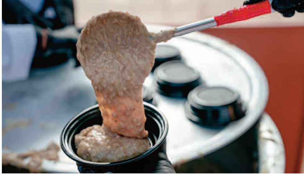
Among the heritage-focused events, Al Ain Oasis will host Ramadan's Harees every Friday, reviving the tradition of preparing and distributing Harees, a staple Emirati dish

Meanwhile, Before Suhoor at Bait Mohammed bin Khalifa will offer a blend of cultural entertainment and interactive experiences every weekend until March 15. The evenings will feature themed nights showcasing Emirati, Syrian, Pakistani, and Iraqi music and