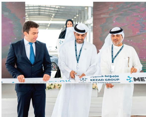
Located in KEZAD Free Zone, the Metal Park Storage Hub will offer world-class storage solutions and support services for businesses in the region

Khalifa Economic Zones Abu Dhabi – KEZAD Group and its strategic client Metal Park announced the launch of the first phase of Metal Park's state-of-the-art Storage Hub in KEZAD. The Storage Hub will offer world-class storage solutions and support services for businesses in the region.