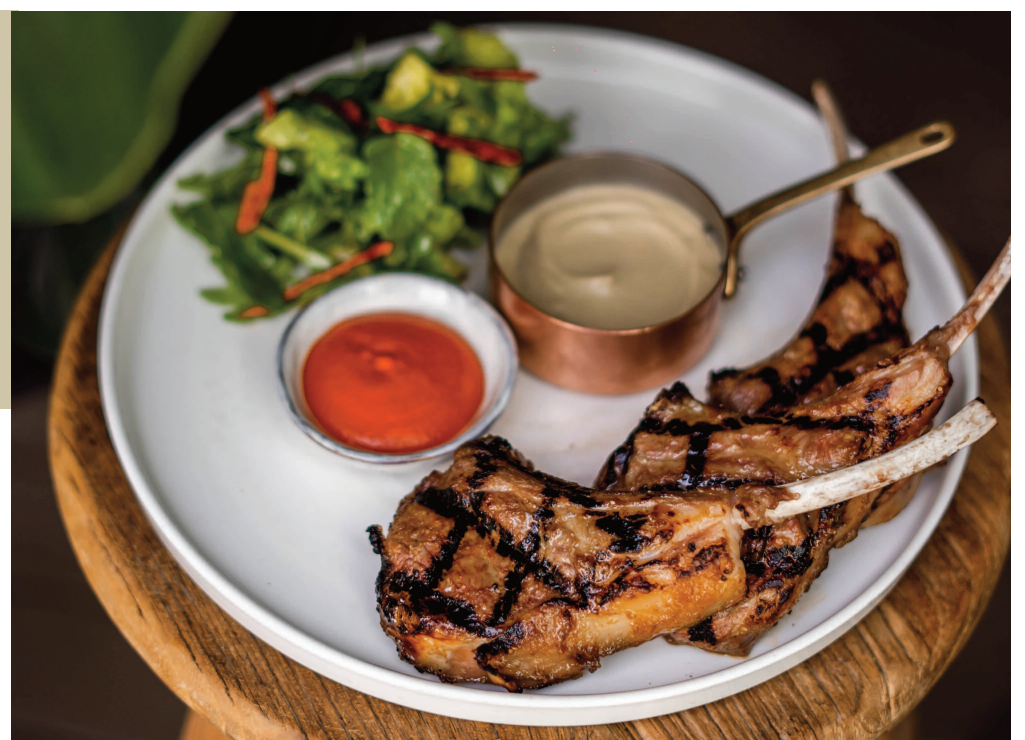
As well as dates packed with sweetness and soul-warming soups to break your fast, Terra's culinary team serves exciting starters such as watermelon salad with heirloom tomatoes, feta and jalapenos for a surprising kick

As well as its welcoming atmosphere and contemporary interior design, Terra is known for its mocktails. Refreshing, inventive and only gently sweetened, the menu includes a new