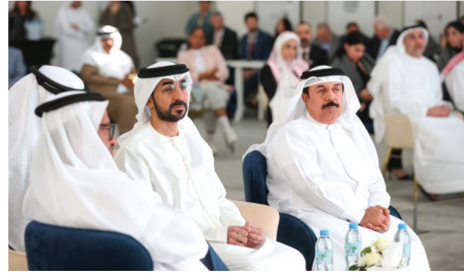
ALC's Emirati Publishers Forum saw the launch of the first initiative of the centre's Sustainable Reading Campaign, in line with National Reading Month under the theme 'UAE Reads'