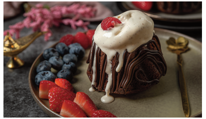
As the sun sets, The Majlis welcomes guests to a generous iftar featuring a rich selection of seasonal specialties, global flavours, and freshly prepared dishes from live cooking stations