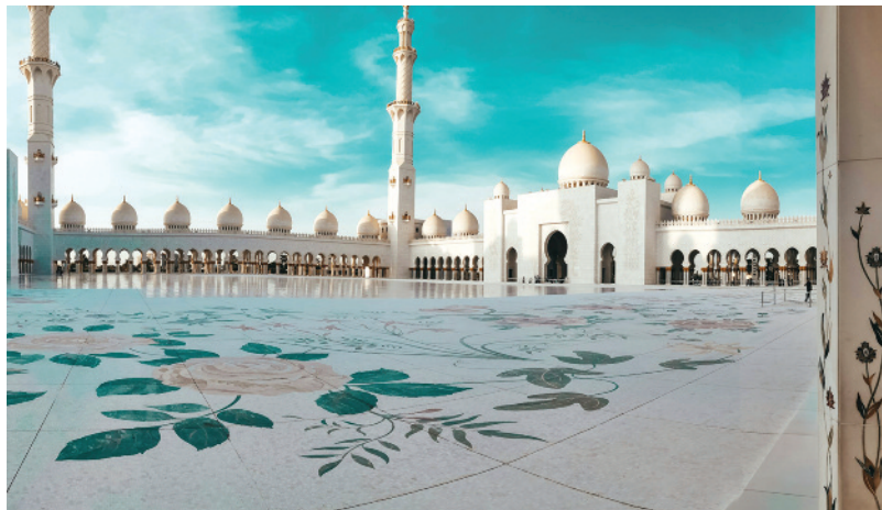
Among Sheikh Zayed Grand Mosque — Abu Dhabi's total worshippers, 281,941 attended Friday prayers while 709,875 participated in daily prayers

The Sheikh Zayed Grand Mosque Centre recorded that 81% of its visitors in 2024 were international tourists, while 19% were residents of the UAE. Among global visitors, Asia led with 52%, followed by Europe (33%), North America (8%), Africa (3%), South America (3%), and Australia (1%). In terms of visitor nationalities, India topped the list with 841,980 visitors,