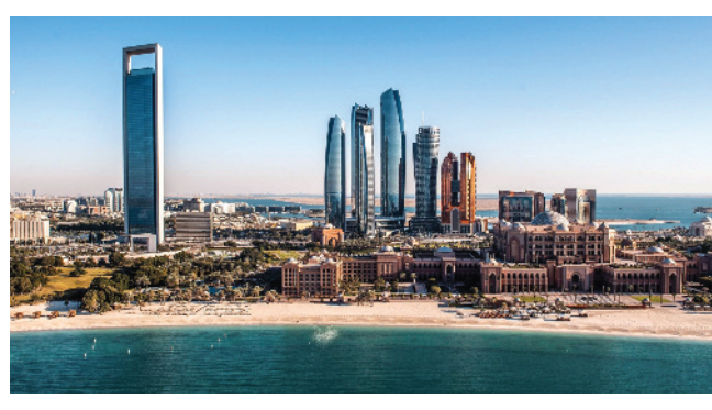
Since its inception in 2023, the partnership between Mubadala and Alpha Dhabi has focused on identifying and capitalising on compelling credit opportunities in sectors and geographies that offer attractive risk-adjusted returns

Mubadala Investment Company and Alpha Dhabi Holding PJSC on Monday announced that their joint venture, which was launched in 2023, has reached a significant milestone, building an approximate $1 billion portfolio in global credit opportunities. This achievement marks a key step towards the partnership's goal of deploying up to $2.5 billion by 2028, underscoring its strong momentum and progress. The joint venture, which is based in Abu Dhabi Global Market and is 80% owned by Mubadala with Alpha Dhabi owning the remaining 20%, leverages Mubadala's long-term and strategic partnership with Apollo (NYSE: APO), one of the