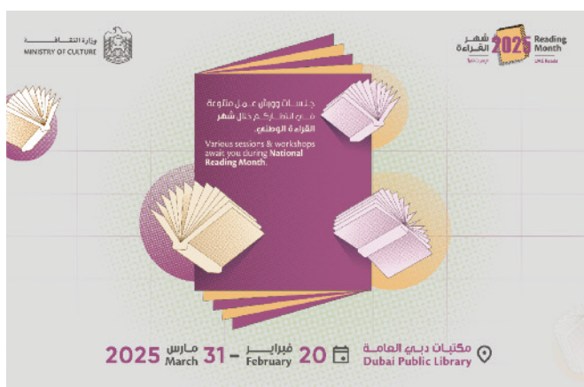
Throughout Reading Month, Dubai Public Libraries will host literary discussions and storytelling events featuring notable authors and speakers