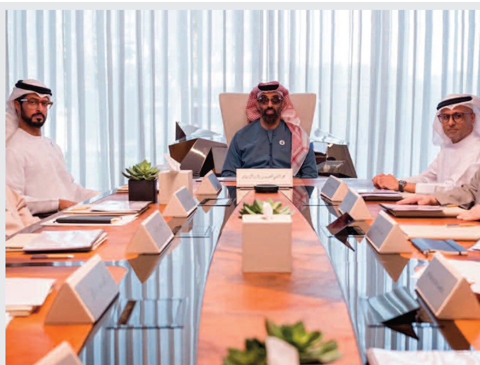
His Highness Sheikh Tahnoon bin Zayed Al Nahyan, Deputy Ruler of Abu Dhabi and Member of the Supreme Council for Financial and Economic Affairs (SCFEA), while chairing the board meeting of ADQ in Abu Dhabi on Monday