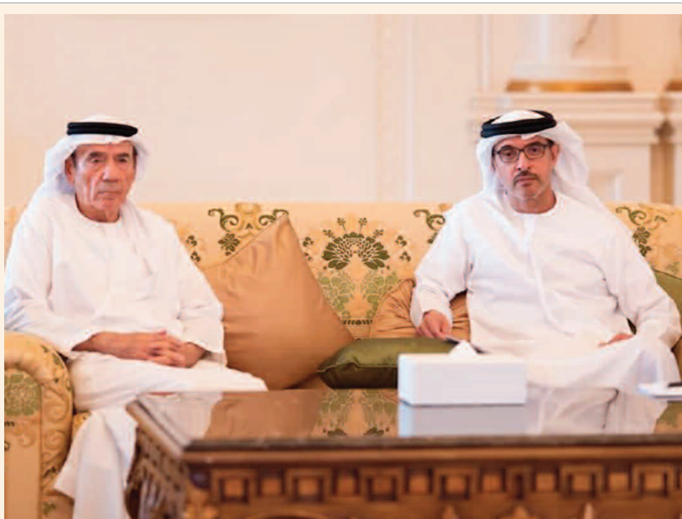
His Highness Sheikh Hazza bin Zayed Al Nahyan, Ruler's Representative in Al Ain Region, with a delegation from the United Arab Emirates University (UAEU) in Al Ain on Monday