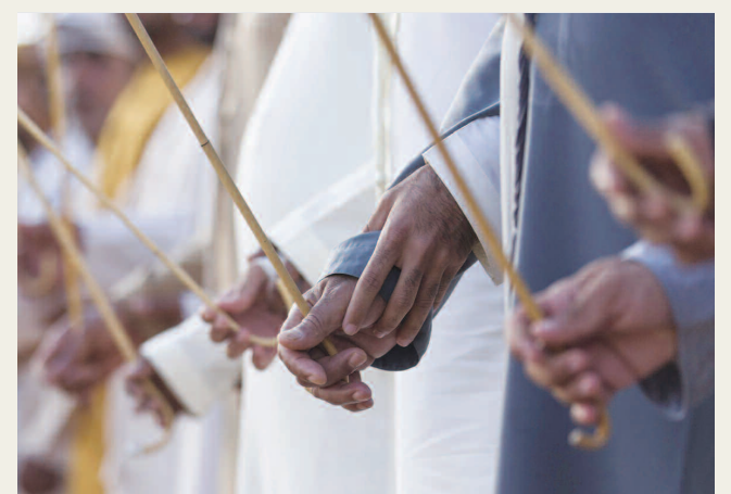
The Abu Dhabi Folk Arts Committee is responsible for preparing and executing the strategy to preserve and promote the performance of various Emirati folk arts, including Al-Yowla, Al-Harbia, Al-Razfa and Al-Ayyala, among others