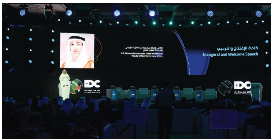
IDEX has evolved into one of the world's premier defence exhibitions, a platform where nations, industry leaders, and military professionals engage in dialogue, demonstrate technology, and build partnerships for a more secure world