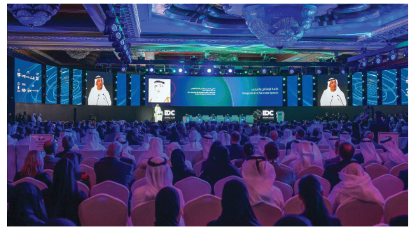
The International Defence Conference (IDC) 2025 brings together key decision makers, experts, and leaders from around the world —WAM