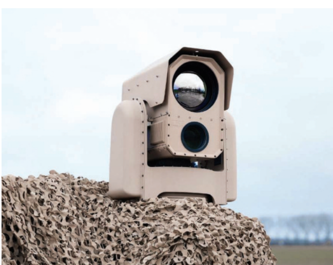
ATERMES' participation at IDEX 2025 underscores its dedication to forging deeper collaborations with regional partners and stakeholders, offering tailored, effective security solutions to meet the Middle East's evolving defense and security needs —WAM

In the realm of drone detection, SURICATE addresses the growing challenge posed by UAVs used for espionage and hostile activities. Equipped with multispectral sensors and AI-powered detection algorithms, the system ensures early identification and precise tracking of drones, even in highly complex environments.