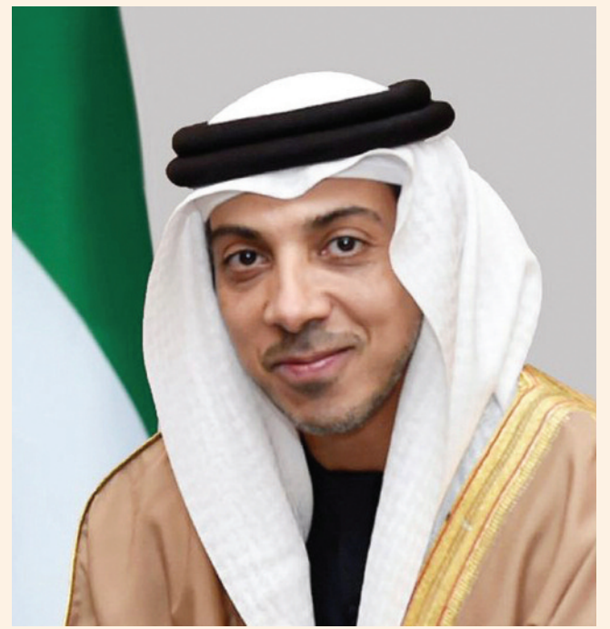
ABU DHABI / WAM